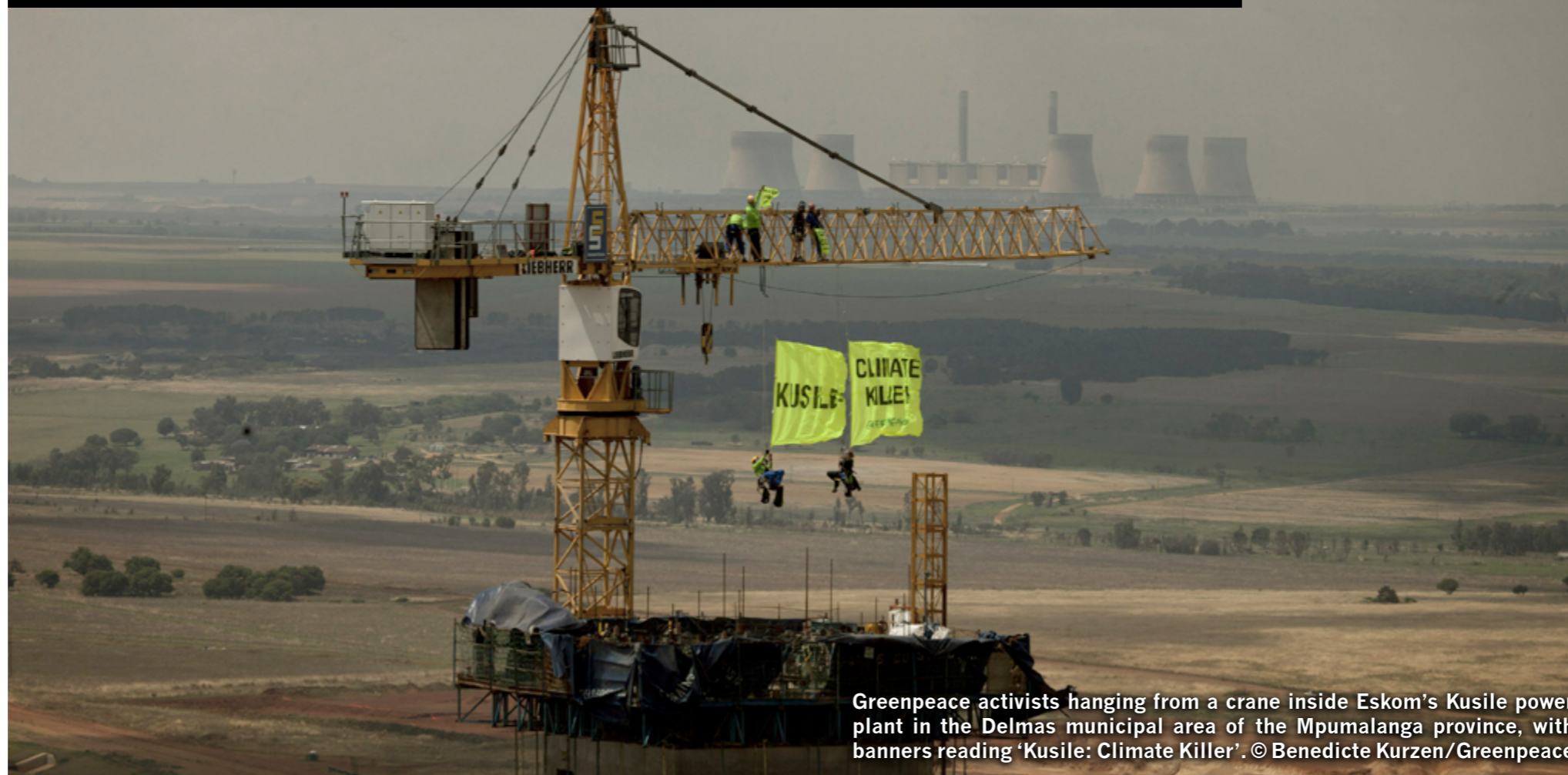
Greenpeace activists hanging from a crane inside Eskom's Kusile power plant in the Delmas municipal area of the Mpumalanga province, with banners reading 'Kusile: Climate Killer'.

Appalachian mountaintop removal operations" (emphasis added). At issue, however, is how effective these policies are proving to be when the bank's support for the coal industry is generally being maintained – and inevitably following from this are the bank's negative impacts on the global climate and local communities that also continue to stack up.