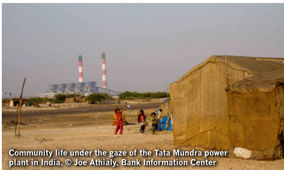
Community life under the gaze of the Tata Mundra power plant in India.