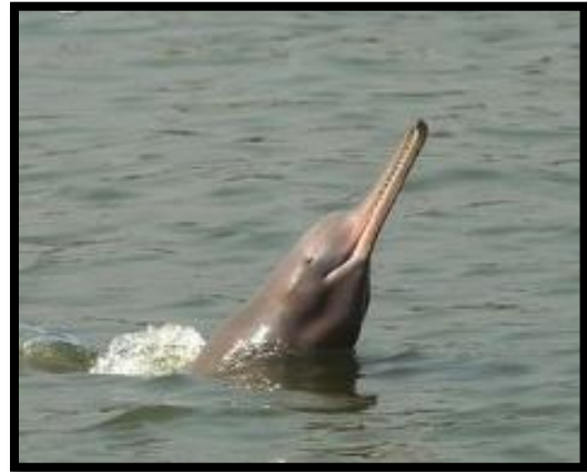
Irrawaddy dolphins (one pictured dead found after the 2014 oil spill) and Ganges river dolphins of the Sundarbans could be harmed by pollution from the power plants, and by increased dredging and shipping on the Pashur River. 86

Trace amounts of mercury can contaminate large bodies of water and remain in the soil for decades. 87 For example, the equivalent of one gram of mercury deposited from the atmosphere into a 20-acre lake each year can make the fish unsafe to eat. 88 Once in the ecosystem, mercury naturally converts to methylmercury, a highly toxic compound that builds up in organisms and increases in concentration with each level of the food chain; birds and mammals that eat contaminated fish and shellfish, like the Bengal tiger, Ganges and Irrawaddy dolphins, estuarine crocodiles, river terrapin, masked finfoot, and small clawed otters could have potentially high exposures to methylmercury. 89 Methylmercury has been found to bioaccumulate faster in water bodies like the Sundarbans with fluctuating water levels that