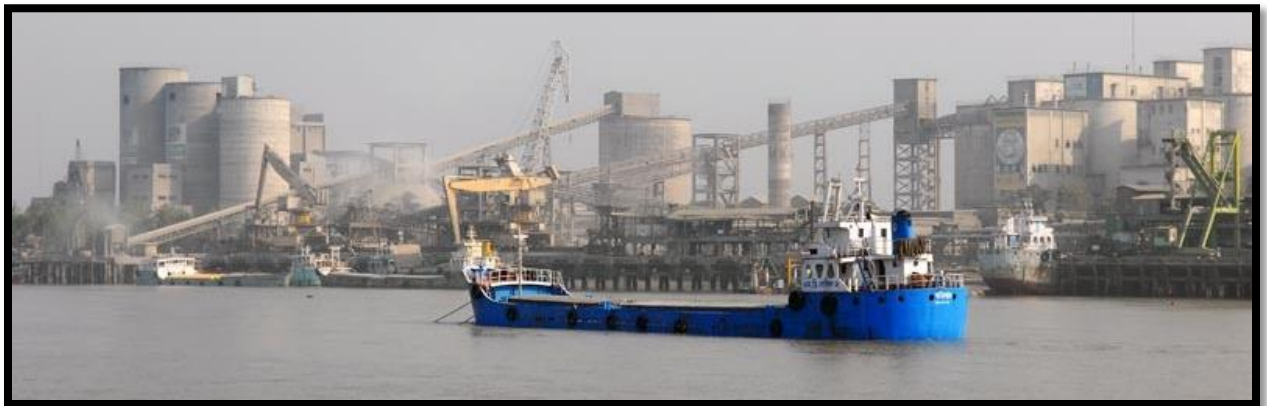
Industrial development and shipping are increasing along the Pashur River, including at Mongla port, pictured here. 52 The Rampal and Orion power plants will exacerbate these stresses on the Sundarbans ecosystem and its endangered wildlife.

The World Heritage Committee’s Statement of OUV recognizes many of these threats, noting that: “Over exploitation of both timber resources and fauna, illegal h[u]nting and trapping, and agricultural encroachment also pose serious threats to the values of the property and its overall integrity.” 50 The 2015 State of Conservation report of the World Heritage Committee also notes that “non-renewable energy facilities, salinity, and dredging of the Pashur River are a threat to the property.” 51