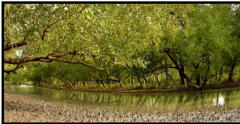
The Sundarbans. 2

The Sundarbans of Bangladesh (“the property”) is a World Heritage site “[b]estowed with magnificent scenic beauty and natural resources.” 1 This special place is facing imminent and substantial threats from the Rampal and Orion Khulna coal-fired power plants (“the projects”), two massive projects proposed to be constructed near the property that would require the alteration of Sundarbans waterways and would emit hundreds of thousands of tons of toxic coal ash and air pollutants into this fragile ecosystem each year. The Government of Bangladesh is moving rapidly forward with the projects in 2016, while at the same time ignoring almost every request from the World Heritage Committee to ensure that they do not undermine the property’s outstanding universal value. We are writing to urge the Committee to take immediate action to protect the property before construction proceeds further. We encourage the Committee to inscribe the property on the List of World Heritage in Danger, as it meets six of the eight relevant criteria for the List in Danger, and to urge Bangladesh to stop all activities associated with the power plants until the Committee has had the opportunity to fully evaluate the potential threats to the property. If the Committee does not act urgently, this exceptional part of the world’s natural heritage could be irreparably harmed.