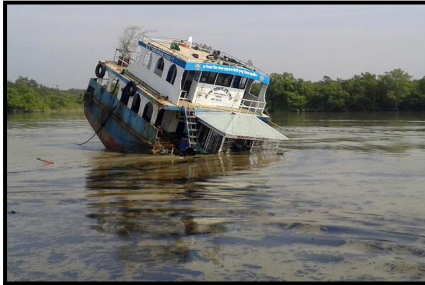
Since 2011, large commercial ships have been allowed into Sundarbans delta. There have been numerous accidents, including the sinking of this oil tanker in 2014, which spilled 350,000 liters of furnace oil. 23

In all three accidents, the government significantly delayed taking the necessary steps to protect these precious waterways from pollution. For example, newspapers reported that three days after the October 2015 accident there was still no sign of salvaging the wreck, or otherwise containing the toxic material. 24 As we explain in section II below, the inevitable increase in shipping accidents that will take place once the Rampal and Orion plants become operational, coupled with the government's inability to adequately respond to the accidents, poses a serious threat to the property.