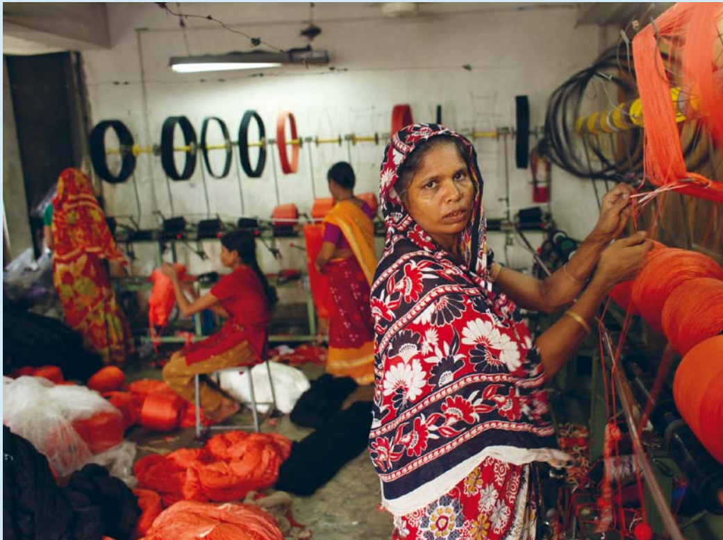
Workers in the Wool Tex Sweaters Limited in Shewrapara in Dhaka, Bangladesh is a major hub of global textile and clothing industries.

clothes”. 8 In October 2013, a fire raged at Aswad Composite Mills, a Gap supplier near Dhaka, Bangladesh. The fire left seven dead and more than 50 injured. To date, Gap has refused to compensate the victims and their families. 9 In May 2014, the small NGO ‘18 Million Rising’ launched a website parodying Gap’s “Do More” campaign, and as a hoax announced that Gap had finally agreed to compensate the Aswad fire victims. 10 Gap had the website taken down and issued a statement saying that it was, in fact, not doing more. 11