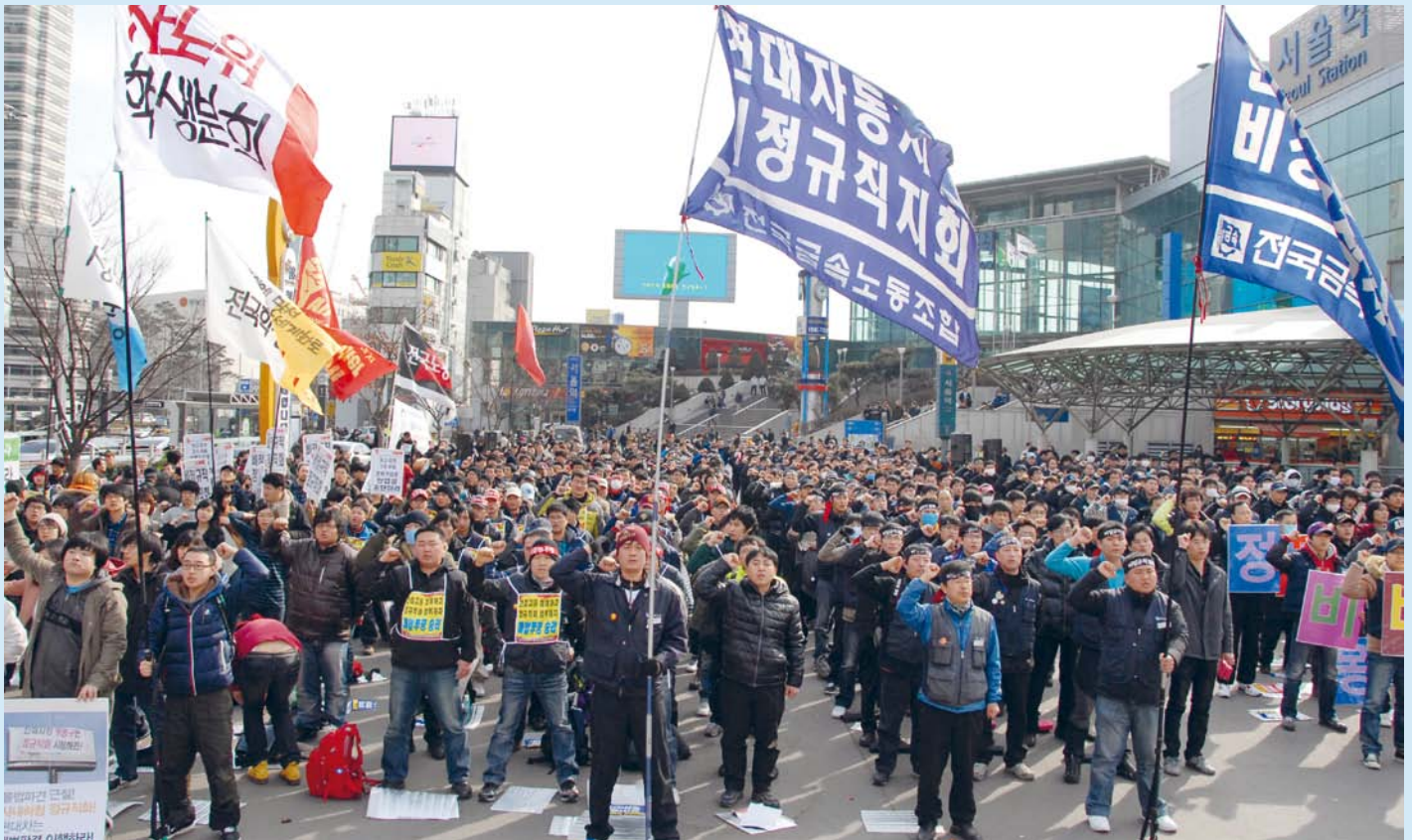
▲ Hyundai Workers' Protest in South Korea

In 2014, the German metalworkers' union IG Metall filed a complaint with the OECD 7 claiming the Hyundai Technical Center in Rüsselsheim, Germany 8 was in violation of the German Workers Constitution Act by disregarding the rights to information and decision of the works committee and of even undertaking salary cuts for committee members. 9