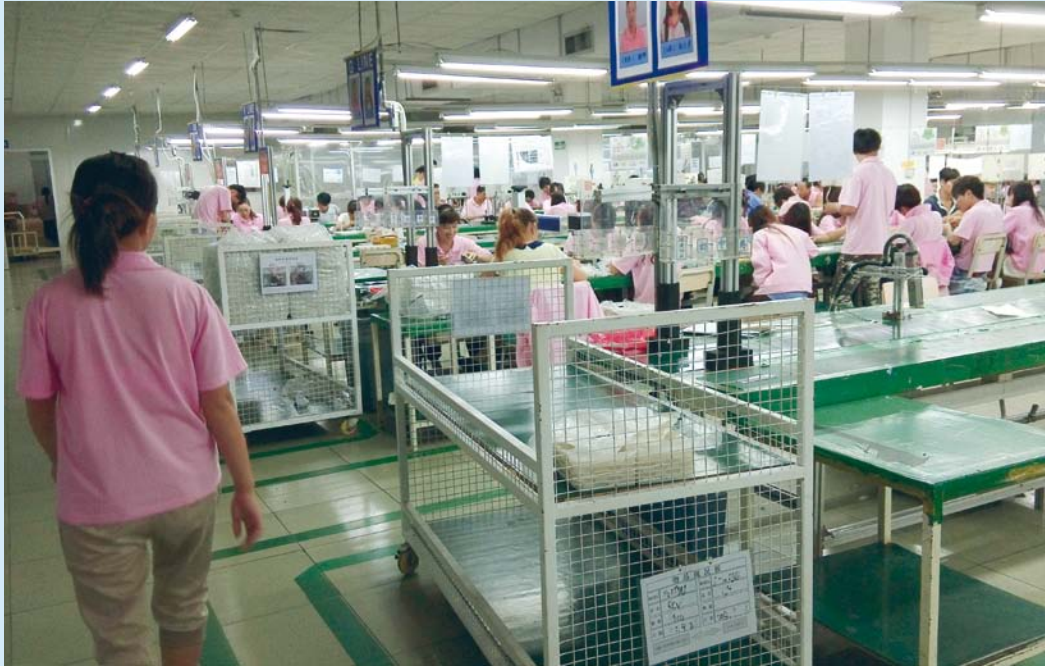
◀ Dongguan Shinyang Electronics's factory

the workers dissatisfaction led to a protest outside the Labour Department's main office in Manila by a number of groups including the Kilusang Mayo Uno (KMU), Anakbayan, Courage, Migrante, Kadamay and others. 15