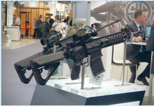
◀ SigSauer booth at Eurosatory 2014

In 2012 Walmart was involved in a serious corruption scandal in Mexico, bribing local officials to build a store adjacent to the historical pyramids of Teotihuacán, despite local opposition. 15