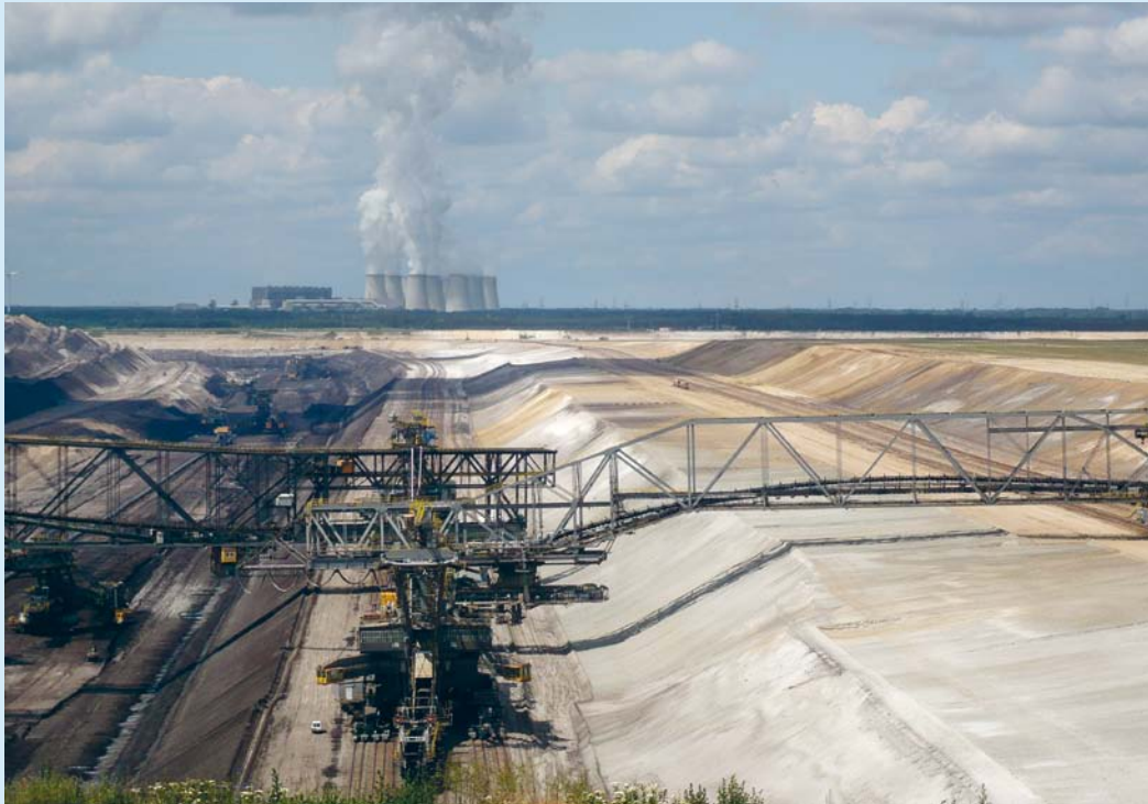
◀ Lignite mine at Jänschwalde, Germany, near the German Polish border.

of nuclear waste, stored in Brunsbüttel's underground caverns, revealed that they are in a disastrous condition. Almost every third vat of the examined 335 12 is severely damaged. Some of the vats are corroded to such an extent that they are leaking, turning the ground into pulp that is contaminated with the nuclear material, Caesium 137. The vats were not intended to be stored long term at Brunsbüttel but the final storage facility at 'Konrad' mineshafts has faced severe delays and will not now be complete until earliest, 2020. 13