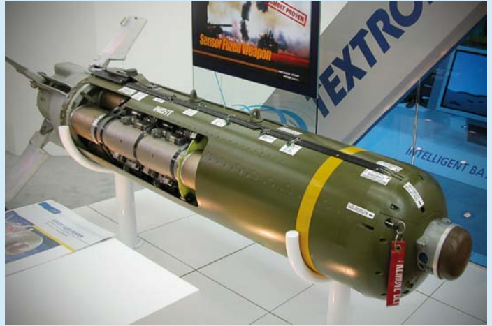
CBU 97/CBU105 Sensor Fuzed Weapon