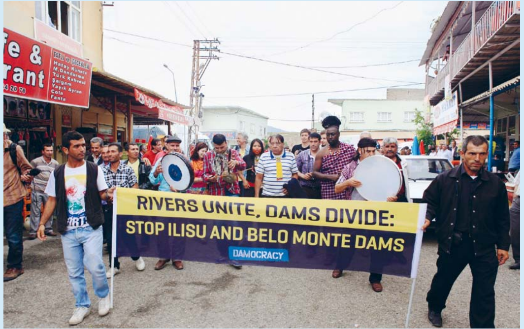
▲ Protestors March Against Destructive Dams In Turkey : Representatives of dam-affected communities and international organizations from South America, the Middle East, Europe, the US and Africa blocked the entrance to the construction site of the Ilisu Dam. The controversial development would flood Hasankeyf, a Bronze Age city and World Heritage site.