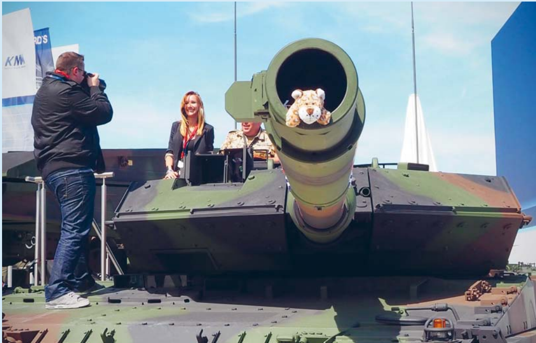
◀ Selling “Leo” to the World: Rheinmetall and Krauss Maffei presenting their battle tank Leopard2 at the Eurosatory 2014 exhibition in Paris.

Rheinmetall AG 12 have marketed their production of the 155mm “Assegai family” of artillery ammunition both at the IDEX weapon show in Abu Dhabi, 2013 and as part of Eurosatory in Paris, 2014. Rheinmetall offers the complete “155mm Assegai Artillery Ammunition” series, which includes insensitive munition (IM), high explosive (HE), conventional HE, screening smoke, illumination, infrared illumination, and many other projectiles. 13 Sources like the Jane’s Ammunition Handbook indicate that the 155mm Assegai family include cluster munitions that have been banned by the Convention on Cluster Munitions. 14