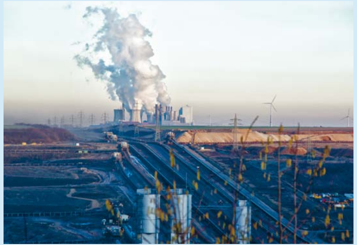
▲ Brown Coal Surface Mine Garzweiler