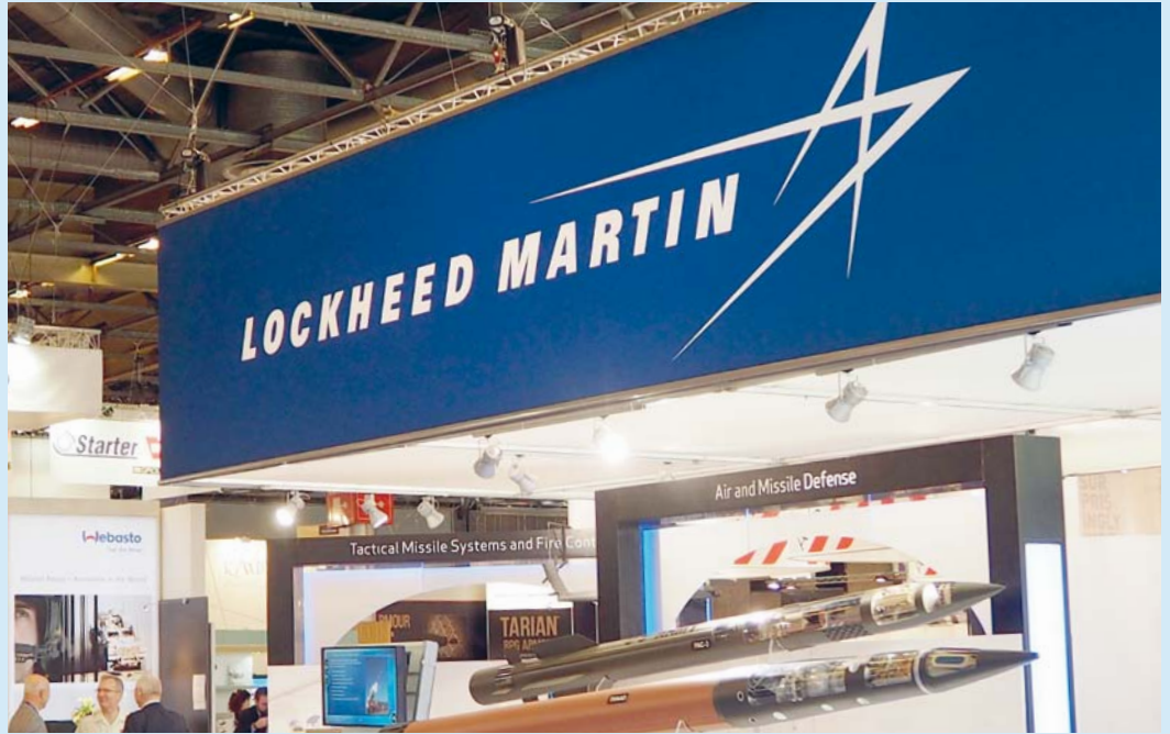
▲ Lockheed Martin booth at Eurosatory 2014