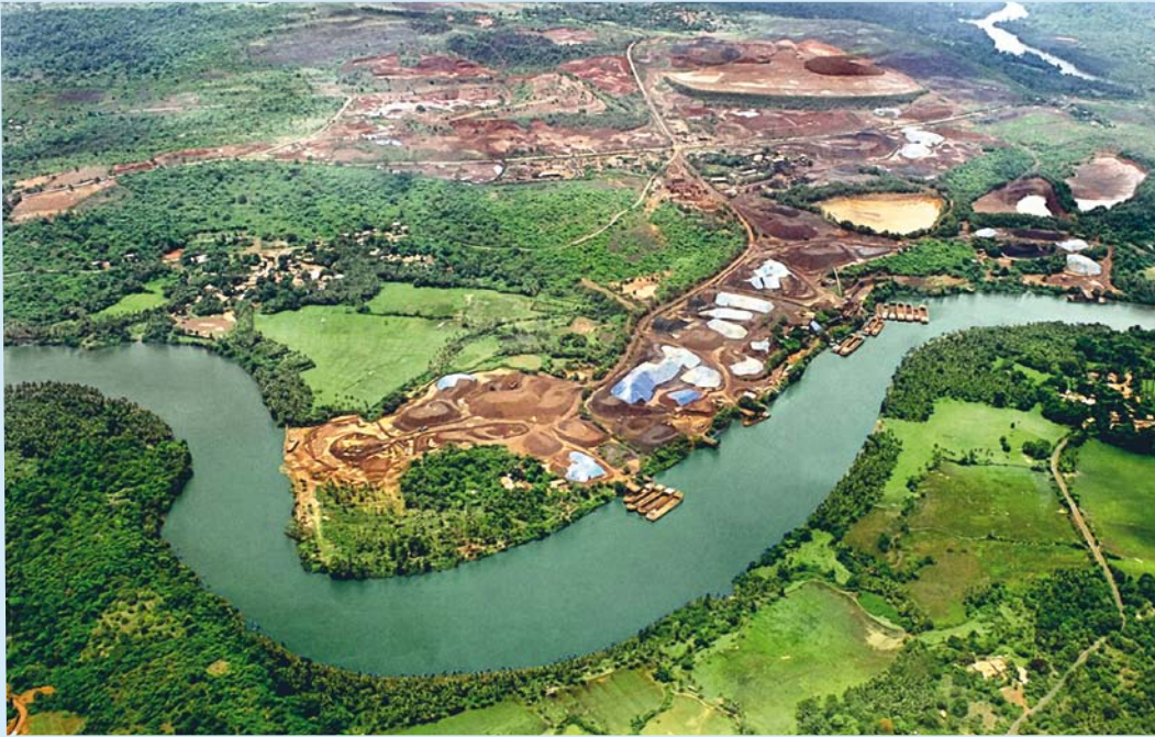
◀ An Aerial view of the Zuari river in Goa, India. It is an important transport channel for the mining industry that use barges to take iron ore for processing and shipment.

ate concealment of environmental information, pollution and corruption by top companies, including Sesa Goa. 11 Sesa Sterlite is currently seeking to regain these mining rights. 12 Sterlite Industries has also been engaged in illegal behavior, receiving a fine of the equivalent of €14 million from the Indian Supreme Court related to its copper smelter in Tamil Nadu, for severe environmental pollution. 13 No acknowledgement is given of improved environmental or human rights standards for the newly created company. In August 2014 police forces raided the offices of Sesa Sterlite in Karnataka (South West India) on grounds of suspicion over illegal iron ore exports from mines in Bellary, Karnataka. 14