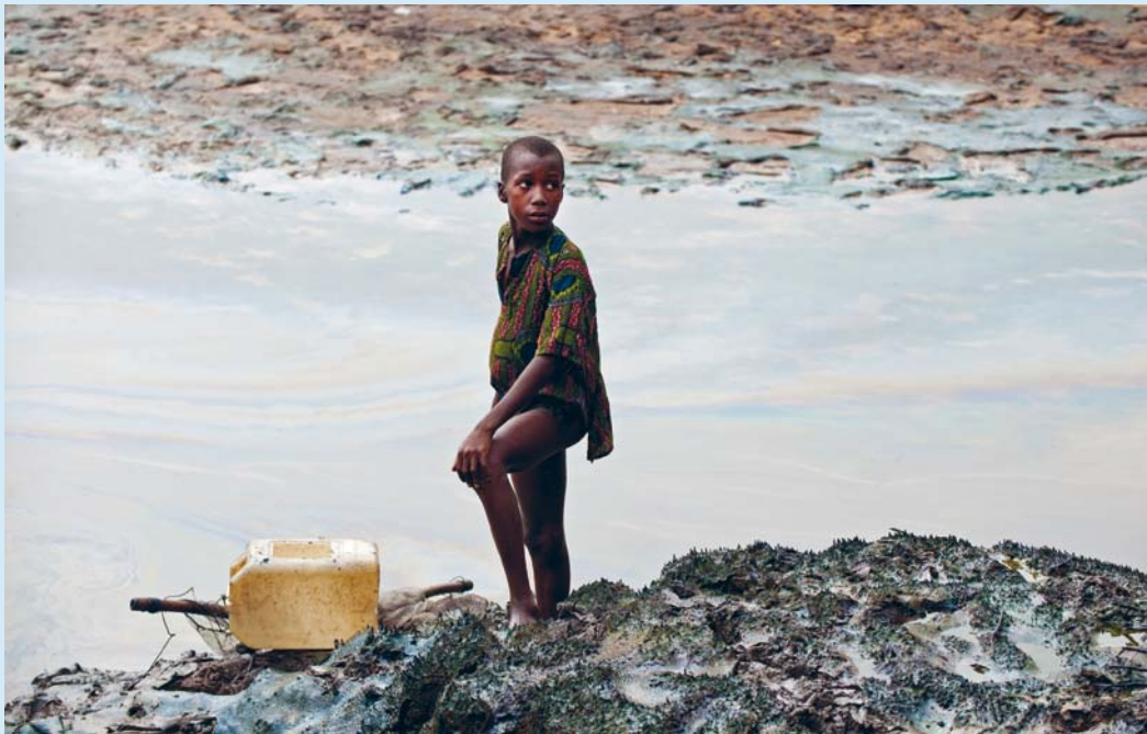
◀ Child standing in oil polluted river in Goi, Nigeria

are “demonstrating a lack of respect for the unique risks inherent in Alaskan operations”. 15