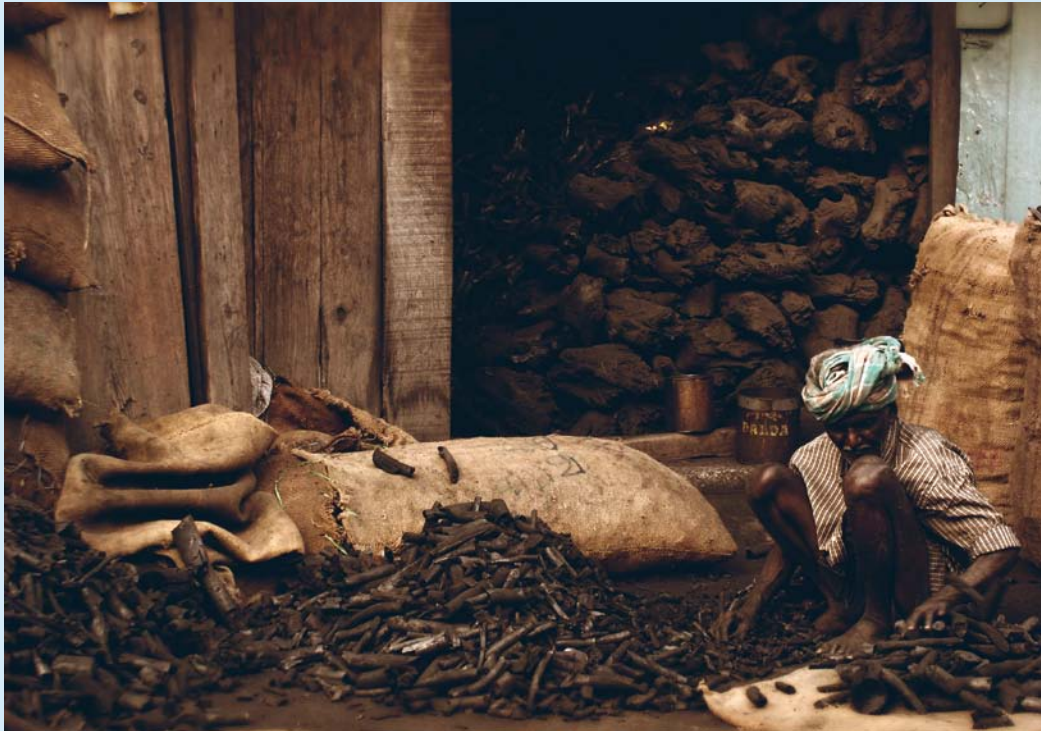
◀ Mysore Coal Man: A man sorting charcoal in Mysore India

Mahanandi Coalfields was fined approx. € 186 million for illegal coal extraction. 15