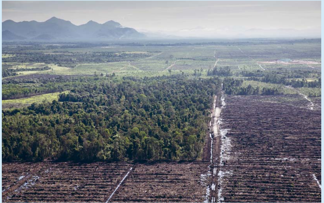
▲ Recently cleared peatland and new drainage canals on a concession owned by PT Ladang Samil MS, a subsidiary of Bumitama.