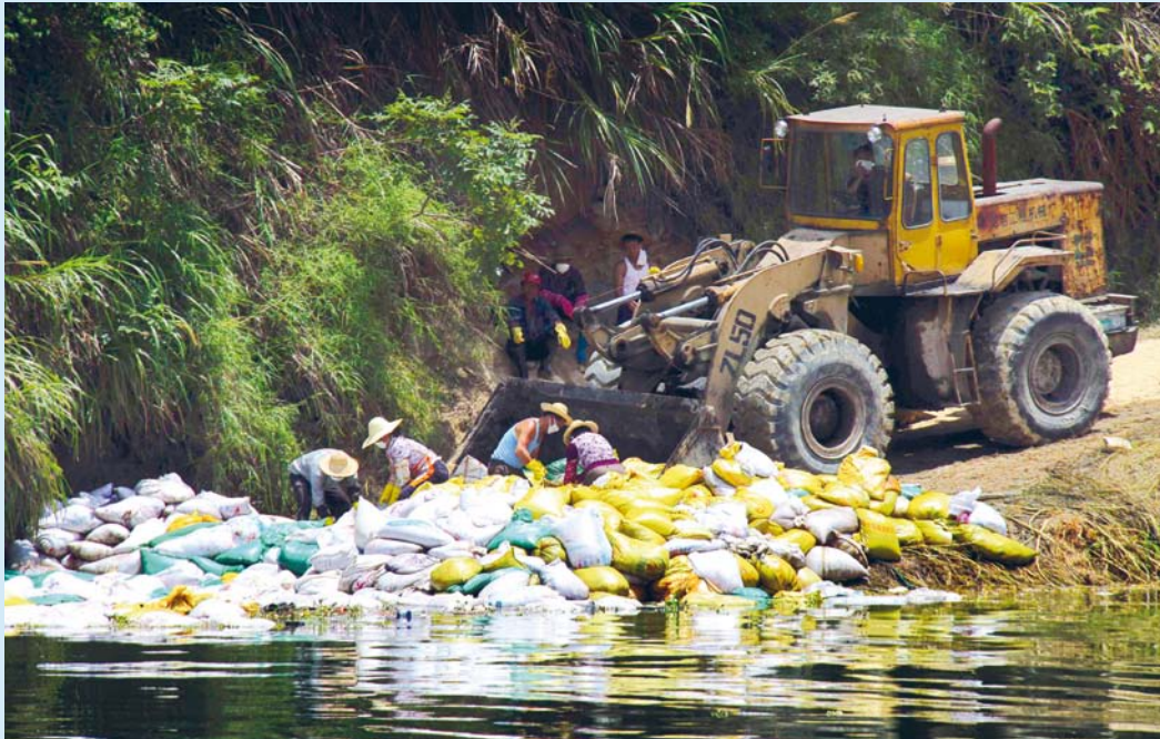
◀ Fishermen load bags of dead fish onto a forklift at the Mian Hua Tan reservoir in Yongding county, Fujian province, July 13, 2010. A sewage leak from a copper mine owned by Zijin Mining Group Co., whose shares were suspended from trading in Hong Kong on Monday, has polluted a river and reservoir in Fujian province, Xinhua news agency reported. Xinhua cited environmental authorities as saying the leak from a plant of the Zijinshan Copper Mine had killed or poisoned about 1.89 million kg of fish.

wildlife were severely impacted. 13 A related issue is the increase in incidences of cancer in villages closest to the mine area. The area has a tenfold higher cancer rate than the China average. 14