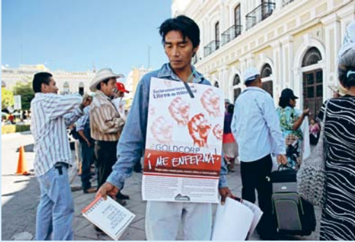
◀ "Goldcorp makes me sick". Protest against Goldcorp in Zacualpan, Mexico.

In 2008 Entre Mares, a subsidiary of Goldcorp, closed the San Martín mine in Honduras. It has since been facing criticism and law suits from the local people, who claim the open-pit mine caused the drying-up or pollution of water sources, health problems and deformations of new-born babies. Studies showed elevated levels of heavy metal in blood samples of tested patients. Local communities still demand the mitigation of environmental damage and compensation of affected people for health impacts and displacement. 18 An environmental activist, temporarily arrested in 2011, claims he still faces threats and intimidation. 19 In 2012, authorities opened criminal investigations against two managers of the companies. 20 In another lawsuit, a local court fined the company 35 million Lempira (€1.3 million). 21