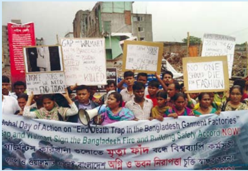
◀ 29 June 2013 protest in front of Rana plaza