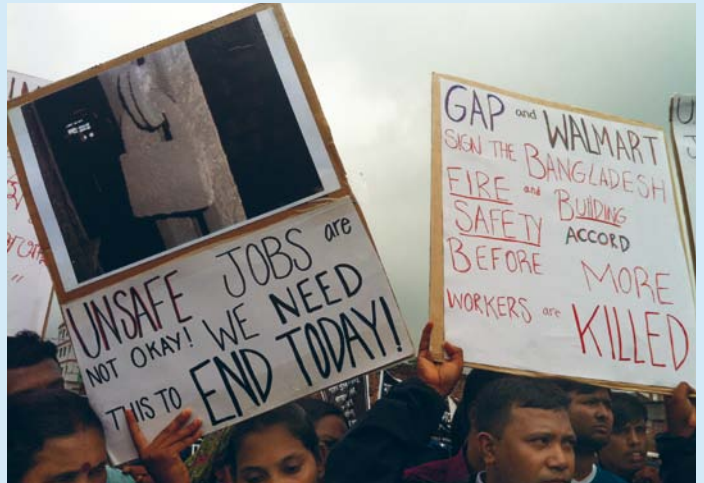
▲ Protest in Bangladesh against Gap and Walmart who did not sign the Bangladesh Safety Accord.