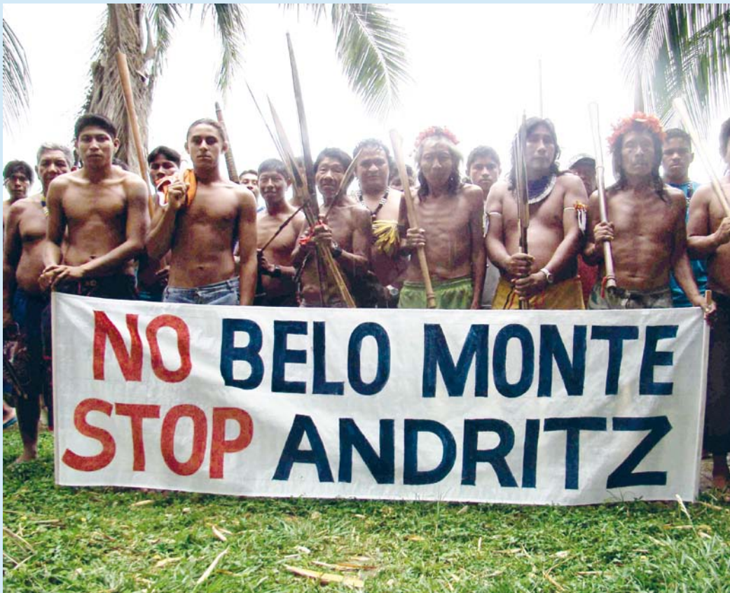
▲ Xingu indigenous people protest against Belo Monte and Andritz.

involvement in Xayaburi. 5 The dam project violates international standards and poses serious environmental and human rights risks affecting thousands of people in Laos, Thailand, Cambodia, and Vietnam. 6 According to International Rivers, “the dam will cause irreversible and permanent damage to the river’s habitat and ecosystem, which in turn will impact the local communities” and “will forcibly displace 2,100 people and negatively affect an additional 202,000 people who have had no say in decisions about the project”. 7