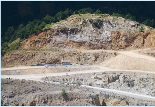
◀ Marlin Mine site, South-western highlands of Guatemala. The Marlin mine has attracted significant international attention, yet Goldcorp continues to operate. Organisations such as MiningWatch Canada, Oxfam America, Rights Action and the Halifax Initiative Coalition have all drawn attention to the Marlin Mine.