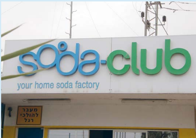
◀ SodaStream factory in Mishor Adumim, West Bank. Logo showing original name of 'Soda Club'.

the workers in the SodaStream factory suffered from harsh working conditions, low wages, and 'revolving door' employment policies. 15 In April 2008, SodaStream fired a group of 17 Palestinian workers, who protested their work conditions and low wages. 16 Following the publication of the story in the Swedish press and the intervention of Kav LaOved, they were rehired under better conditions, dismissed for the second time in 2010, and rehired again. 17 However, two leaders of this struggle lost their jobs permanently.