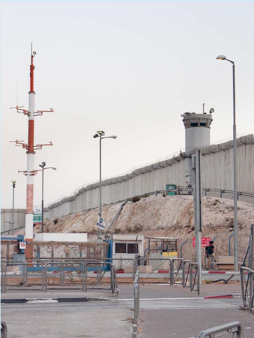
◀ Qalandiya checkpoint (East Jerusalem). © Norbert Kron

payloads. ‘Guardium’ was designed to perform routine missions, such as programmed patrols along border routes, but also to autonomously react to unscheduled events, and can have autonomous mission execution. 20 Elbit also offers SOLTAM SPEAR, a 120mm autonomous soft recoil mortar system for light-wheeled platforms. 21 The international NGO Campaign ‘Stop Killer Robots’ finds that lethal autonomous weapon systems would not be able to meet legal standards and would also undermine essential non-legal safeguards for civilians and therefore call for a ban of fully autonomous weapons. 22