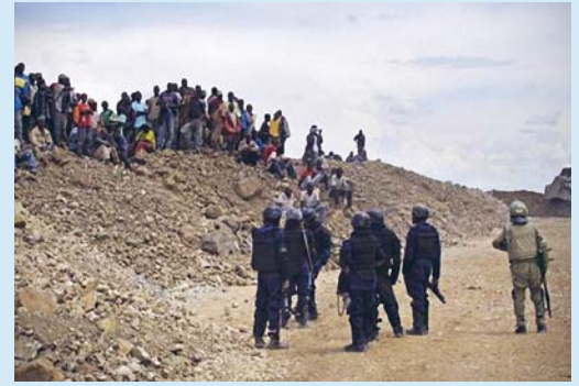
▲ A standoff between mine security guards (blue uniforms) a Tanzanian police officer (green uniform) and a group of villagers at the North Mara Mine on Friday 31 August 2013.