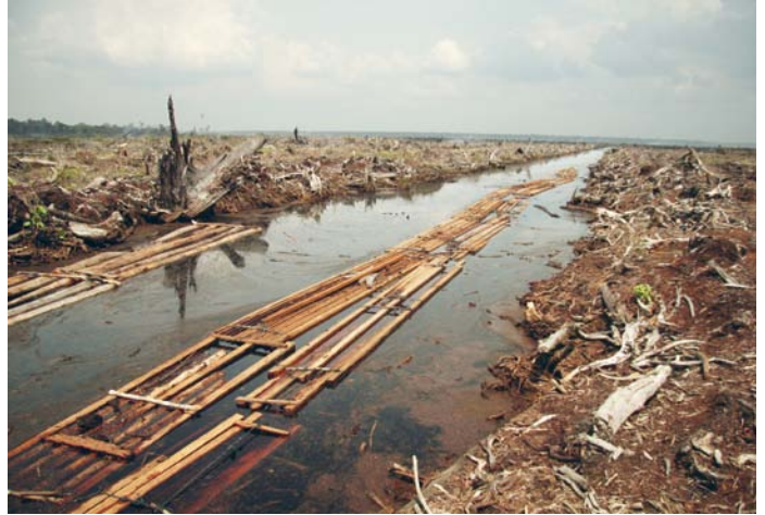
▲ Deforestation of peat swamp forest for oil palm plantation in Indragiri Hulu, Riau Province, Sumatra

Wilmar is involved in many problematic operations throughout Indonesia. Of the many cases of concern, a few of particular note include PT. Sawindo Cemerlang and its subsidiary PT. Sawit Tiara Nusa, which cleared primary forest belonging to indigenous communities in 24 villages in the West Popayato subdistrict of Gorontalo Province in the island of Sulawesi, up until spring 2014. 8 This is in violation of Wilmar's commitment not to clear High Carbon Stock forests. Wilmar affiliate PT. Sawindo Cemerlang took over land owned by PT. Delta Subur Permai in the Batui Banggai subdistrict, in the midst of active land conflict. Residents of nearby Honbola village opposed the company's permit application because they had previously filed an application for a Community Forest Permit at that location. Wilmar's actions prevented the community from engaging in forest restoration.