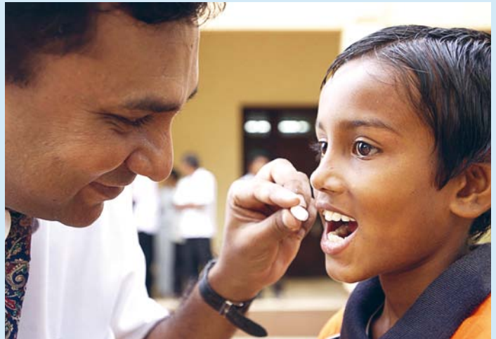
▲ Doctor administering tablets in Sri Lanka.