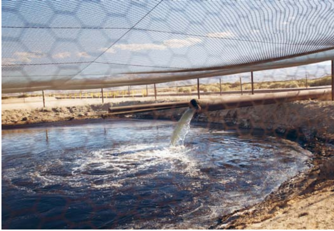
Fracking fluid and other drilling wastes are dumped into an unlined pit located right up against the Petroleum Highway.

recently been shown to have four times greater carbon impacts than originally estimated, as the expansion of the oil sands was not initially taken into account. 37 The Keystone XL pipeline will open the tar sands up to more refineries in the Gulf of Mexico and undoubtedly increase tar sands exports to Europe. In 2011 the European Union agreed to label oil from the tar sands as high carbon, but it has recently changed its plans. 38