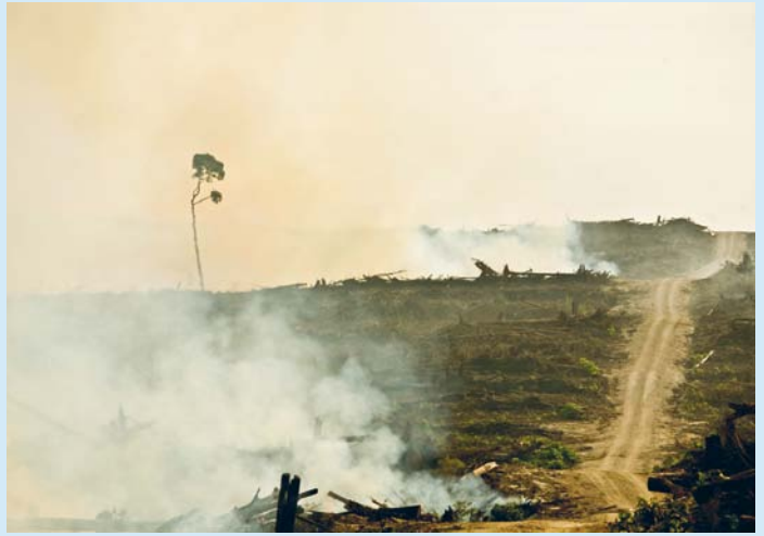
▲ The destruction of primary rainforest by Duta Palma. West Kalimantan, Borneo. Cargill was a key purchaser of palm oil from this notorious rainforest destroyer up until 2008.