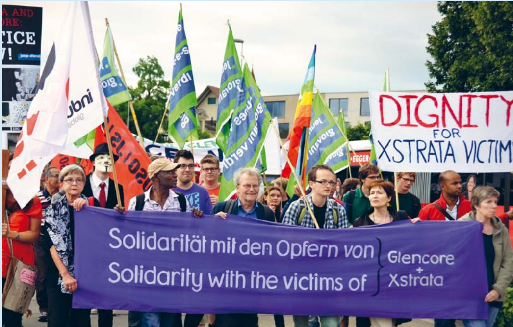
◀ Demonstration at Glencore and Xstrata Headquarters in Zug, July 11, 2012

evasion. 14 The purchase of Congolese mining companies such as Katanga Mining is also claimed to involve opaque systems of off-shore firms, secret loans and loss-making deals. 15