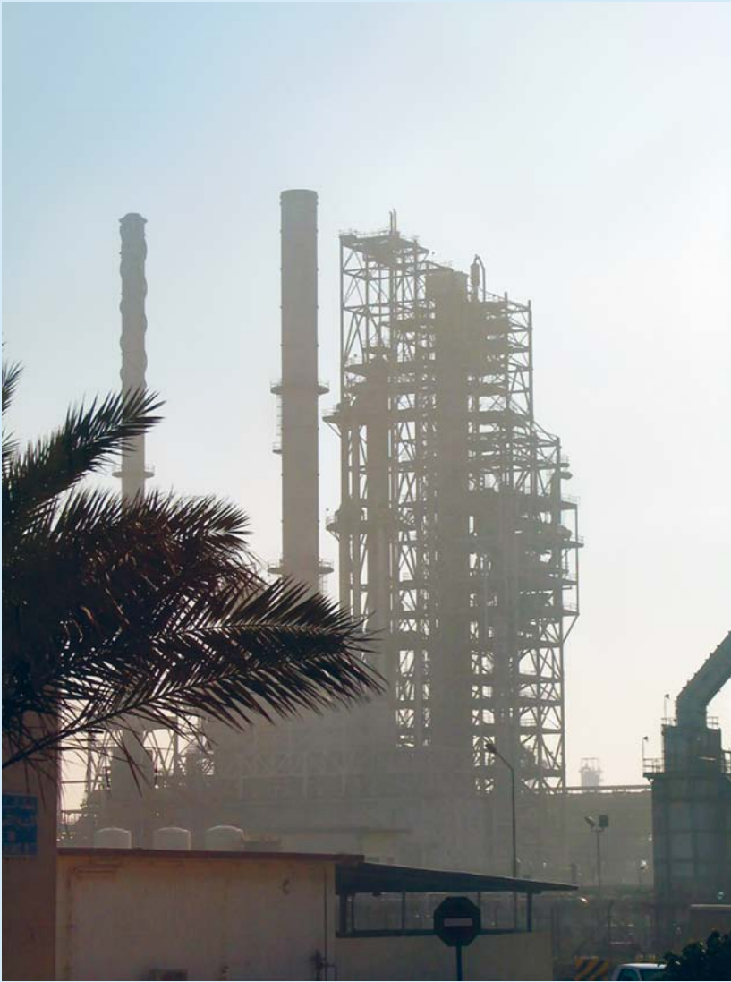
◀ Ras Tanura Refinery, Saudi Arabia: Ras Tanura Refinery is surrounded by a heavily guarded security fence.

refinery has very recently been expanded, costing over US$10 billion (€7.8 bill). Situated in the Gulf of Mexico, the refinery is perfectly positioned for the Keystone XL Pipeline, a controversial oil pipeline proposed to run from Alberta to Nebraska, linking the Canadian oil sands to refineries in the US 9 . This pipeline would give Motiva access to some of the dirtiest and most carbon intensive crude oil in the world, from the Canadian tar sands. Markets for oil sands would then be increasingly globally accessible, including to Europe. 10 11