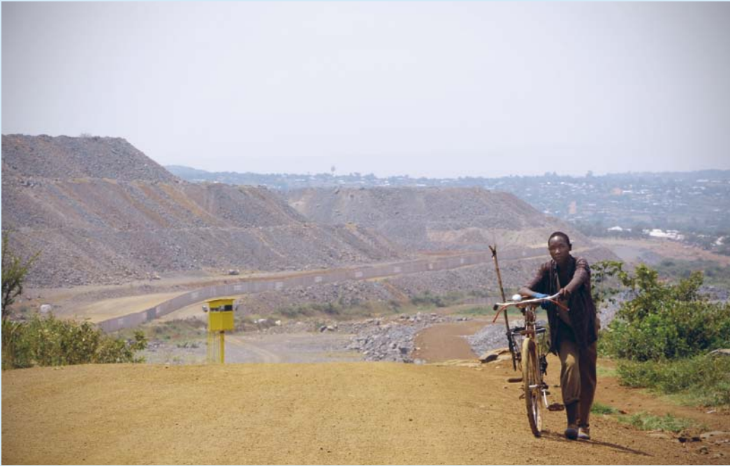
▲ North Mara Gold Mine is located beside Nyamongo village in the Mara Region, northwest Tanzania. The wall in the background has been built recently, now surrounding most of the mine. Guard towers are scattered around the mine.