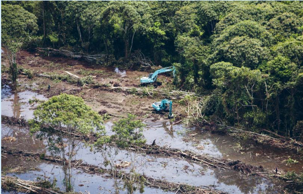
◀ Peatland forest clearance for palm oil. Concession owned by PT andalan Sukses Makmur, a subsidiary of Bumitama.

the Earth Europe (FoEE) successfully called on Deutsche Bank to divest from Bumitama, 6 and Germany's biggest bank announced that it had divested from Bumitama six months later. 7