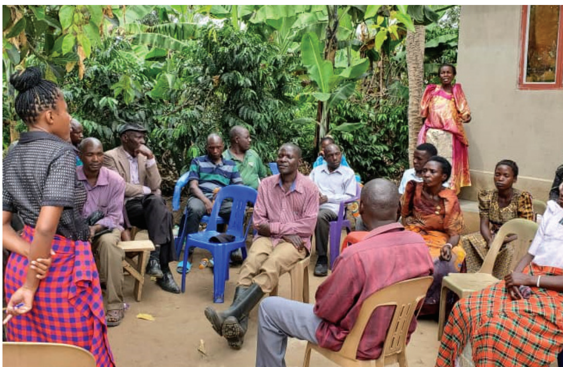
A community meeting with EACOP PAPs in Kyotera district before an FGD was conducted in June 2023

Access to other social services: This study found that the PAPs' access to social services such as health centres, safe water, markets, roads and employment is limited. The study found that 21% have access to or use public health services, 15% have access to clean water and markets and that none was employed in the oil sector.