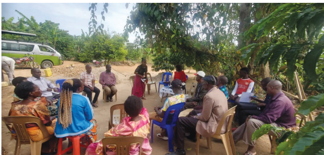
Some community members in Kyotera district that participated in IDIs

One respondent observed the following during an FGD in June 2023 in Hoima district, “Some people who got delayed compensation obtained loans from money lenders at a 100% interest rate. The money was difficult to pay and the money lenders are chasing them demanding for repayment. They cannot get any more loans from the bank because they are hard up; they even have no security to present to the bank.”