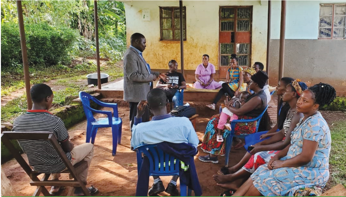
EACOP PAPs and others during an FGD in Hoima district