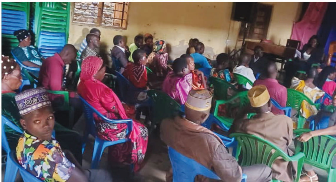
A community meeting before an FGD in Lwengo district in June 2023

This study assessed whether the commitments made by TotalEnergies to the EACOP PAHs as discussed above were complied with. However, further research should be conducted to assess whether the livelihood restoration commitments made in the EACOP RAP by TotalEnergies were adhered to as this study was conducted before the livelihood restoration programme for the EACOP project commenced.