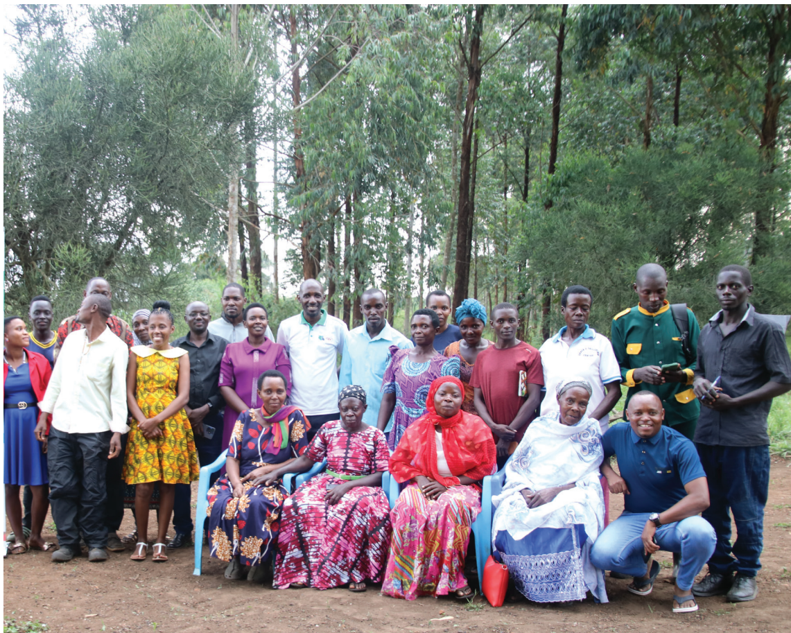
A community meeting with some EACOP PAPs in Kikuube district

This study was planned and conducted in accordance with ethical requirements and standards. Informed consent was acquired from the participants. The study also minimised harm by maintaining confidentiality when it came to the research participants.