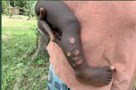
DISEASE AND ILLNESS