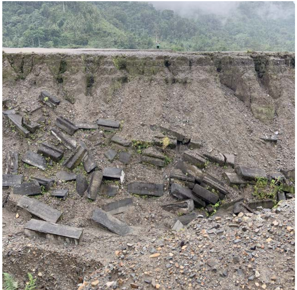
Collapsing levee, Middle Tailings.

Residents of Pangkiranaru village also expressed acute concerns over the instability of the levee which separates the Kawerong river from their village and a number of others. They reported that the levee was originally built to redirect the course of the Kawerong river. Following recent heavy rains, however, the ground next to the levee has collapsed and a large crater has opened up, indicating that the levee is being undermined by the river. At the point of the Human Rights Law Centre's visit to the village in September 2019, water could be seen trickling out the other side of the levee bank next to the village.