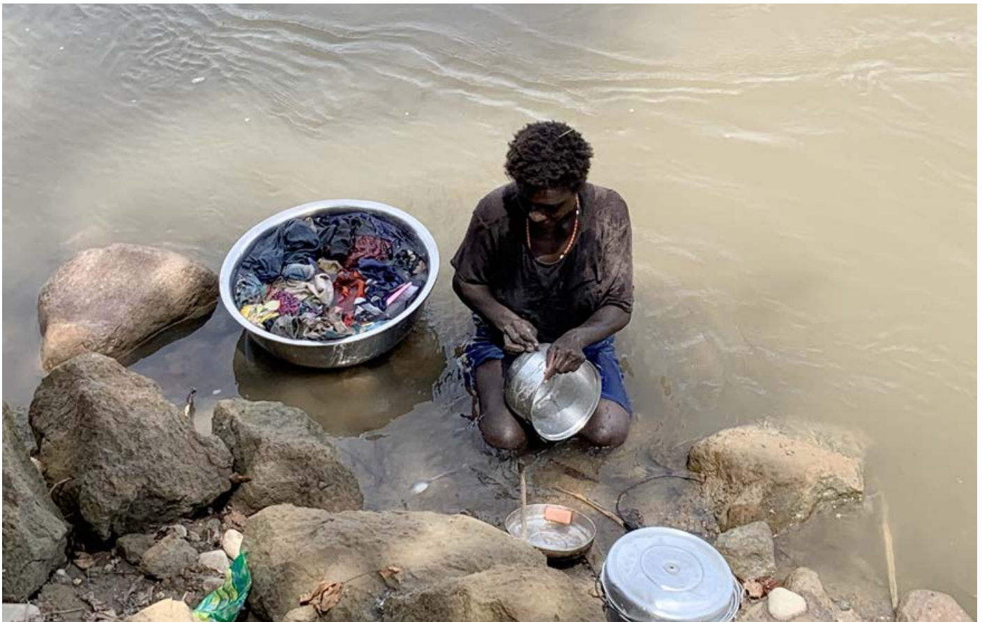
Washing dishes in Jaba river.

We usually pipe water from the mountains very far from the village, but there is still this problem especially during the windy season, there are signs of dust being blown into the water source. Usually we make small dams right at the water course so it’s not enclosed at the source...so we think it gets contamination. We use the Jaba river for washing ourselves and our clothes. When the spring water dries up, especially in the dry season, we use the Jaba river for doing our dishes as well. 73