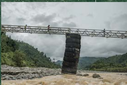
TREACHEROUS RIVER CROSSINGS