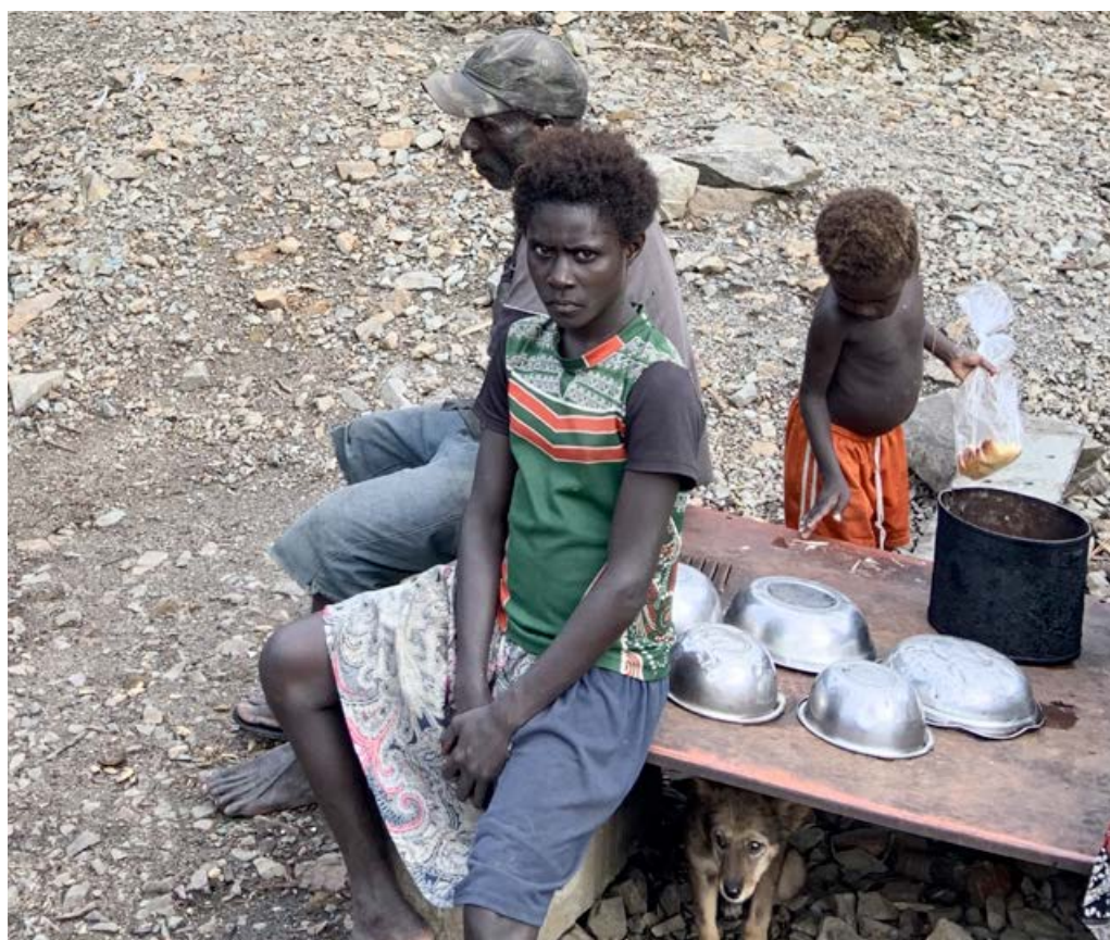
Families living in the mine pit.