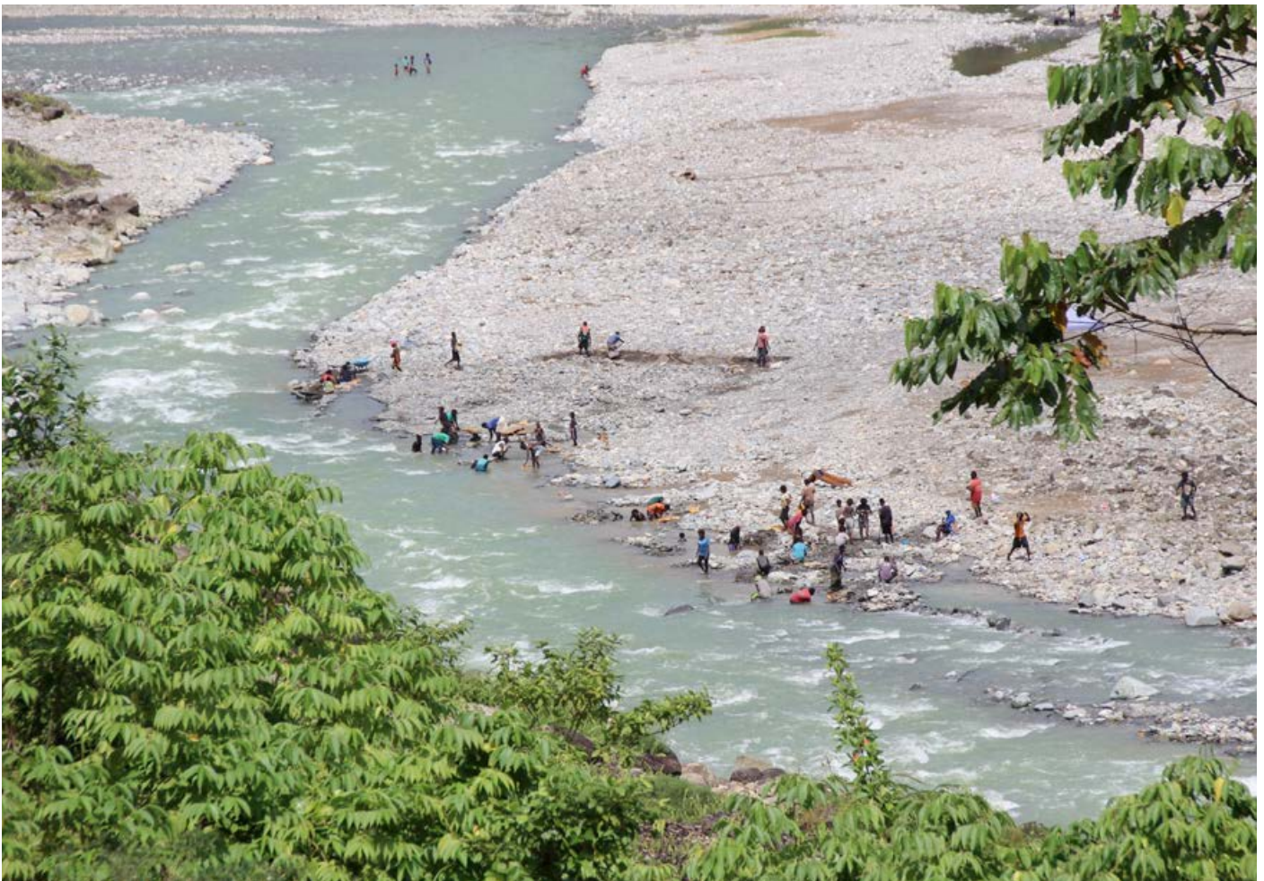
Communities panning for gold in the Kawerong river.

Contamination into the rivers from the Panguna mine itself now appears to also be being compounded by stirred-up sediment from small-scale gold panning occurring both downstream and upstream of the mine. A number of residents interviewed noted the recent appearance of new brown sedimentation into the rivers which they described as resulting from this activity.