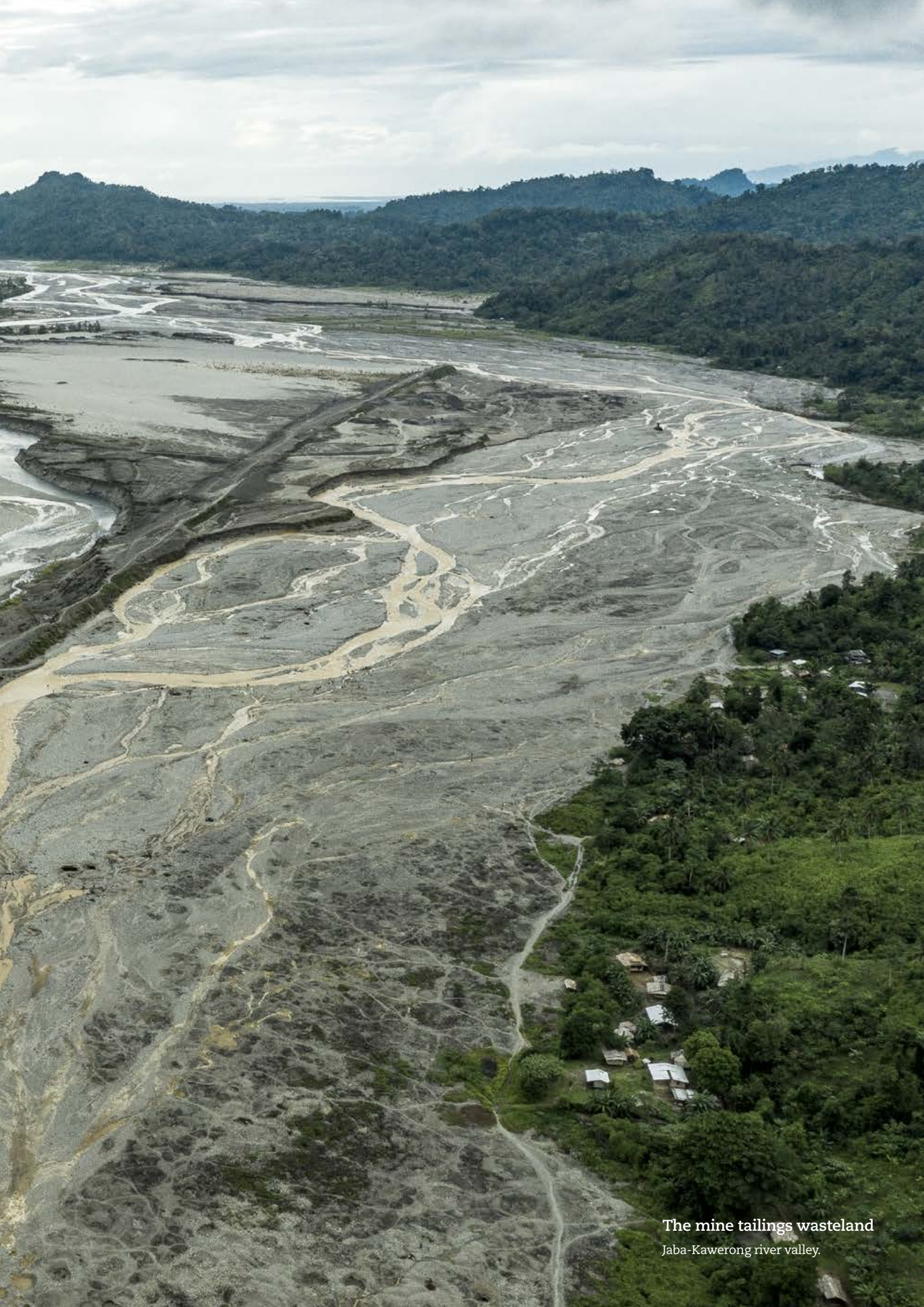
The mine tailings wasteland Jaba-Kawerong river valley.