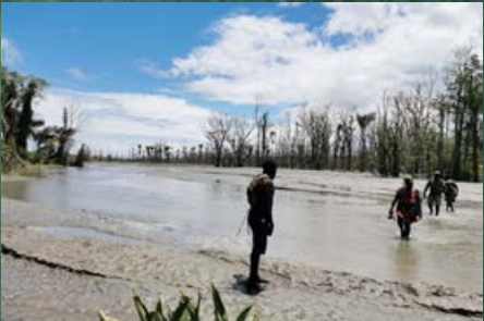
FLOODING AND LAND DESTRUCTION