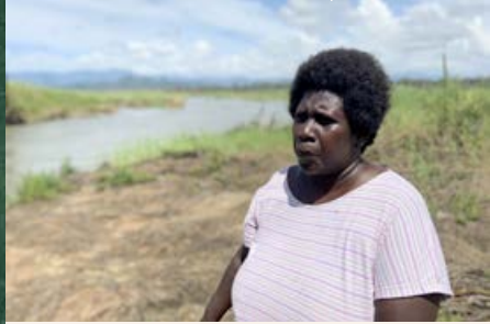
LOSS OF SACRED SITES