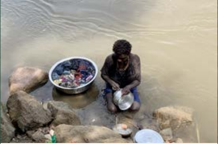
LACK OF ACCESS TO CLEAN WATER