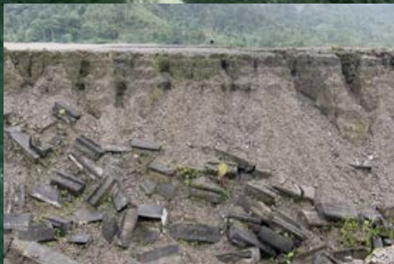
LANDSLIDES AND COLLAPSING LEVEES