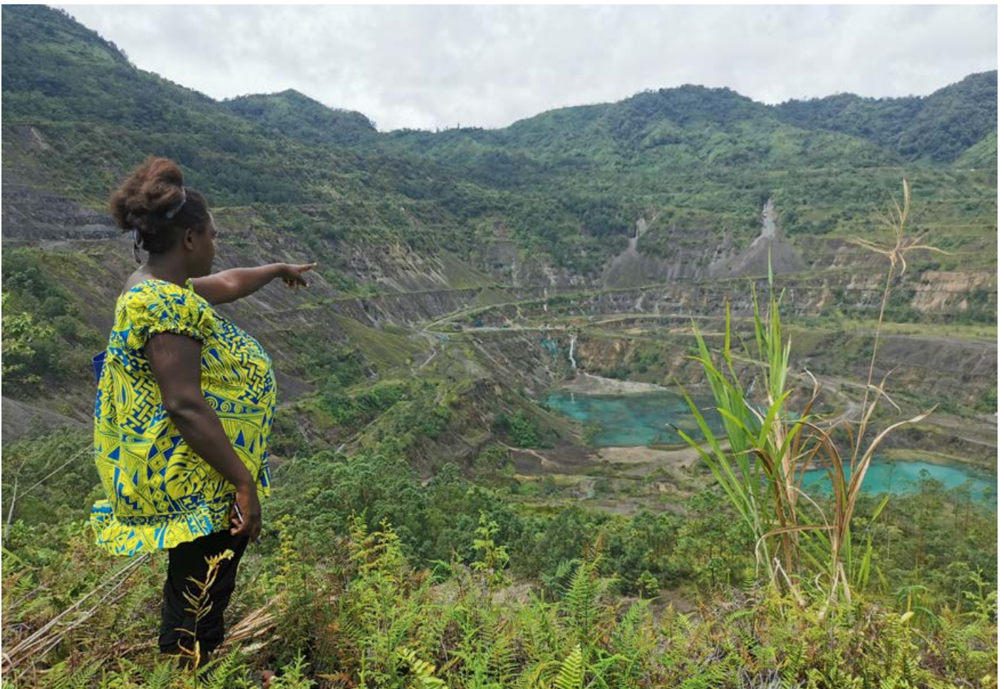
The mine pit.

Rio Tinto holds itself out as a global corporate leader on human rights and the environment and claims to pay particular attention to communities' rights to land, water and cultural heritage. Unless it addresses its legacy at Panguna, however, and contributes to remedying the massive problems it has created, the company will remain in serious violation of its human rights and environmental obligations.