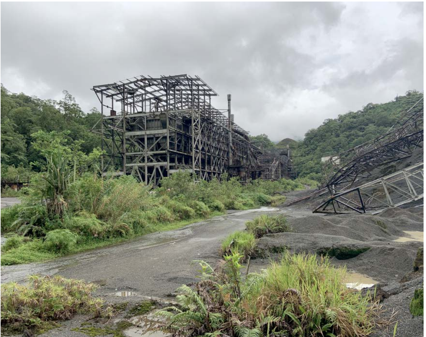
Rusting mine buildings.

In the meantime, people in the mine-affected communities continue to live with Panguna’s devastating legacy.