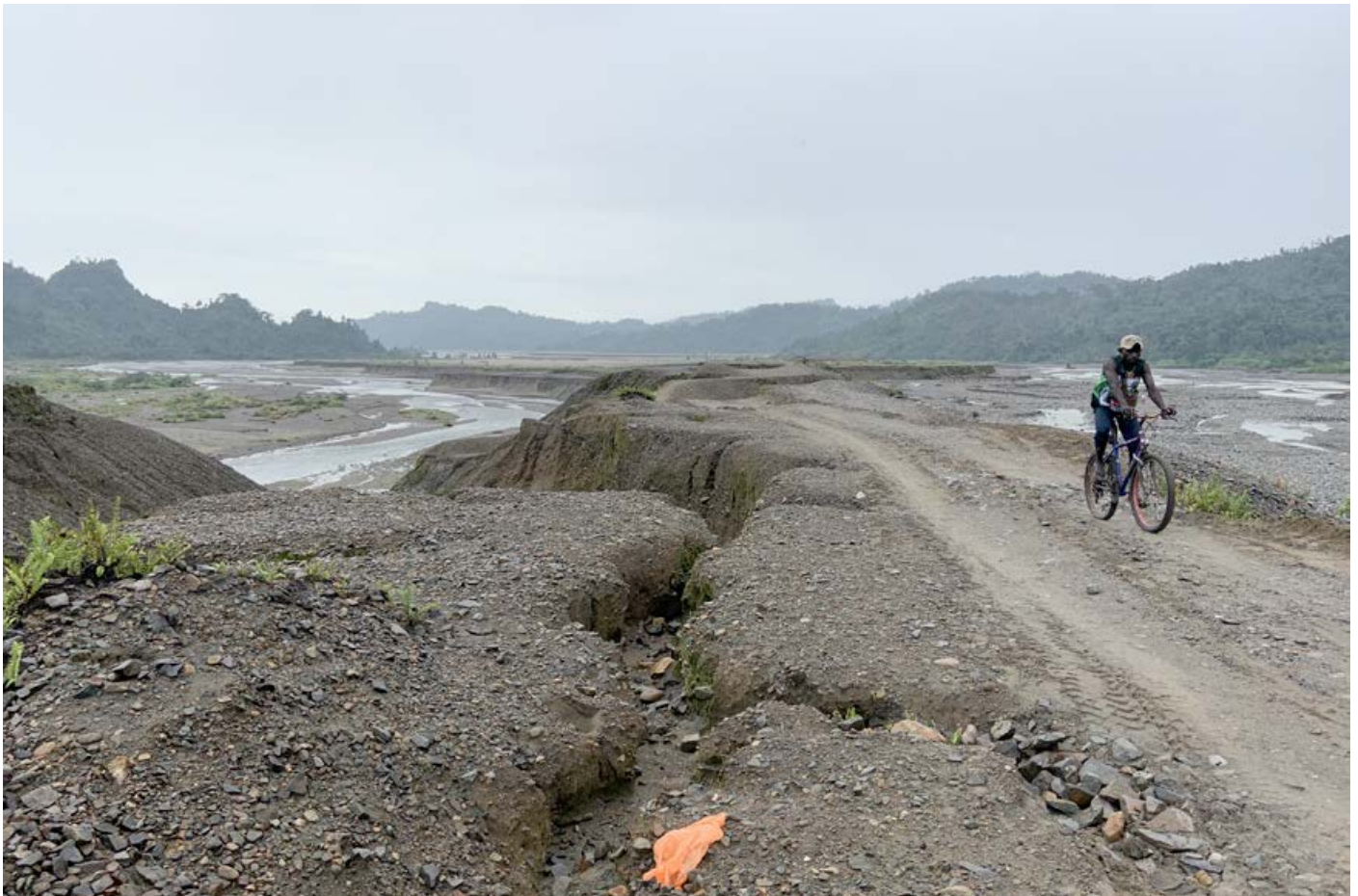
Crossing the mine tailings wasteland.

The impact of the mine has been extreme by any measure and most of the adverse impacts are long lasting; in some cases permanent.... Overall, the nature and scale of the effects of the tailings disposal are well beyond what the people of the Kawerong and Jaba valleys could have imagined prior to the start of operations and are certainly beyond what BCL predicted and the Administration accepted at the commencement of mining.... While the National Government particularly, and the Company, have enjoyed the benefits, the costs have not been borne by them but by the Nasioi people. 30