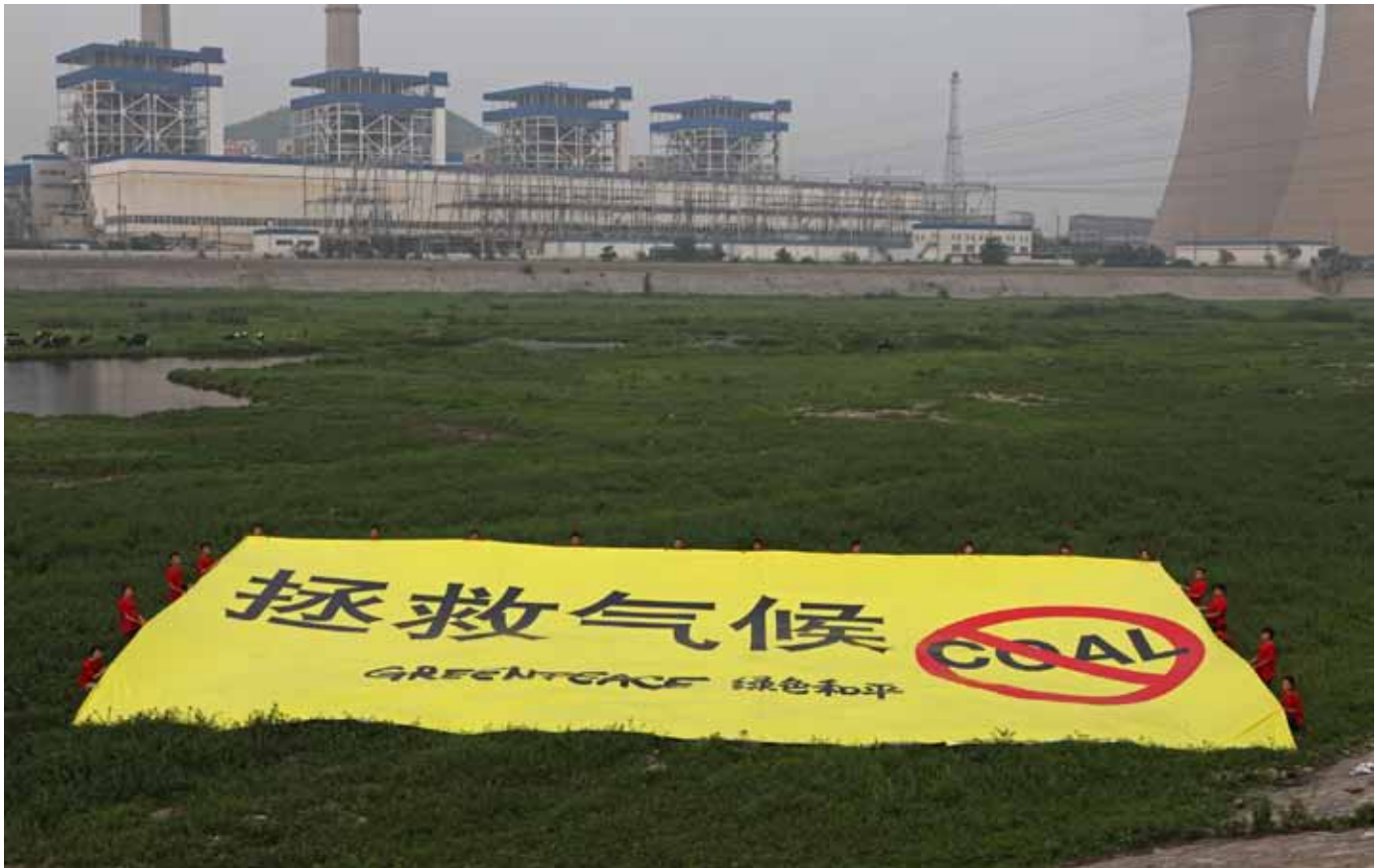
GREENPEACE VOLUNTEERS DISPLAY A BANNER AT A COAL FIRED POWER PLANT IN WESTERN BEIJING , CHINA.

Meanwhile, the national air pollution action plan released in September offered the most comprehensive strategy yet to resolve China's most outstanding environmental problem. Coal is front and center in this plan, which includes an ambitious timeline for reducing soot (PM2.5) in key cities, a strong mandate of rapid peak and decline of coal consumption, and a ban on new coal-fired power plants in key regions. In addition to the pushes from the central government, many provinces that suffer most from air pollution either already have, or are expected to have plans to reduce their coal consumption.