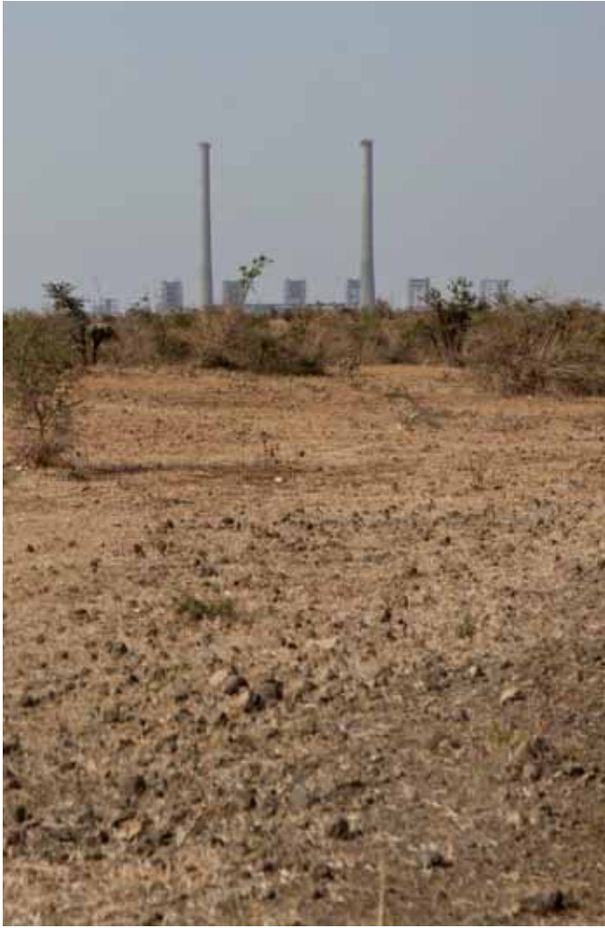
A COAL-FIRED THERMAL POWER PLANT BUILT BY INDIABULLS POWER LTD.

programs across Maharashtra to other uses. Fifty-four percent went to industrial projects, of which 61 percent were coal-fired thermal power plants.