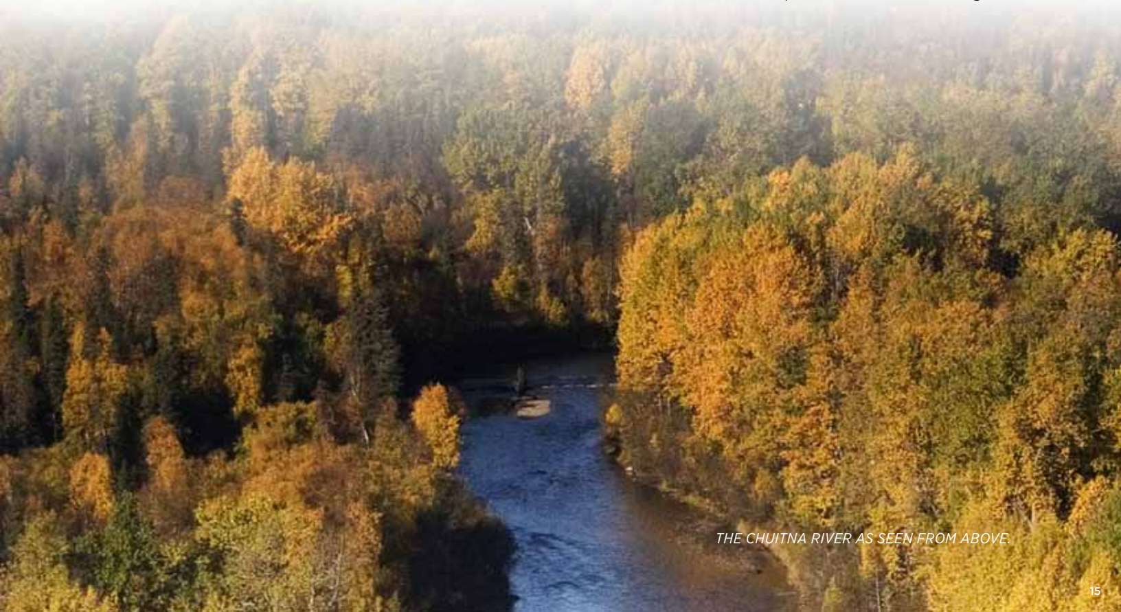
THE CHUITNA RIVER AS SEEN FROM ABOVE.