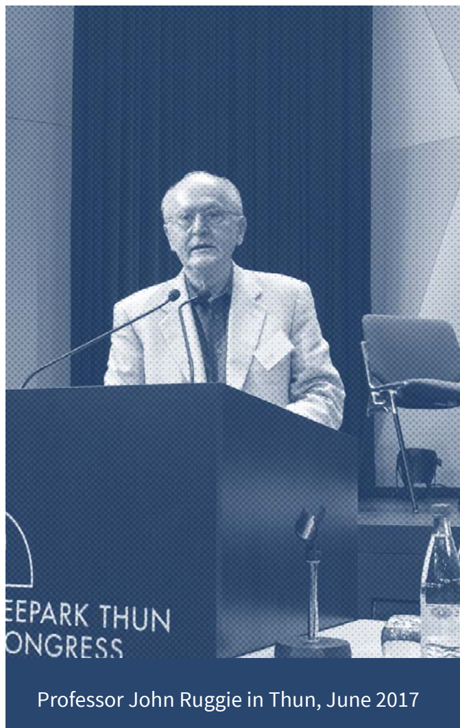
Professor John Ruggie in Thun, June 2017

Since the endorsement of the UN Guiding Principles on Business and Human Rights (UNGPs) by the UN Human Rights Council in 2011, BankTrack has campaigned for the full implementation of these Principles by the banking sector. A discussion paper by the Thun Group of banks, published in January 2017, set the tone for much of the year by setting out a problematic interpretation of banks' responsibilities under these principles that needed a strong challenge. 2017 also saw BankTrack publish a third Human Rights Impact Briefing on 'Banks and Dirty Diesel', and continue our work to monitor Dutch and OECD initiatives on banks and human rights.