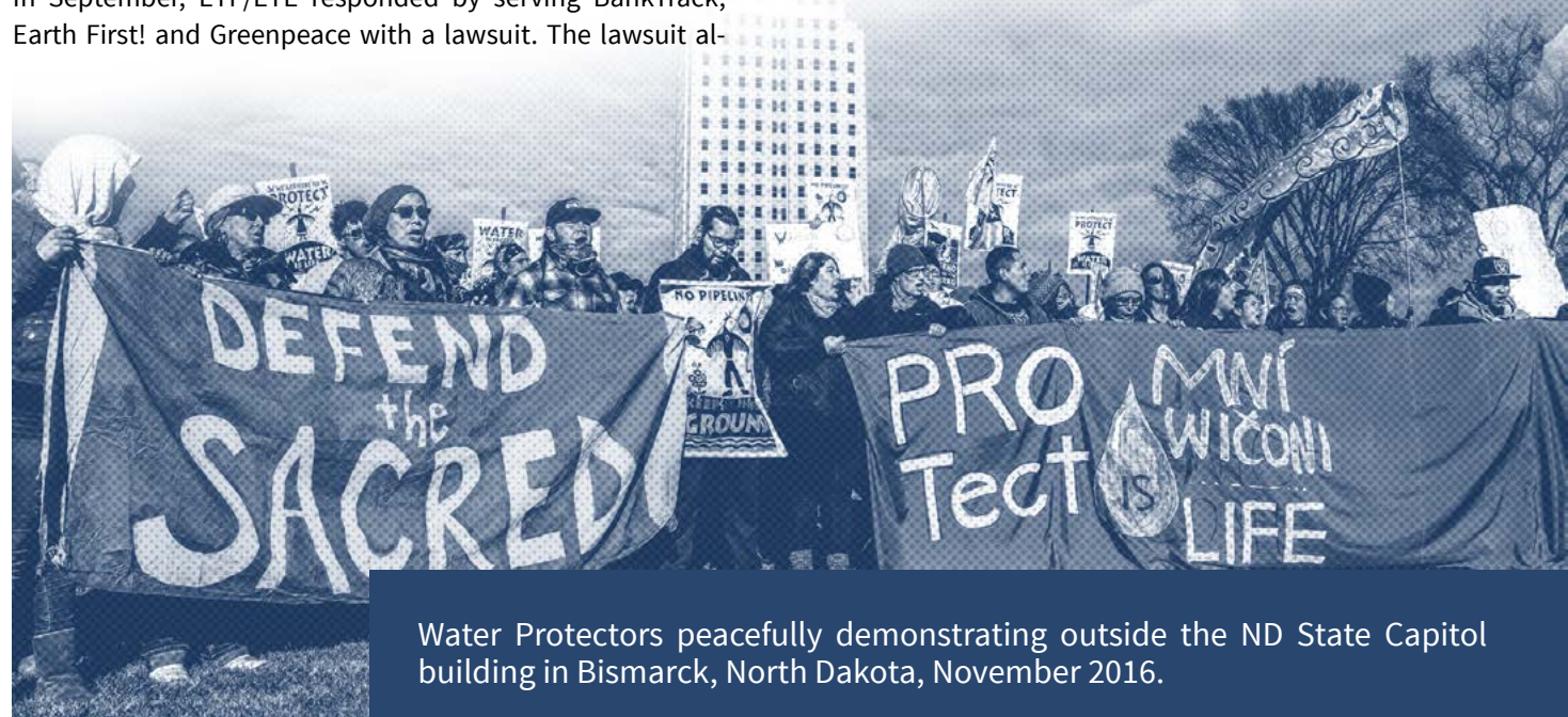
Water Protectors peacefully demonstrating outside the ND State Capitol building in Bismarck, North Dakota, November 2016.

BankTrack and Friends of the Earth France warmly welcomed new commitments in October from BNP Paribas to help accelerate the energy transition by drastically reducing its financing of so called ‘unconventional’ fossil fuels: tar sands, shale gas, oil and gas exploration projects in the Arctic region, as well as all related infrastructure for transport and export. We have called on other banks to follow BNP Paribas’ lead and take steps to reduce their financing of unconventional fossil fuels – set to be a major battlefield with the banks in 2018