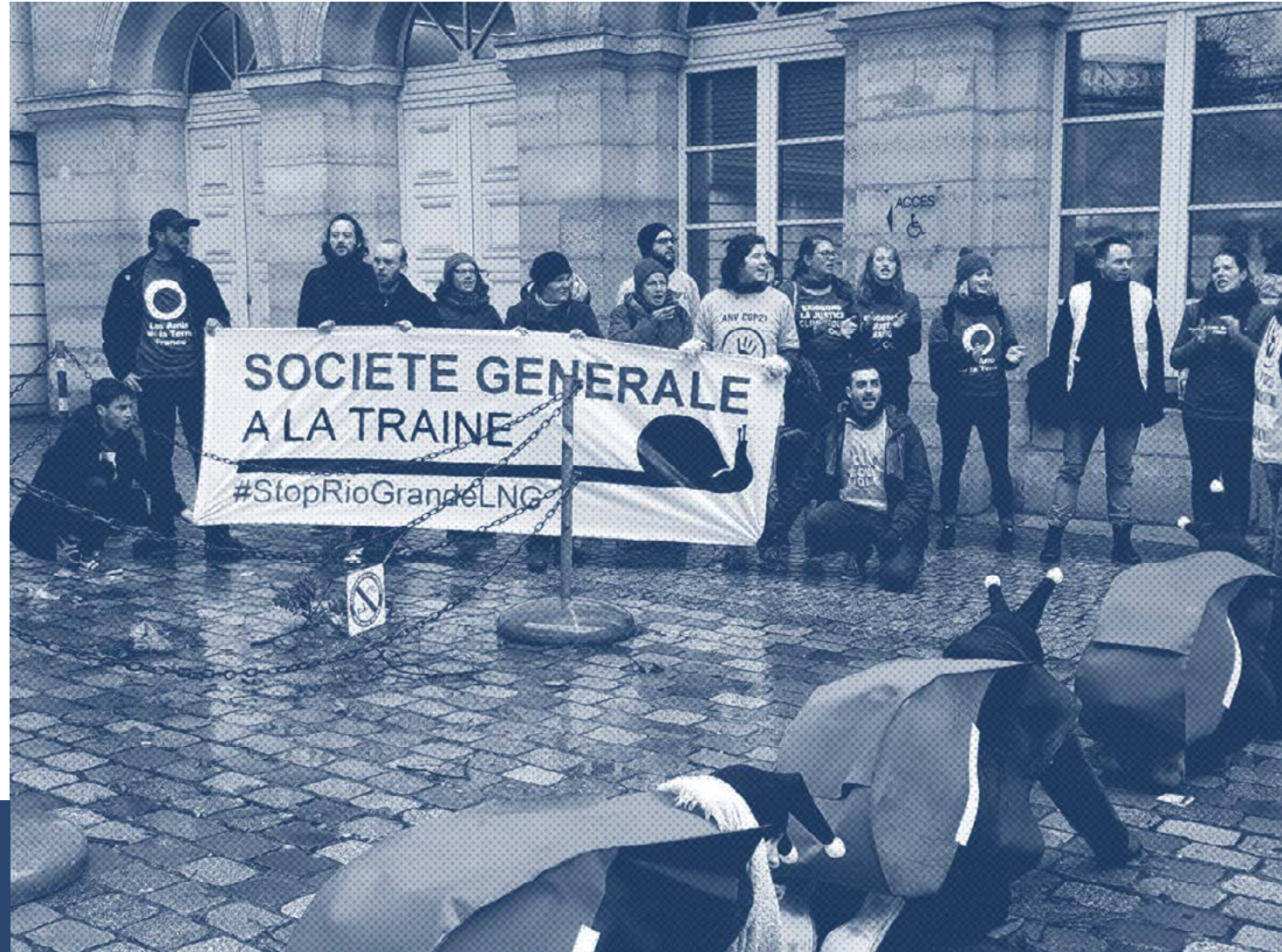
Protesters dressed as snails protest outside the French Finance Ministry on climate finance day in Paris, December 2017.

Vitol, Switzerland & Trafigura, Singapore Vitol and Trafigura are the two companies whose involvement in the “dirty diesel” scandal of high-sulphur fuel dumping in African countries is the topic of BankTrack’s ‘Banks and Dirty Diesel’ briefing. View profiles: Vitol , Trafigura .