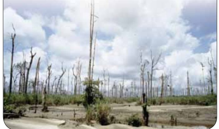
The Ok Tedi River in 1998. Each year 100 million tonnes of waste from the Ok Tedi mine are released into the Ok Tedi River.

One can only hope shareholders would never support the company returning to PNG after the damage it has caused to the rivers, the environment and the people