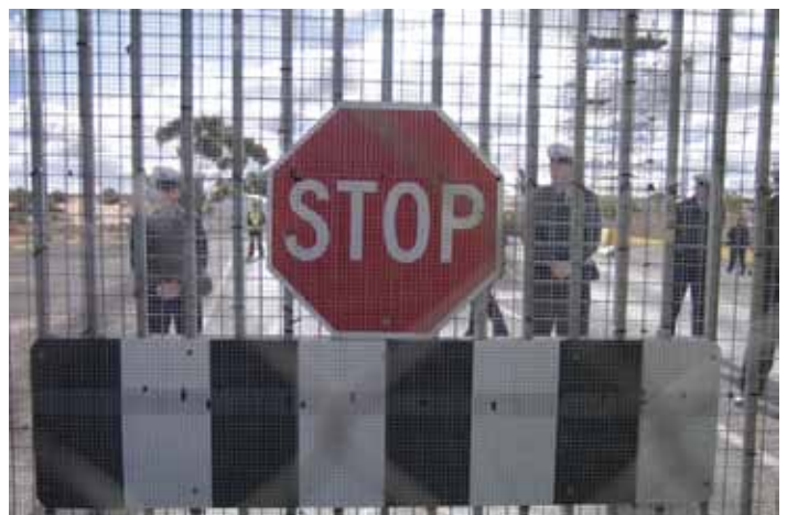
Police securing the gates of Olympic Dam mine South Australia, July 2012.

The risks would escalate if plans for a massive expansion of the mine are revived. The BHP whistleblower said. “Assertions of safety of workers made by BHP are not credible because they rely on assumptions rather than, for example, blood sampling and, crucially, an assumption that all workers wear a respirator when exposed to highly radioactive polonium dust in the smelter.”