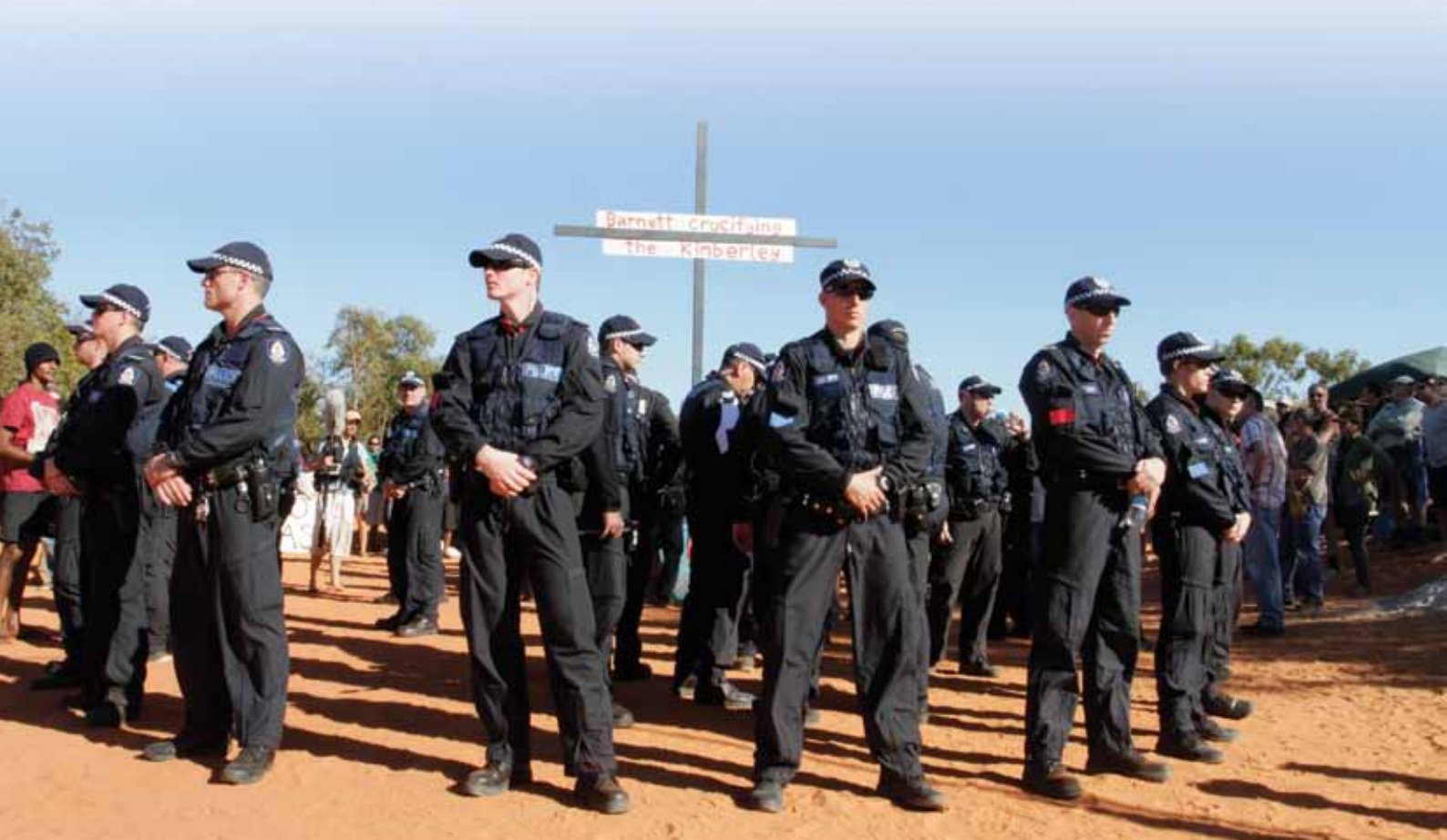
WA Police defend Woodside machinery from protesters.

Go to our website – www.wilderness.org.au/kimberley - and have a read. There are actions you can undertake that are identified on the website. And feel free to give us a call or email. The details are on our website. We are keen to work with the people of Australia to help the people of Broome and to ensure this global treasure maintains its environmental and cultural values.