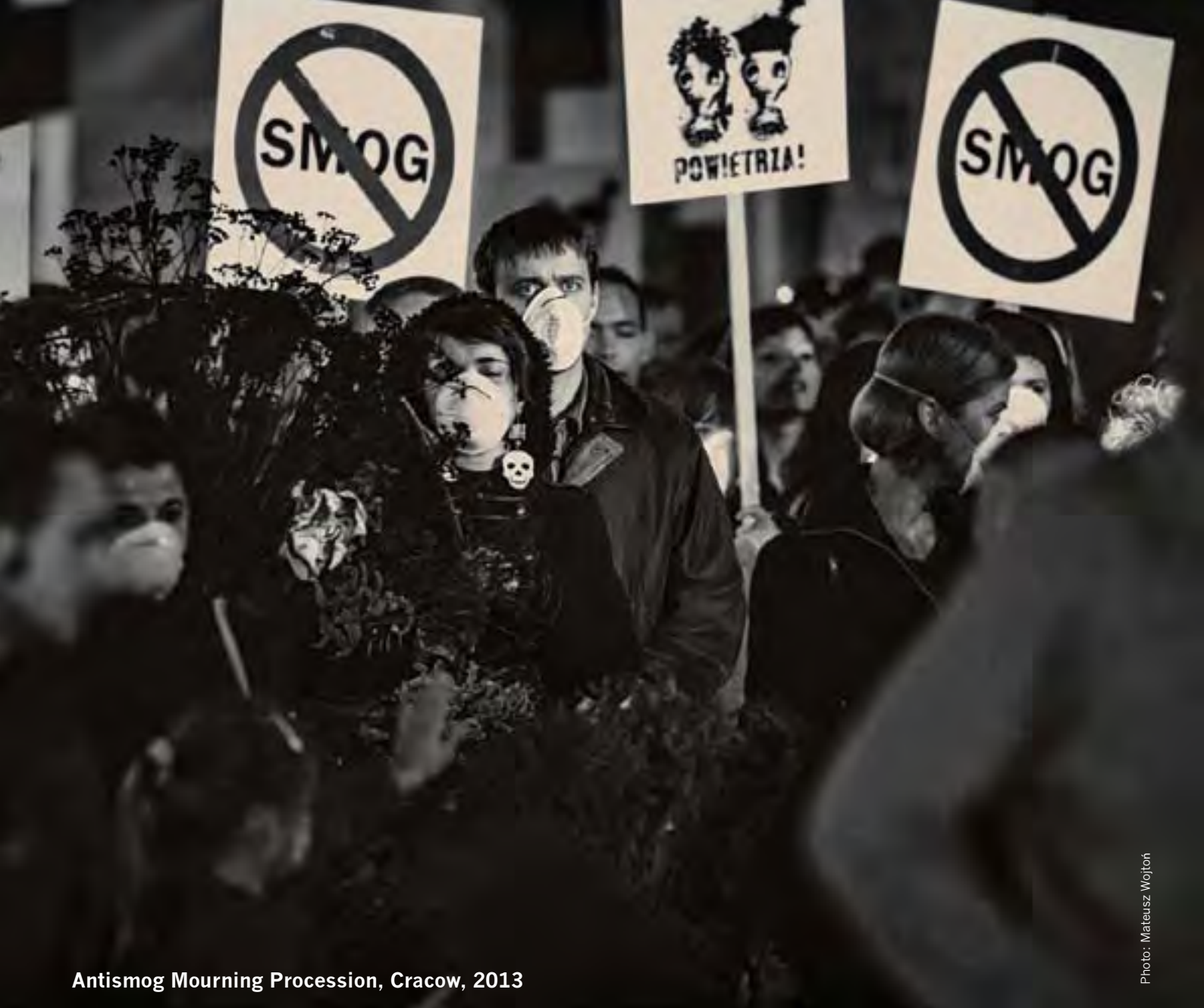
Antismog Mourning Procession, Cracow, 2013