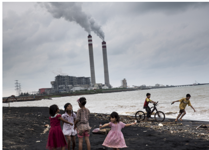
Children playing on the beach near the Tanjung Jati B in central Java. Kemal Jufri, Greenpeace, 2015.

While all coal-fired power plants cause death and disease through their emissions, the problem is particularly acute in south-east Asia because of lax emission standards: all south-east Asian countries allow new coal-fired power plants to emit 5-10 times more major air pollutants than China, the U.S., and the EU.