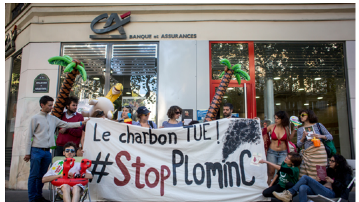
Young Friends of the Earth France protesting Crédit Agricole's support for a Croatian coal plant

Staggeringly, despite having signed the Paris Pledge for Action and committed to play its part in realising the goal of limiting the global temperature rise to less than 2°C, Crédit Agricole is currently considering the financing of the expansion of the Tanjung Jati B coal-fired power plant in Indonesia. Rather than implicating itself in such dubious coal projects, Crédit Agricole should now be focusing primarily on tightening its policy coverage in order to finally consign its coal financing to history.