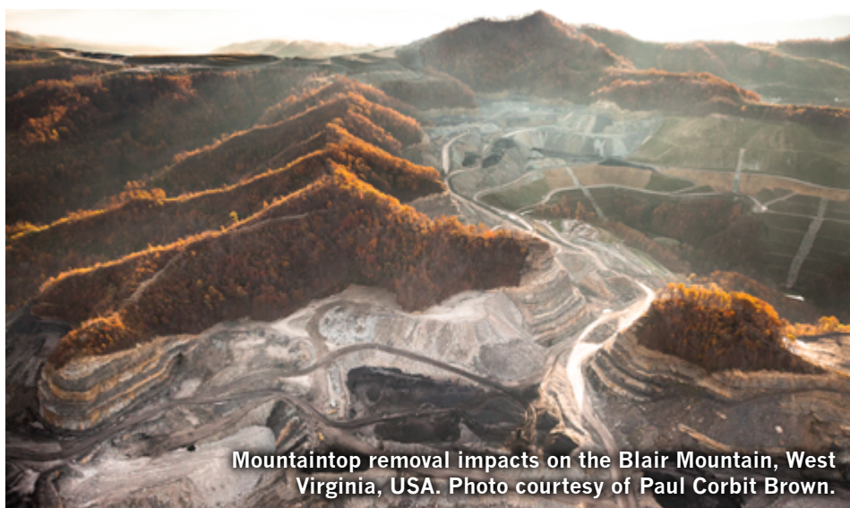
Mountaintop removal impacts on the Blair Mountain, West Virginia, USA.

billion to the most climate-damaging fossil fuel sector.