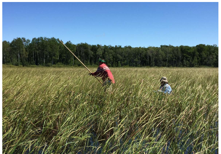
Wild Rice Harvest, Flowage Lake, August 2015

Enbridge's Line 3 has already faced 2 years of fierce resistance in the Great Lakes, led by Ojibwe tribes and grassroots groups like Honor the Earth, MN350, and Friends of the Headwaters. For 4 years, we fought the proposed Sandpiper pipeline, which would have established the new Line 3 corridor. Eventually, Minnesota combined the Sandpiper and Line 3 applications into one regulatory process, and a successful 2015 Friends of the Headwaters lawsuit forced them to conduct a full, cumulative Environmental Impact Statement (EIS) on both lines. In August 2016, we defeated the Sandpiper, but the battle against Line 3 remains. Minnesota is currently writing its EIS for Line 3, after months of battle over what the study would include and who would perform the analyses. The draft EIS is scheduled for April 2017 and the public will have a chance to comment at a series of public hearings. A final permit decision is expected in Spring 2018.