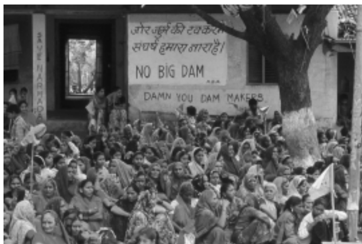
Peoples resistance was able to stop the Maheshwar dam in the Narmada valley.

Private banks and the World Bank’s Multilateral Investment Guarantee Agency recently turned down applications from NHPC to finance the Omkareshwar hydropower project. Environmental and social concerns as well as reputational risks motivated these decisions. The Sardar Sarovar