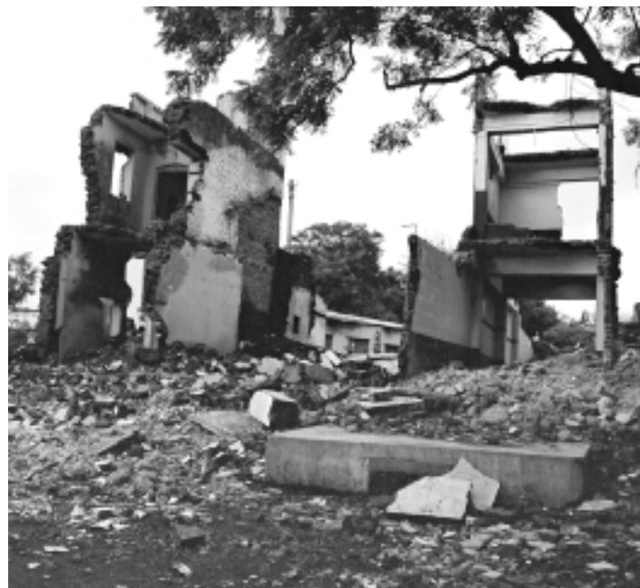
Villagers were forced to destroy their own houses in the Indira Sagar submergence area.

In the last 29 years, NHPC has executed no more than eight projects in India on its own, with a combined capacity of 2,475 MW. Compared with this modest existing portfolio, NHPC’s expansion plans are highly ambitious. NHPC aims to expand its total installed capacity by 4 622 MW during the Tenth Plan period (2002-2007). Between 2008 and 2017, NHPC hopes to add no less than 27,908 MW. NHPC is currently looking to foreign banks to help finance this expansion.