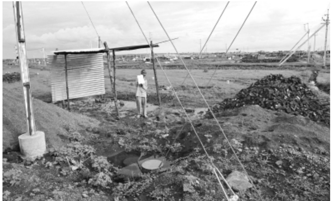
Primitive resettlement camp. NHPC’s projects, particularly in the country’s Northeast and the Narmada valley, affect large numbers of indigenous and lower caste people.

pipeline”. The power ministry decided to cancel the project since today’s costs of the project are five times higher than initial cost estimates. Also, the per-unit cost of electricity generated would have been several times higher than average unit costs. Prior to the decision to shelve the project, the construction of Koel Karo dam had been stalled for two years.