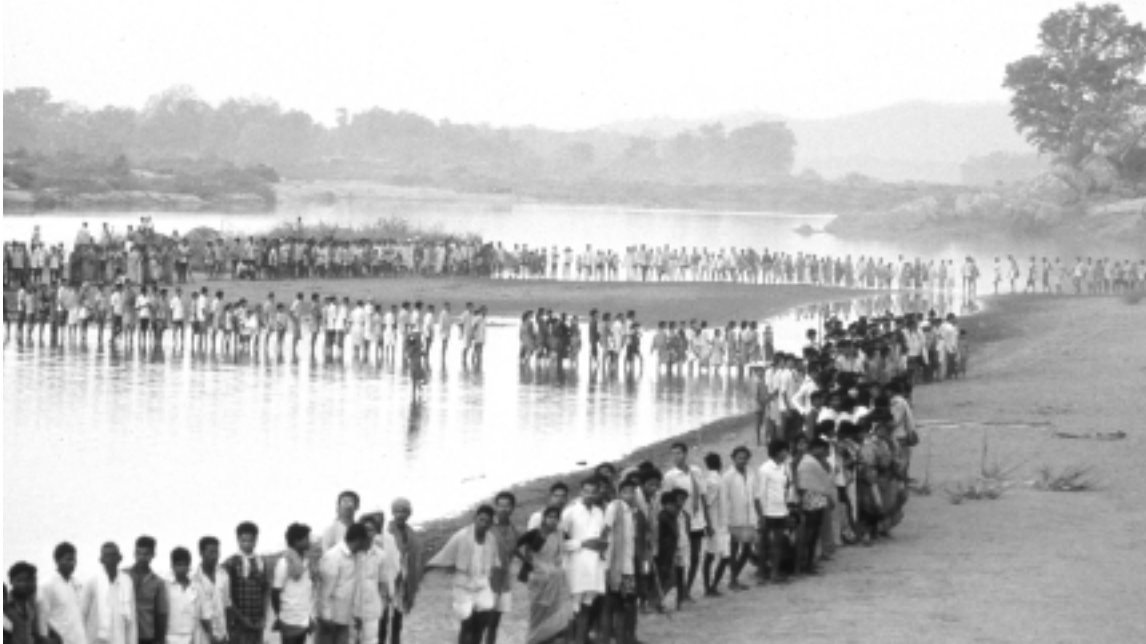
The lifeline of the valley and its people: for decades villagers have rallied against the construction of dams on the Narmada.