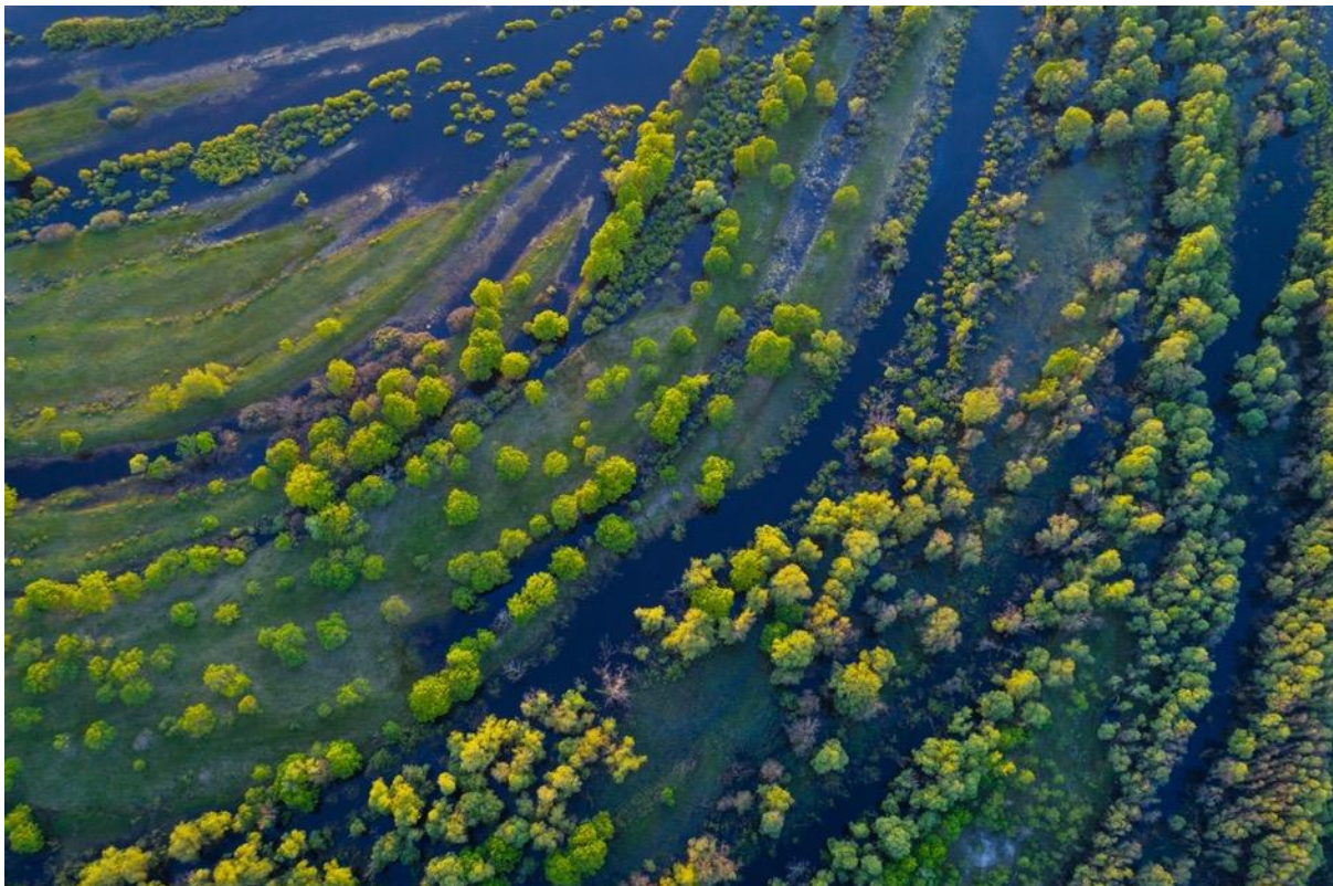
Pripjat River, Polesia.