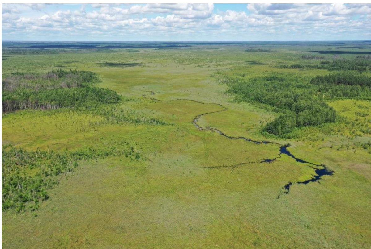
Almany Mires Nature Reserve.

The move followed commitments by authorities in neighbouring Belarus to expand protections of the Almany Mires Nature Reserve in March 2021. Almany was expanded by 10,000 hectares, bringing the size of the reserve up to 104,000 hectares – roughly the size of Hong Kong. Research carried out as part of the Polesia – Wilderness Without Borders project, supported by the Endangered Landscapes Programme and Arcadia – a charitable fund of Lisbet Rausing and Peter Baldwin – helped to identify crucial habitats for rare wildlife in need of protection.