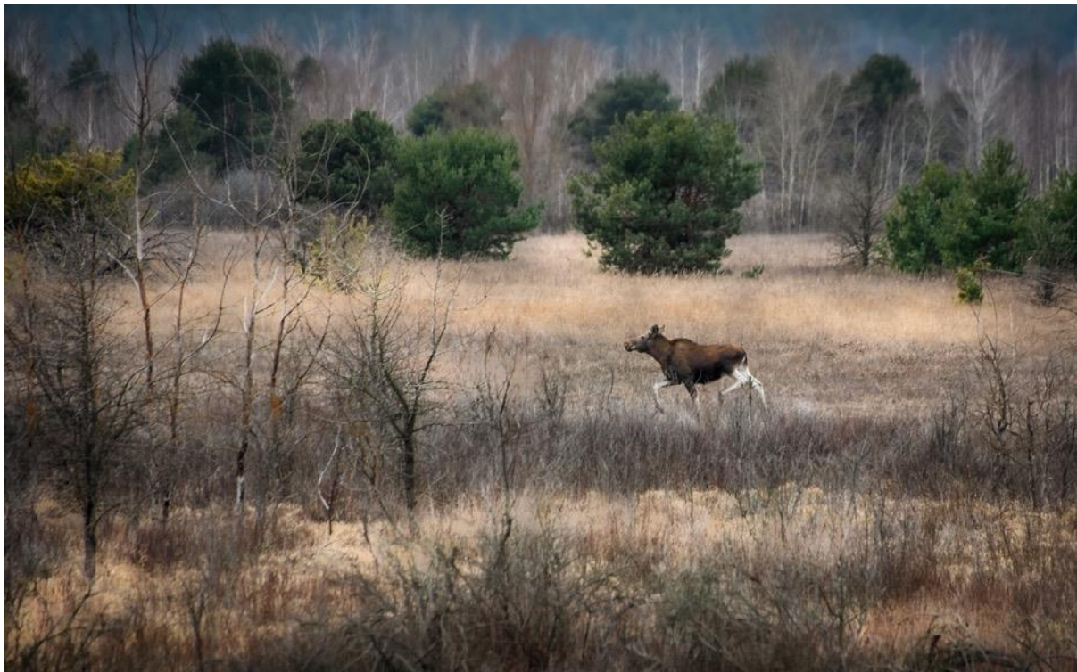
A moose in Polesia.

These vast habitats provide sanctuary to a number of vulnerable species, including eagles, wolves, bears, lynx, and bison. Hundreds of thousands of migratory birds pass through the region. In the springtime, numbers of at least 150,000 – 200,000 Eurasian Widgeons, 200,000 – 400,000 Ruffs, and 20,000 – 25,000 Black-Tailed Godwits have been recorded in Polesia's Pripyat floodplains alone. It is a key breeding ground for many globally threatened species.