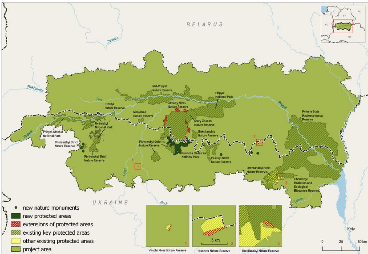
Map caption: Since the start of the Polesia – Wilderness Without Borders project in 2019 almost 35,000 hectares have gained legal protection status. Pushcha Radzivila National Park (dark green area at the centre of the map) is the area’s latest designation, while areas in red show the 10,000 hectare expansion to Belarus’s Almany Mires Nature Reserve which now spans 104,000 hectares.

“There is an astonishing diversity of plants and animals in Polesia. The presence of species such as the Greater Spotted Eagle, the Eagle Owl, the Great Grey Owl, the Pygmy Owl, the Black Stork, the lynx, and other rare species have been identified as key indicators when identifying priority areas for such protections.”