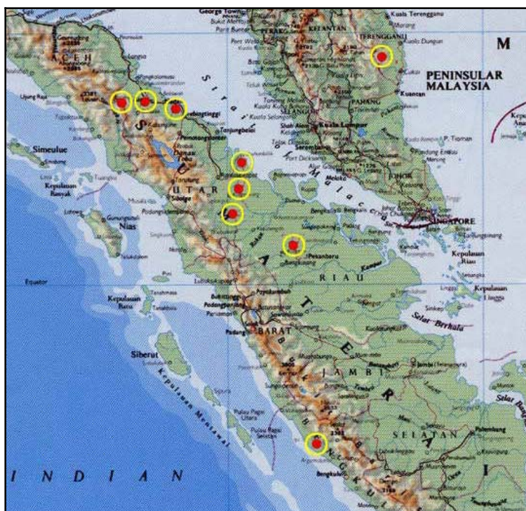
Figure 1. Oil palm estates of the Anglo-Eastern Group