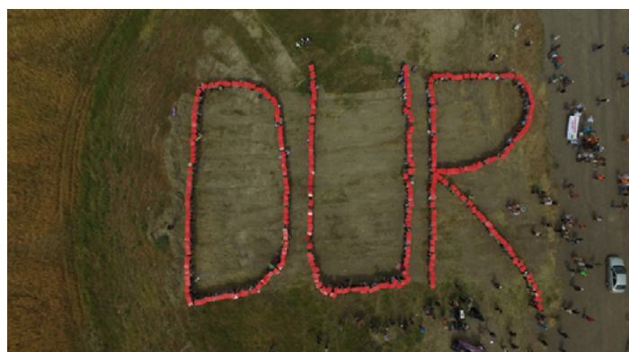
'DUR' – 'STOP' in Turkish – marked out by coal protestors next to a coal ash dam in Aliğa during last May's Break Free action