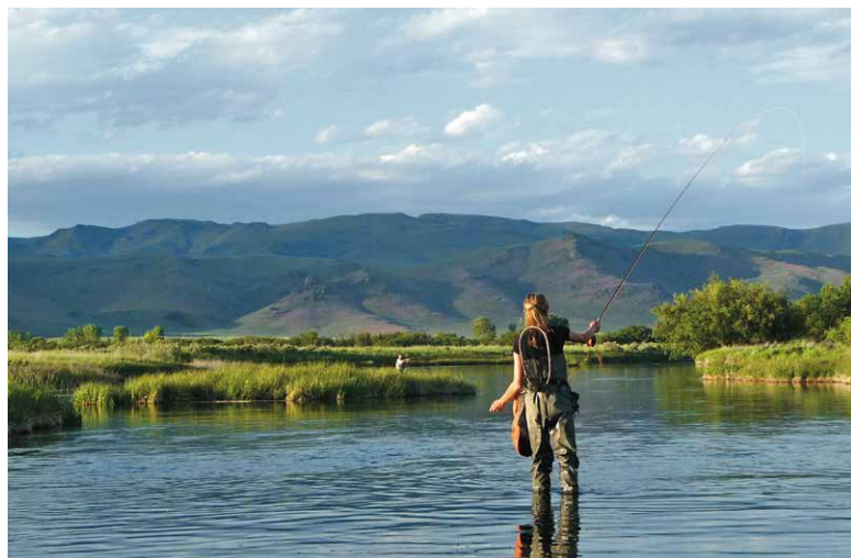
Tourism expenditure linked to wetlands is estimated at around USD 925 billion each year

by low water levels and a lack of wetland management capacity. SIPD took the initiative to involve IUCN and Wetlands International to find ways to tackle these challenges. The Majnoon project activities are designed to demonstrate that sustainable gas and oil development and conservation can go hand in hand. Meanwhile, the initiative aims to help the government achieve its goal of ensuring sustainable, social and economic development through wise use of ecosystems, sustaining the livelihoods of the Iraqi people, including marshlands communities.