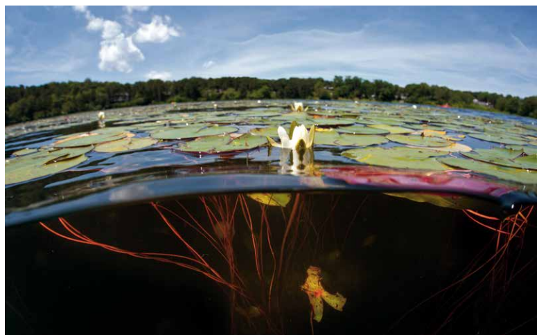
The Ramsar Convention is the only global treaty to focus on one single ecosystem