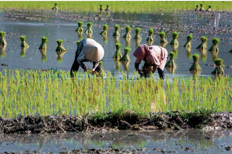
Women harvesting rice, Vietnam

To conserve Beung Kiat Ngong, IUCN Lao PDR created a plan to reduce overfishing and over-harvesting, as well as enhancing food security in 13 surrounding villages that directly depend on the site for income. This includes increasing the yield of rice and using tourism as an alternative source of income. IUCN Lao PDR developed a co-management plan for the Beung Ngong Ramsar site, drafted jointly between the communities and the Ramsar Provincial Committee.