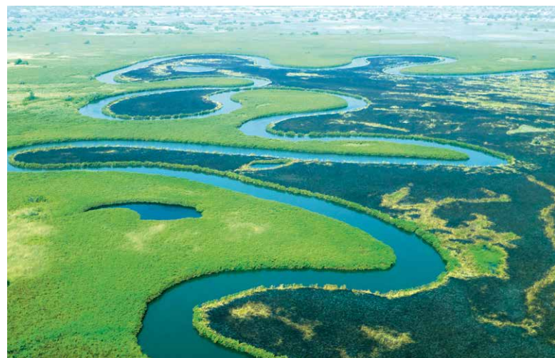
Okavango Delta

IUCN also provides a solid platform in the region for establishing partnerships for the Ramsar Convention and its Parties. For example, IUCN is working with the Ministry of Water and Environment of Uganda at Lake Bisina, Lake Opeta and Lake Mburo-Nakivale Ramsar Sites. Together, Wetland Community Conservation Areas were set up as a means of bringing together communities, local government and the national authorities, to put wetlands 'wise use' into action. Included in the COBWEB project evaluation is the increased income of