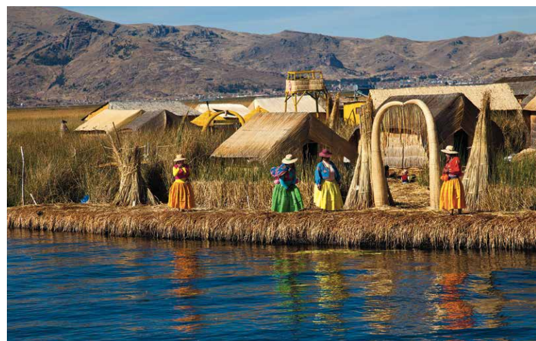
Lake Titicaca