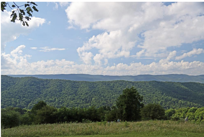
Figure 3. Photograph of Little Mountain. After removing all the trees and vegetation from the top of Little Mountain (in the foreground), the height of the mountain itself will be reduced by approximately 20 feet.

Moreover, the term “practicable,” as defined by the FERC report, means “available and capable of being done after taking into consideration cost, existing technology, and logistics in light of the overall purpose of ACP.” 19 Clearly, the process of decapitating 38 miles of ridgetops will not allow Dominion to “restore” these mountains to anything resembling their original geological and ecological state. As the federal government itself said in its review, “construction on steep slopes would result in permanent, irreversible alterations of geologic conditions.” 20 With this new information, the debate is settled: The ACP—and MVP—will cause irrevocable harm to the region’s environmental resources.