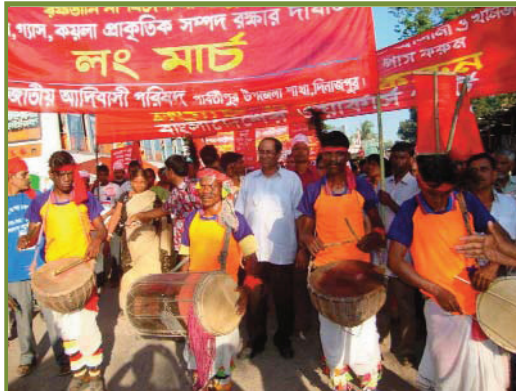
Indigenous people joined thousands of Bangladeshi citizens in a 7-day march to Phulbari in October 2010, demanding a ban on open-pit coal mining.

Over a 30-year period, GCM proposes to extract 572 million tons of coal from a series of 1,000-foot-deep pits covering a total of 14,500 acres in Phulbari; build a power plant where some of the coal will be burned; build railroads and ports to export the rest; and divert and dredge rivers to accommodate the barges and ocean-going ships that will carry the coal downriver and out to sea through the Sundarbans protected mangrove forest reserve (a UNESCO World Heritage Site). The company promises to provide jobs, electricity, royalties at 6 percent, tax income, and at the end of the project a lovely lake.