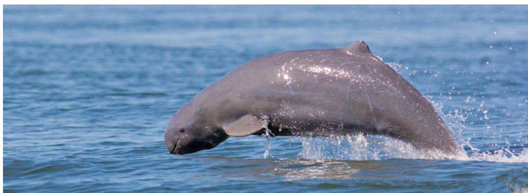
The Irrawaddy River, which is one of the only large, free flowing rivers left in highly populated areas, is home to the Irrawaddy Dolphin, classified as Critically Endangered by the IUCN Red List.

While the global CSI study is the most comprehensive standard to date and is a useful reference, banks should not solely rely on its results for determining which rivers are free flowing and thus, "No Go" areas. Each river ecosystem is unique, and so assessments should be undertaken at river-basin or regional levels in order to examine and anticipate how a proposed project may impact a river system, as based on the proposed pressure indicators. Furthermore, in addition to these pressure indicators, all risks and impacts associated with a proposed dam or related infrastructure must be thoroughly assessed for local and trans-basin impacts. This should take into account cumulative and transboundary impacts. Notably, these pressure indicators do not account for cultural, social, recreational, or other similar values.