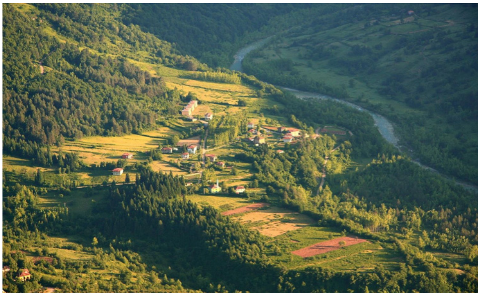
Area in Kure Mountains, Turkey where the Cide Regulator and Hydropower Plant is planned to be built