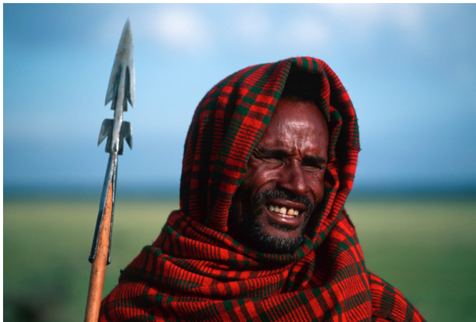
Man of the Oromo tribe, Ethiopia, with his fishing spear