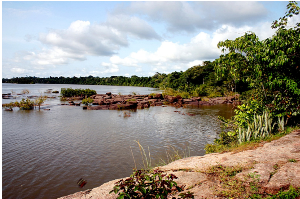
Xingu River, Brasil