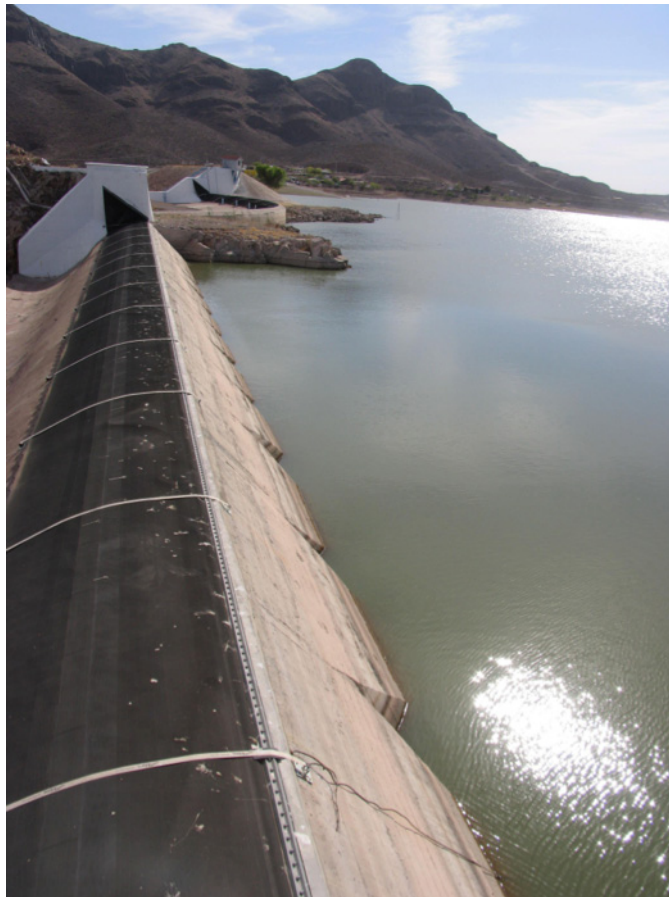
Irrigation Dam, Chihuahua State, Mexico