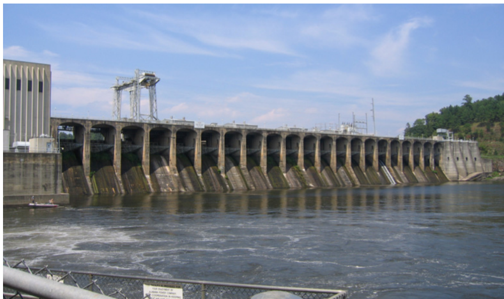
The Mitchell Dam, one of seven dams along the Coosa River

Once a river is dammed, not all is necessarily lost. Options exist for recovery and restoration of the ecosystem. Approaches can include dam removal at the end of its useful lifespan or adaptive management. Under US law, the Federal Energy Regulatory Commission (FERC) reconsiders dam licenses every 30 to 50 years, with the U.S. Fish and Wildlife Service (USFWS) responsible for conducting environmental reviews during the relicensing process.