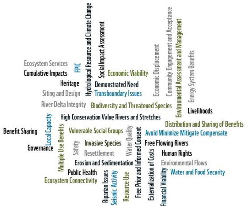
Figure 1. Sustainability aspects to consider in dam projects

Seventh Sin: Blindly Following Temptation / Bias to Build