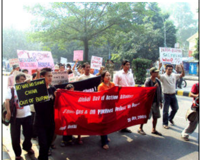
Protest in India