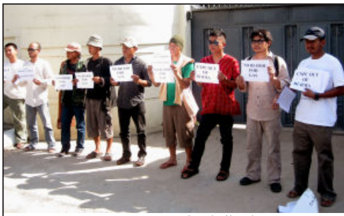
Protest in Thailand