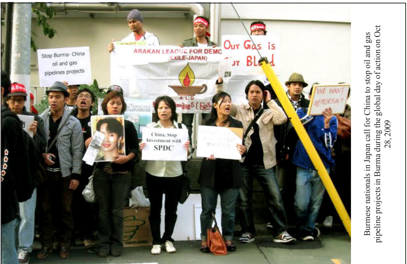
Burmese nationals in Japan call for China to stop oil and gas pipeline projects in Burma during the global day of action on Oct 28, 2009