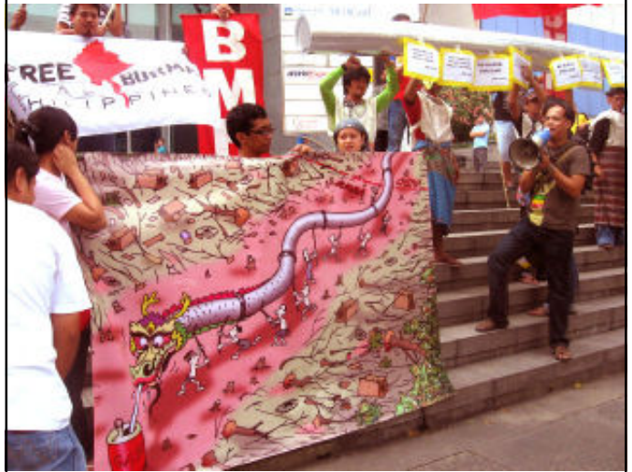
Protest in Manila, The Philippines