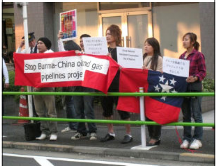
Protest in Japan