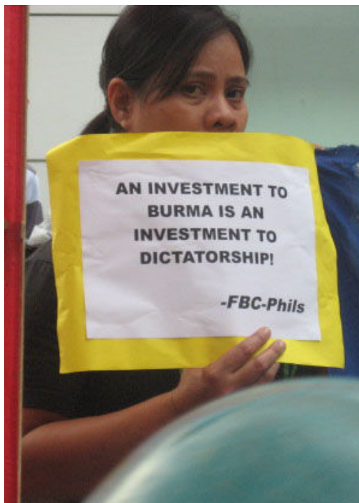
A protester in Manila during the protest calls for China to stop oil and gas pipelines projects in Burma

According to a report by environmental and human rights group formed by Arakanese, Arakan Oil Watch, the Burmese military regime has been seizing or destroying their lands and traditional oil wells with little or no compensation for the benefit of Chinese companies. ■