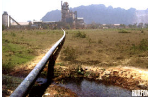
Kanbauk Myaing Kalay gas pipeline