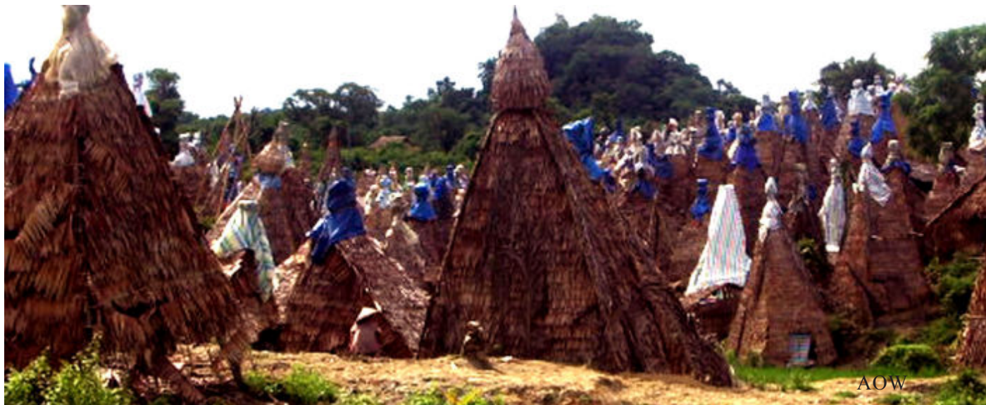
Local's traditional hand-dug wells in CNOOC's onshore block area in Kyauk Phyu Township in Arakan State