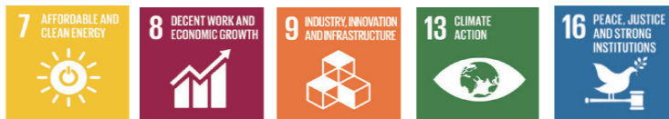
Figure 2. Commitment to the SDGs

The Group determines the sustainability issues material to the performance of its business and in relation to the expectations of its stakeholders, aligning itself with the Sustainable Development Goals (SDGs) by choosing priority and relevant SDGs