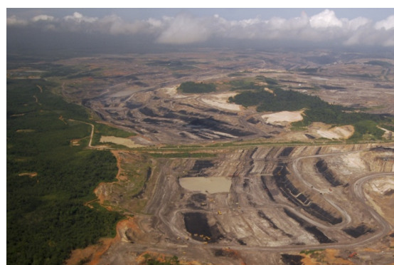
An aerial view of Adaro's Tutupan coal mine in Indonesia's South Kalimantan province

At the same time as expanding its offshore network, Adaro stands to benefit from Indonesian government financial guarantees for the US$4 billion Batang coal-fired power plant, which will be the biggest in Indonesia, in which Adaro is a joint venture partner. Adaro expects the power plant to create up to US$80 million a month in revenues for the joint venture, of which Adaro itself owns 34 per cent, once it is up and running. This means that, in effect, Adaro is relying on the government (and therefore Indonesian citizens) to provide a guarantee for one of its sources of future profit while, at the same time, making use of offshore companies which may reduce its potential tax payments in Indonesia.