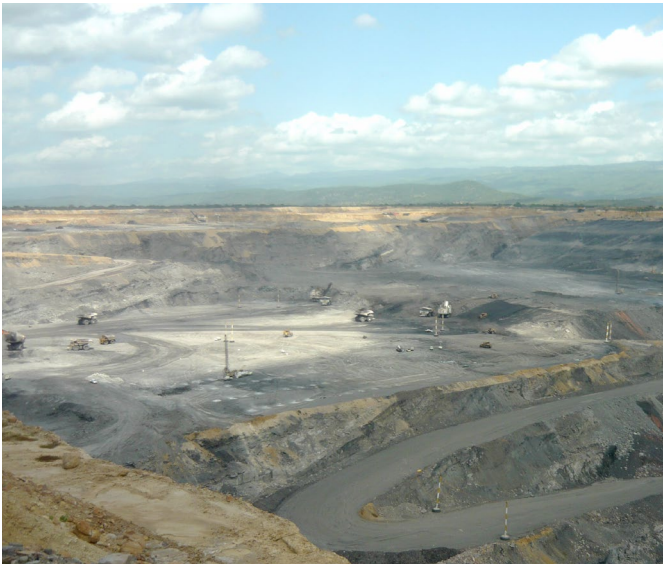
The Cerrejón mine claims to be one of the largest open pit coal export operations in the world.

Since 2011, Barclays, HSBC, Lloyds and RBS have contributed to lending syndicates which made an estimated $109 billion in financing available to Anglo American, BHP Billiton and Glencore. Each of these companies owns a third of the Cerrejón mine in La Guajira, in the north-east of Colombia. In total, these banks committed an estimated $10.6 billion to those lending deals.