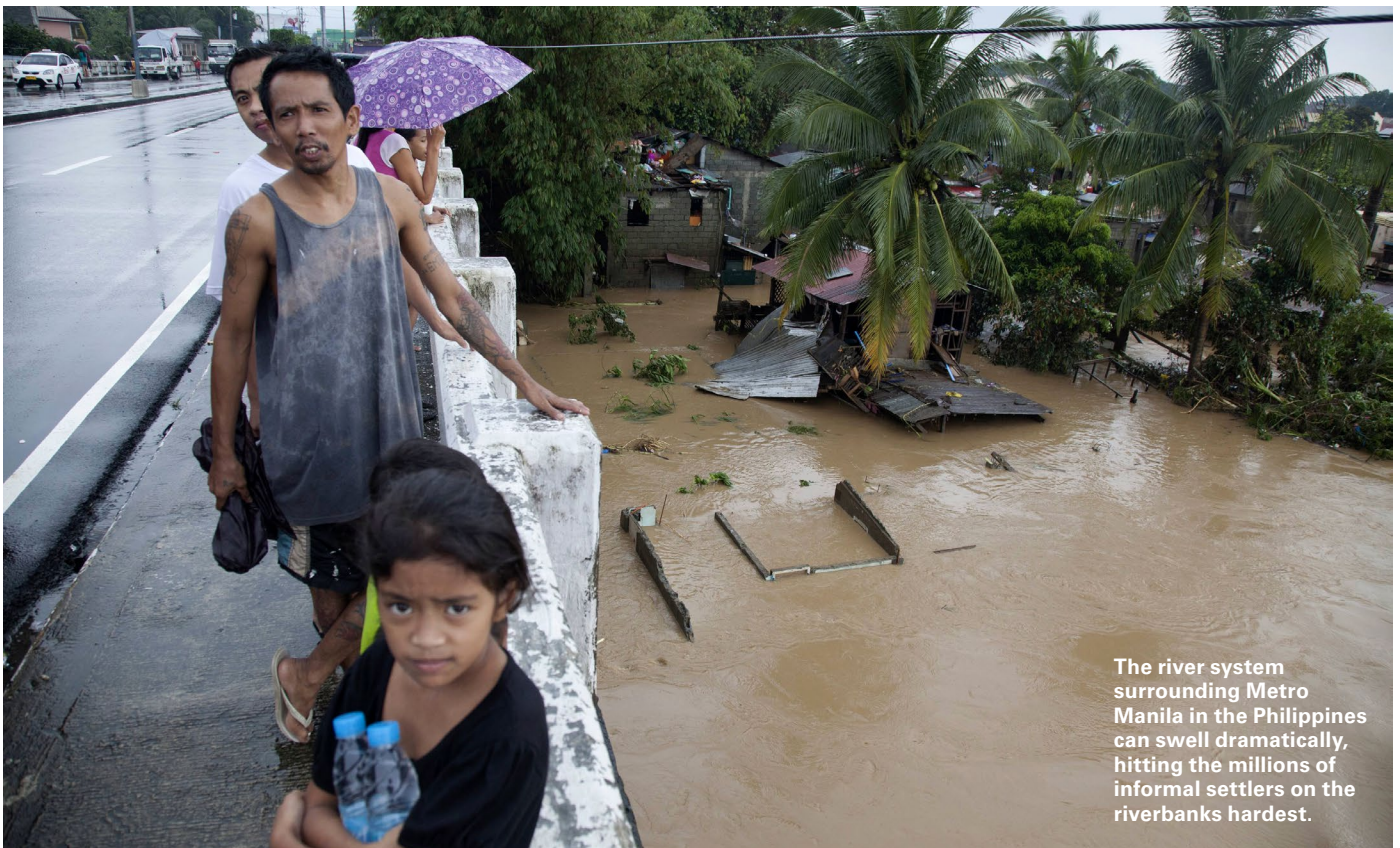
The river system surrounding Metro Manila in the Philippines can swell dramatically, hitting the millions of informal settlers on the riverbanks hardest.

Until recently, renewable energy was seen as alternative, expensive and unreliable, but technical progress and rapidly falling costs mean renewables are increasingly cost competitive. 1 Investment in renewables has risen substantially in recent years, and since 2015 renewables have made up more than