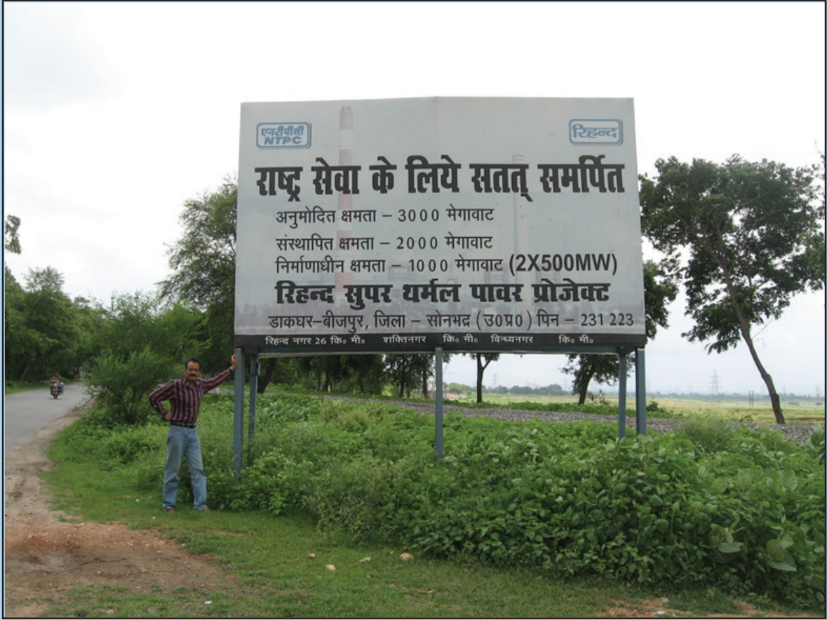
A Billboard of NTPC saying "Always Dedicated for Nation's Service", Rihand Super Thermal Power Project