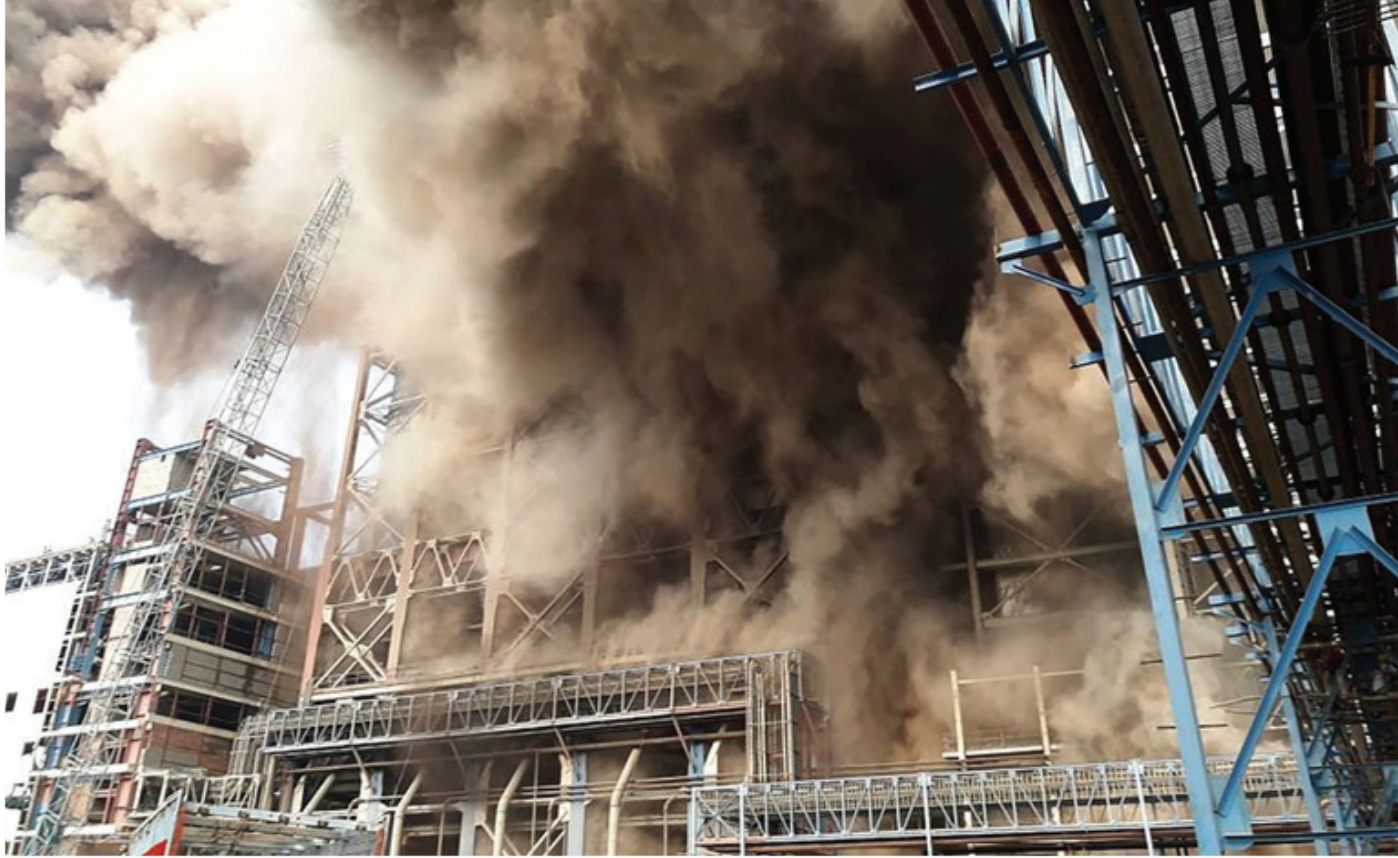
▲ Visual after the boiler blast at Unchahar Power Plant, Uttar Pradesh

While the case studies mentioned here are different from each other in terms of the nature of violations caused by the specific projects, the binding thread among all these case studies has been that despite NTPC being a government-owned company, the interests of the company has been put in forefront and the well-being of the communities and the environment has been made secondary. Moreover, NTPC would not have been able to move ahead with its ventures had it not been getting the backing up of state machinery, which is rather supposed to act as a regulator on the actions of such companies. The case studies also show the lacuna in our system, where people are not able to hold a government-owned company accountable for its actions and one can imagine how much more difficult it is to make the private companies answerable to the people. NTPC's logo on its website is displayed prominently which says, "Beyond Power and Profit", but in reality, as reflected on the ground, indicates that NTPC basically cares about is its profits and growth, not the well-being of communities it displaces, nor the safety of its workers. Going through the following case studies will let the readers take a deeper look into the incidents which led to loss of lives in Unchahar and Barkagaon and the nature of protests faced by NTPC in Pudimadaka and Kudgi, along with a detailed look into the failed venture of NTPC in Sri Lanka.