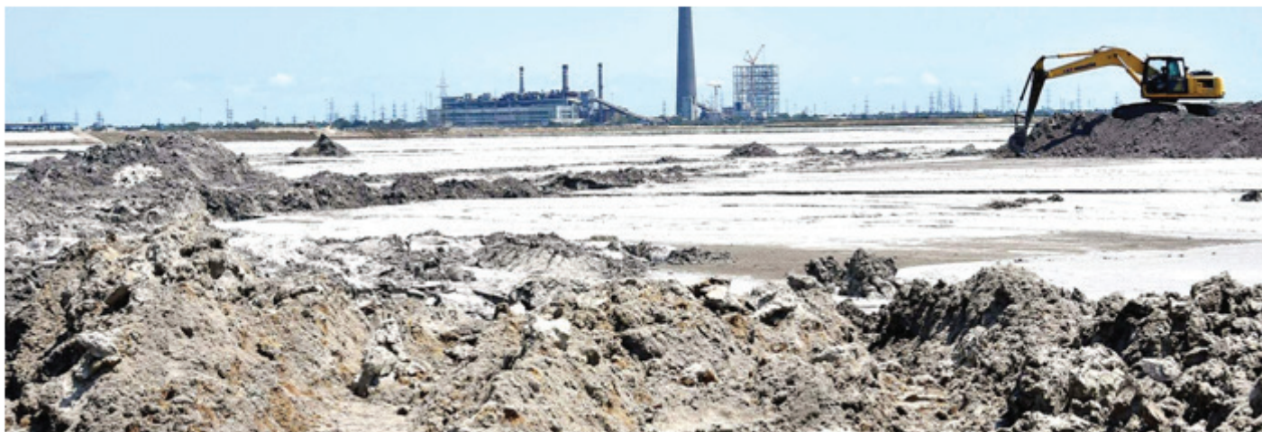
▼ Dried up fly ash pond of Vallur Thermal Power Station, Tamil Nadu

Even though NTPC has been accorded 'Maharatna' status by the Government of India, NTPC has shown a poor track record when it comes to safety of its workers, whether permanent workers or those working on a contractual basis. The Unchahar accident in November 2017 exposed a major negligence on the part of NTPC, but it was not an isolated case. There have been multiple instances of accidents inside NTPC power plants which have led to severe injuries to workers and even