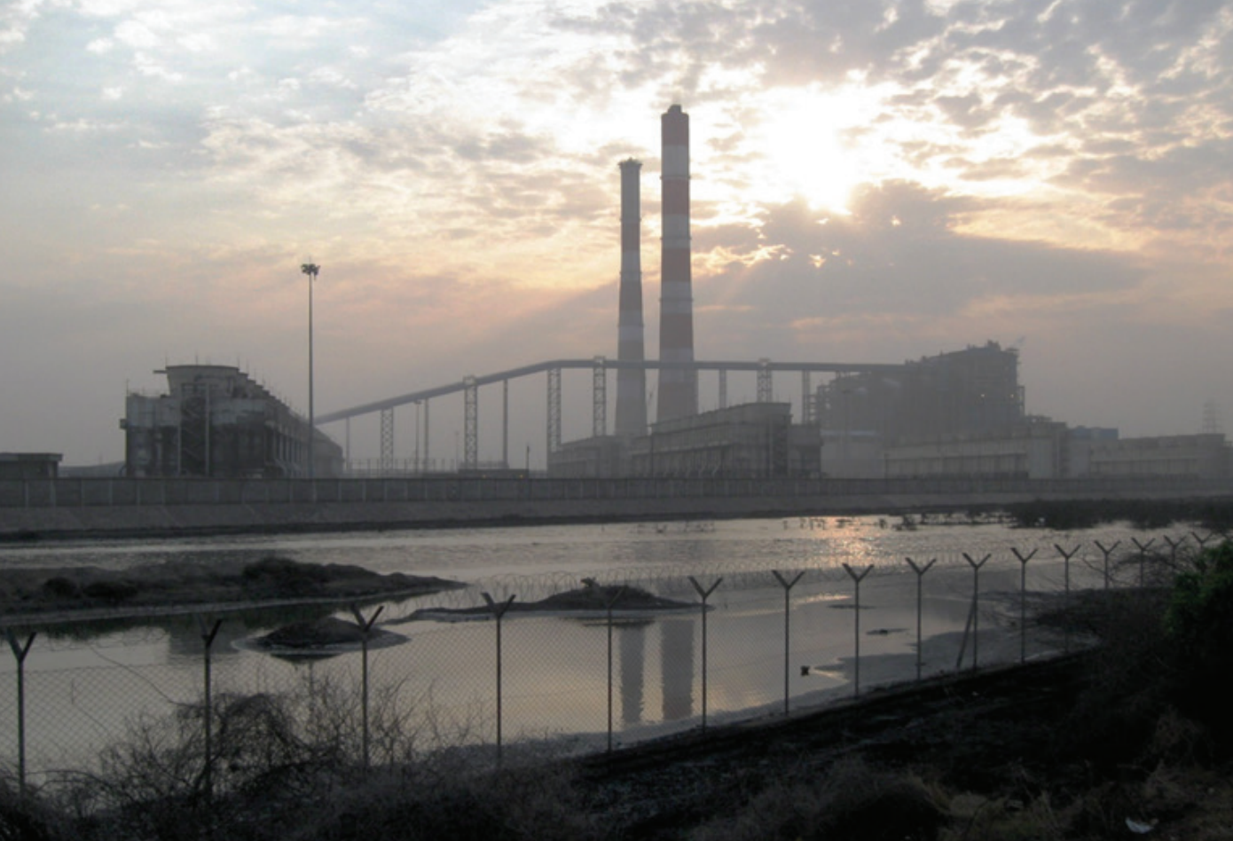
▲ NTPC's Vallur Thermal Power Station, Tamil Nadu

of the ash pond from their village. The villagers had also been opposing maintenance work of the plant.