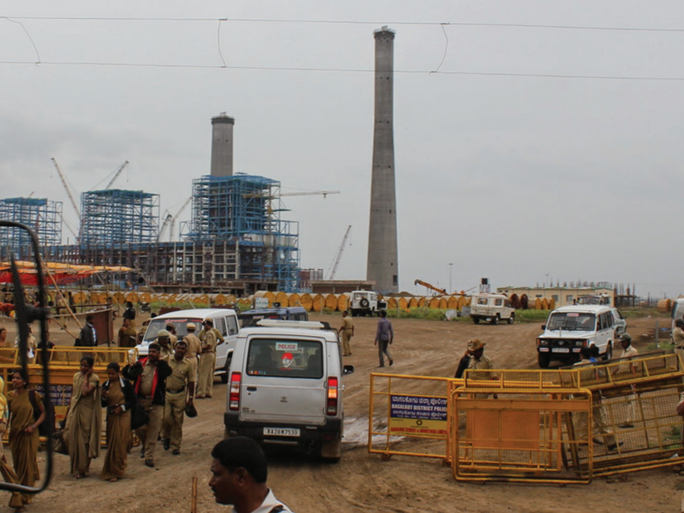
▼ Kudgi NTPC Power Plant on 21 July 2014

the total capacity of Kudgi power plant to 2,400 MW capacity. 72 However, there is still uncertainty over the Stage-II of the expansion of Kudgi power plant, which would have taken up the plant's capacity to 4,000 MW. A news article came in March 2017 that NTPC was planning to shelve the expansion plans of the Stage-II of the project and that it may use the left over space of the 3,500 acres for adding solar power capacity. 73