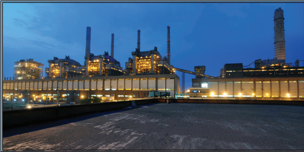
An evening view of NTPC Power Plant in Korba, Chhattisgarh