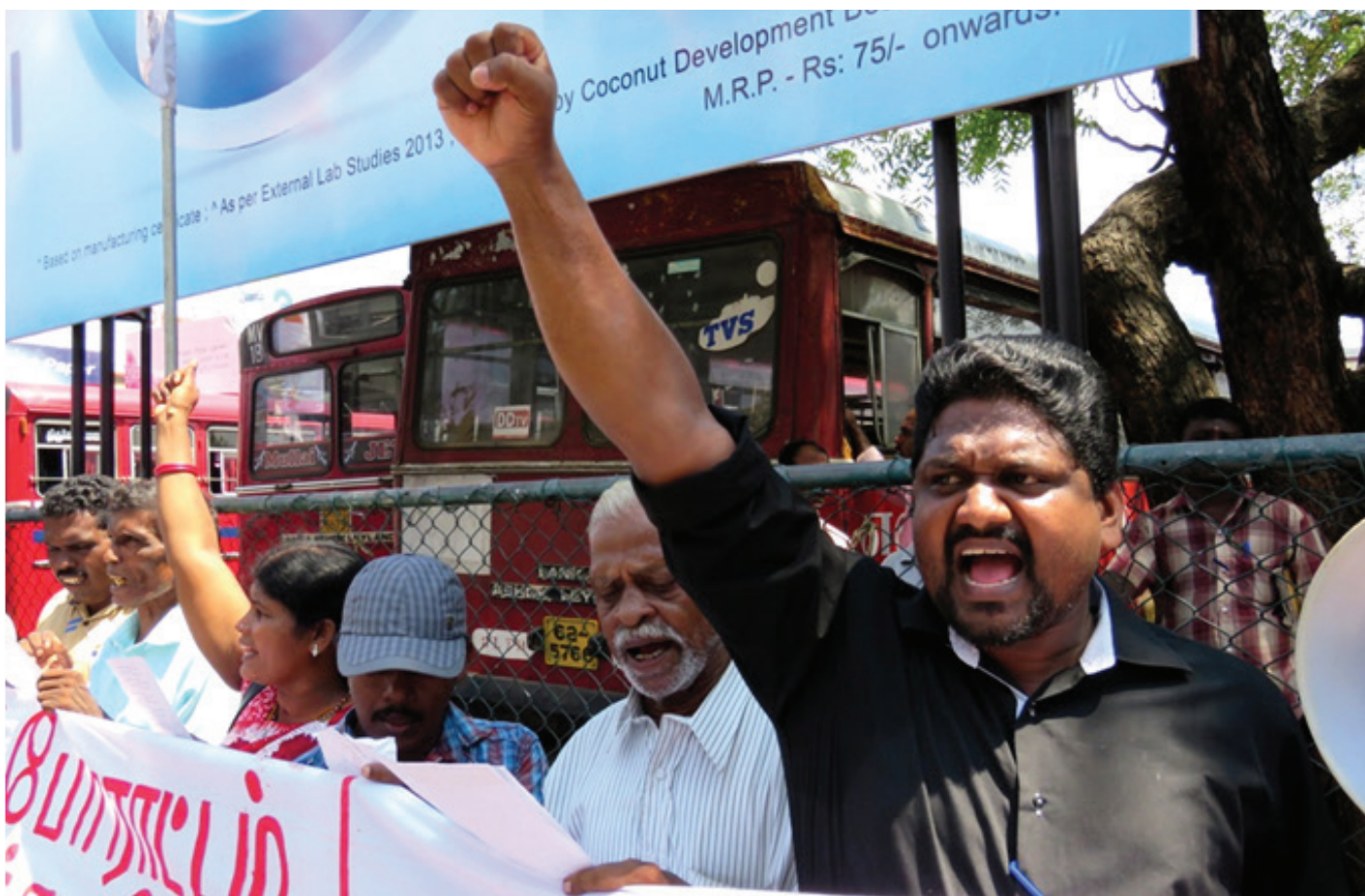
▼ A protest against the NTPC power plant in Trincomalee, Sri Lanka