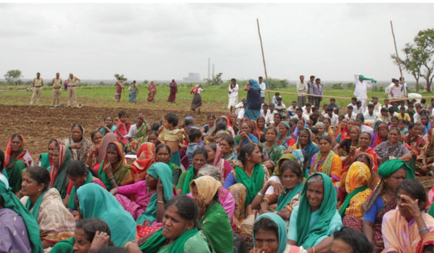
▲ Women protesting against the Kudgi Power Plant