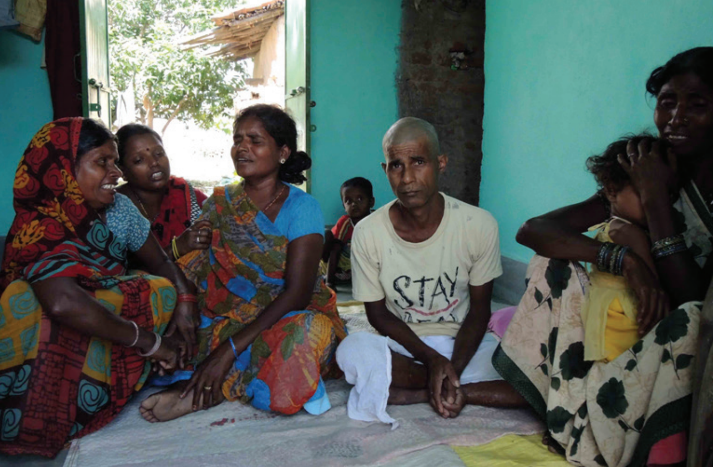
▲ The family of a 16-year-old student killed in Barkagaon firing mourns his death

a statutory requirement for the owner of every boiler to obtain a certificate authorising the use of boiler and every boiler needs to be inspected at least once a year by the boiler directorate for the purpose of annual renewal of the certificate. Unfortunately, the renewal of certificate for unit six was due in December 2017. 17 There was also a lapse in providing protective gear to the workers while working in a hazardous environment. The loss of lives and the grave injuries to the workers would remain a dark blot in the track record of NTPC in the years to come; it also raises several concerns on the safety of workers located in other plants of NTPC across the country and what steps NTPC would take to ensure that another such accident does not happen in the future.