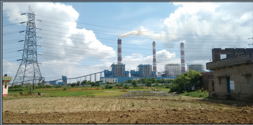
View of NTPC Barh Thermal Power Plant in Bihar