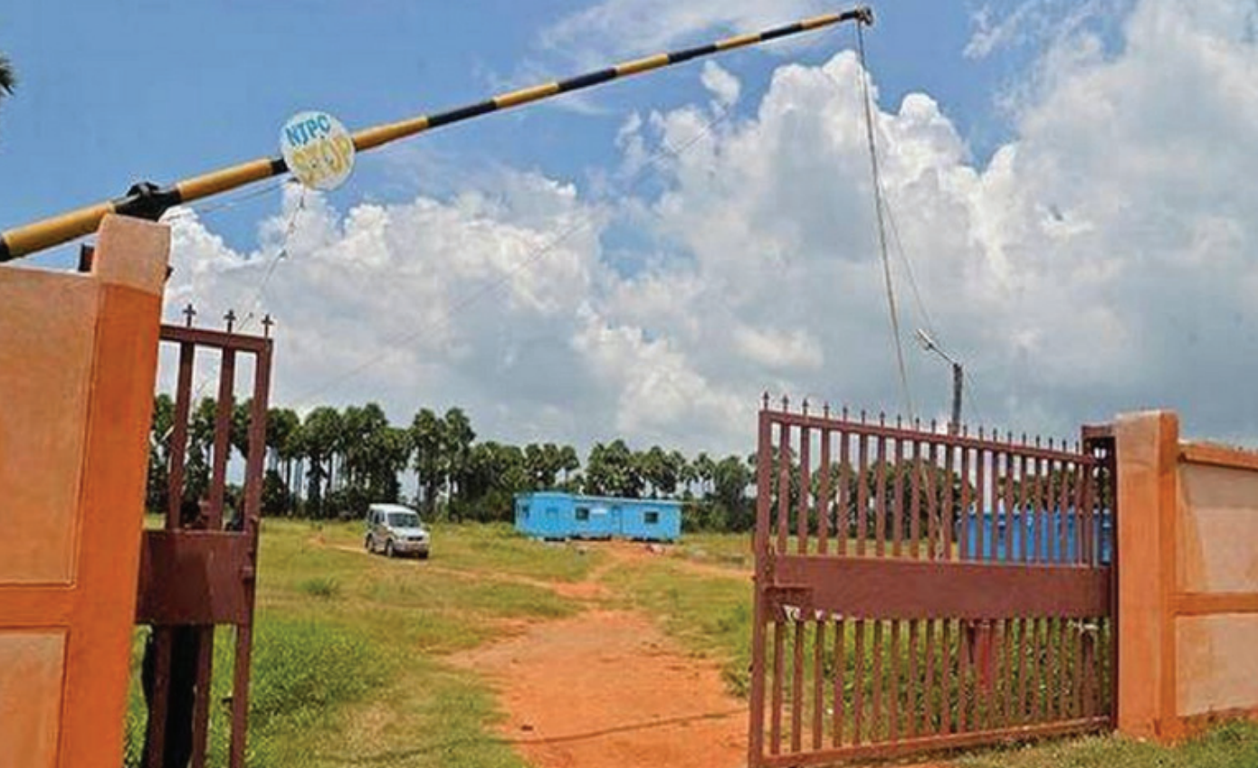
▲ Construction site chosen for NTPC Pudimadaka Power Project

had decided to use domestic coal instead of importing coal, for which a fresh feasibility study would be done, which would take six to nine months. NTPC had submitted its proposal to Ministry of Environment and Forests (MoEF) on November 23, 2015, but the MoEF expert appraisal committee had returned the NTPC proposal after reviewing it. MoEF had sought more details about the public hearing held on August 12, 2015 and specifically asked for the MoU on the coal supply for imported coal. Later, an NTPC official informed that in a meeting with the Union Power Minister in presence of other state officials that it was eventually decided to use domestic coal to save foreign exchange. Because of the change in coal linkage, NTPC had also required another 1,000 acres of land for building an ash dyke and the capacity of proposed power plant was reduced from 4,000 MW to 3,200 MW (4x800 MW). 39 In October 2016, the central government had assured fuel linkage from Coal India Limited (CIL) for the project, which was considered as a major boost for the project to take off. 40