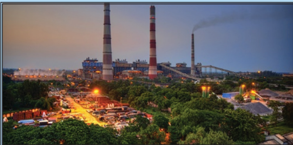
An evening view of NTPC Power Plant