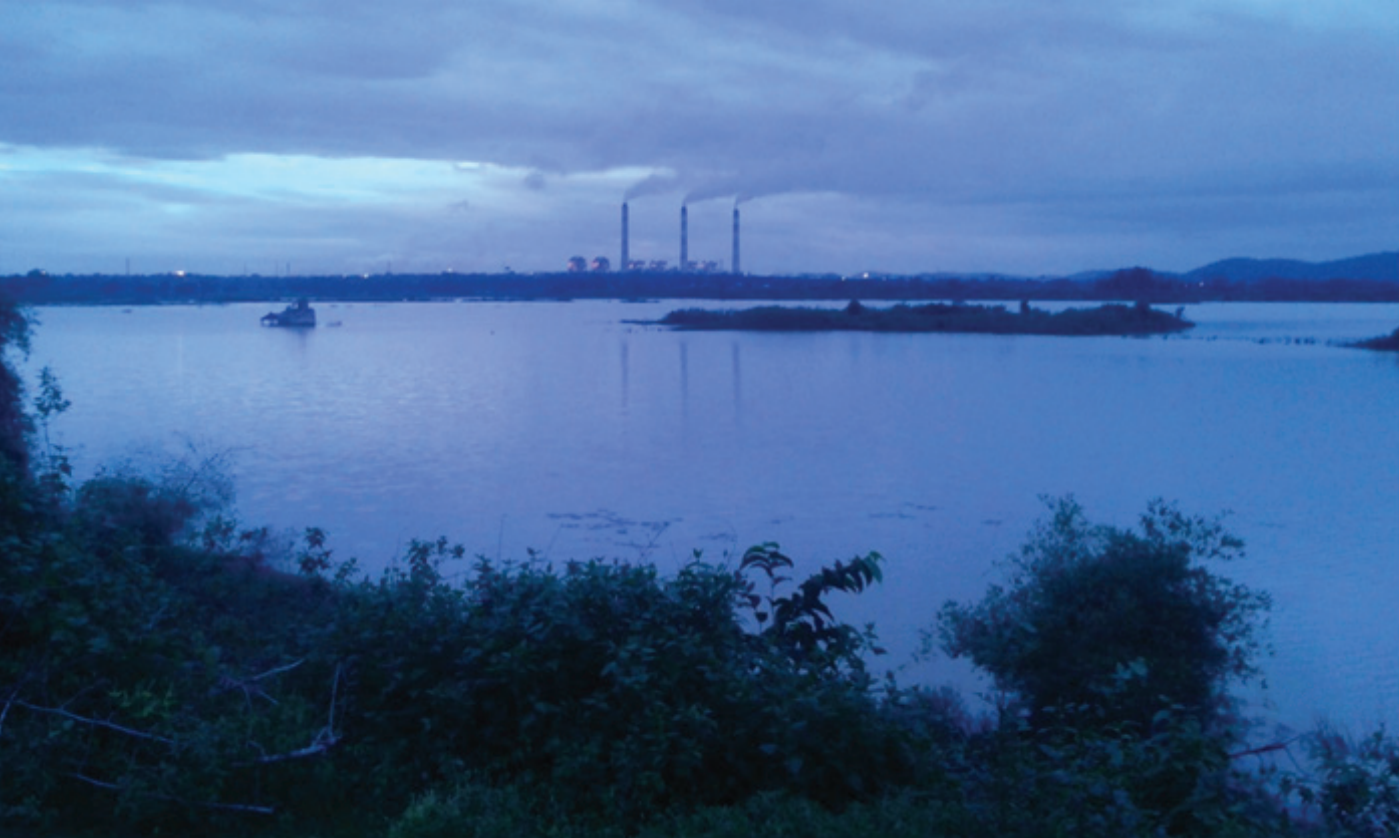
▲ Panoramic View of NTPC Kaniha Power Plant, Odisha

death in some cases. Even, NTPC has not paid compensation properly in case of death of workers inside its plants. Given below are several instances of accidents at NTPC's plants and raises questions on how seriously the workers' safety is valued by NTPC: