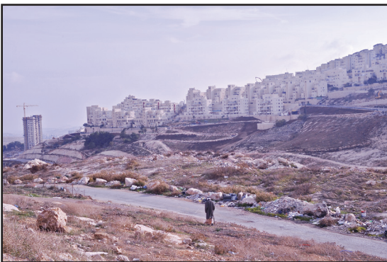
Har Homa settlement, photo by JC Tordai, 2009

United Nations Office for the Coordination of Humanitarian Affairs Cartography: OCHA-oPt - January 2012. Base data: OCHA, PA MoP. Settlement data: Peace Now, OCHA update 08. For comments contact <ochaopt@un.org> or Tel. +972 (02) 582-9962 http://www.ochaopt.org