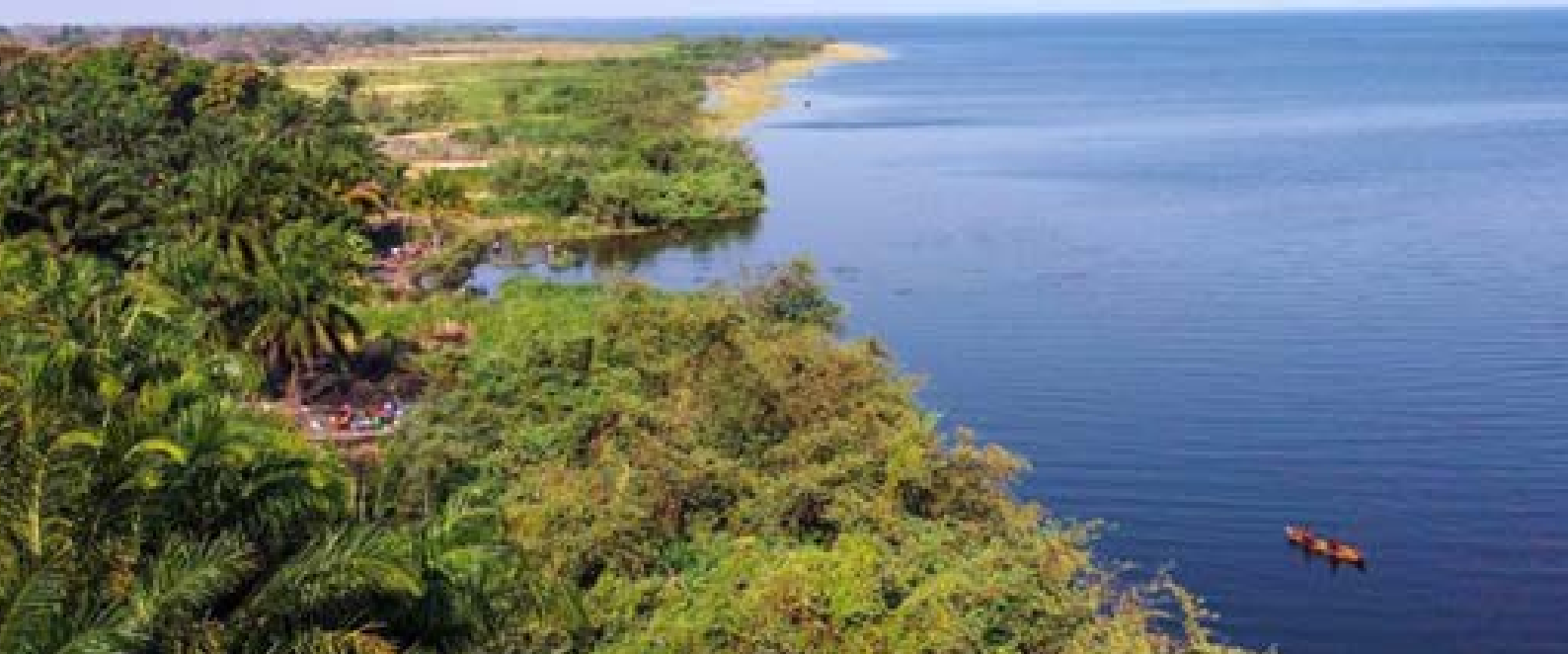
A view of Lake Upemba whose main activity is fishing and water games for the children of fishermen, July 2022