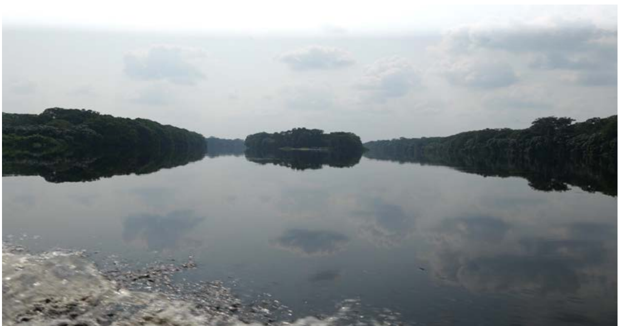
View of Maringa river near Basankusu, July 2022

Most villages are inaccessible and lack any infrastructure. The source of drinking water supply is rivers and streams, as well as poorly maintained springs. The medical infrastructure is very rudimentary and could in no way support cases of water-borne diseases, which can be expected in cases of oil pollution.