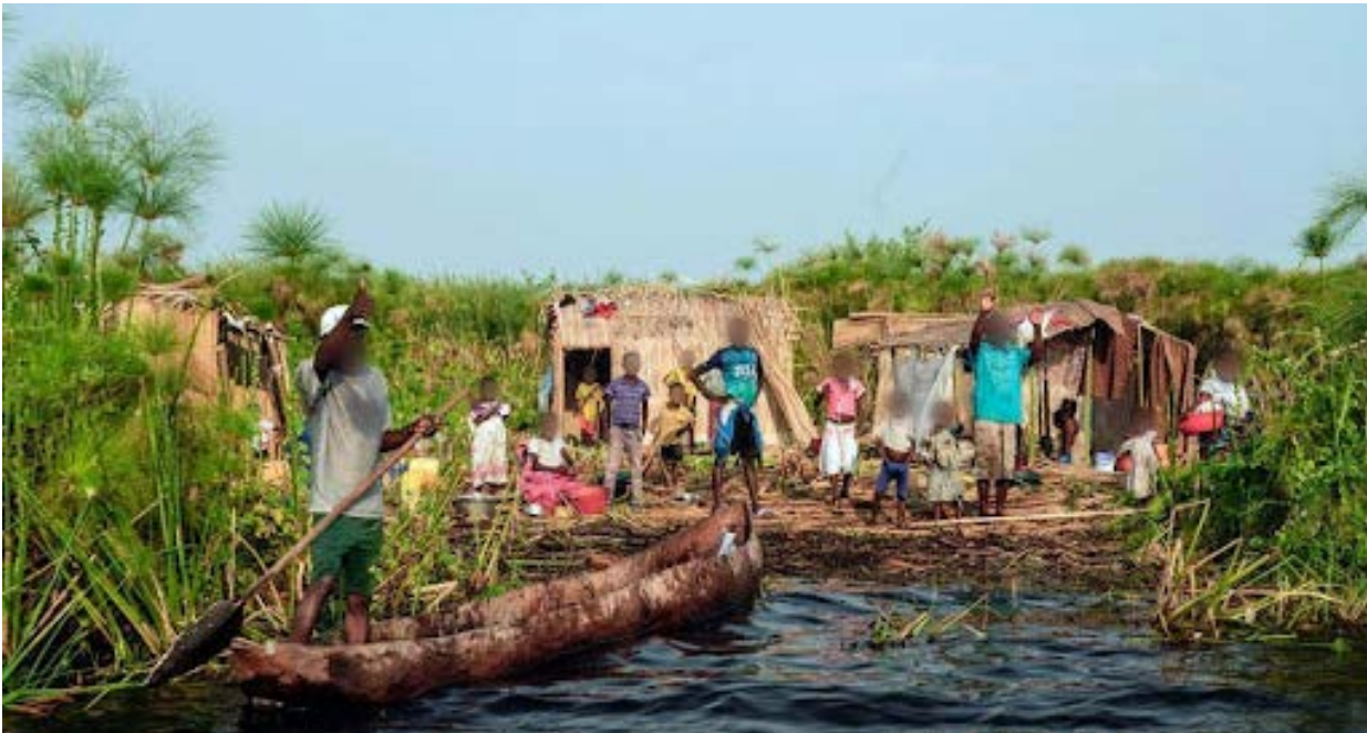
The dwellings of itinerant fishermen on the shores of Lake Upemba, July 2022

The lake is also part of their core cultural heritage: it serves as an important site for the initiation of children - boys and girls from the age of four - to the practice of fishing. A resident said: "No one has been informed of our government's decision to exploit the oil, let alone received any visit from the authorities of our country in recent months. The government project is not the model of economic activity compatible with our environment. It is harmful to us who live here and everything around us. We breathe fresh