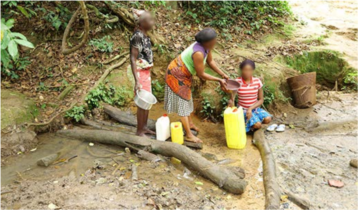
Water source in Mpoka village, Lukolela Territory, July 2022