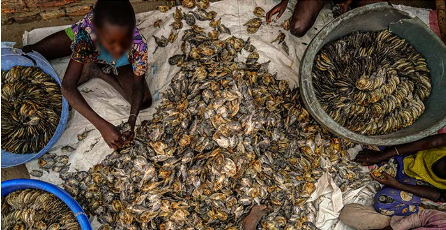
Batches of salted and dried fish, compacted in basins for the local market and imports, in the village of Missa near Lake Upemba, July 2022