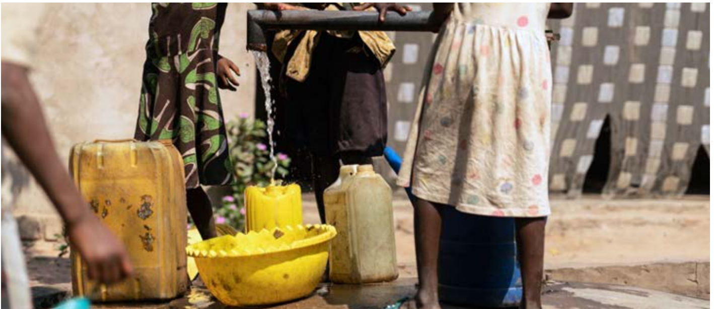
Villagers in the village of Kisungi get their drinking water from a borehole. July 2022

water other than lake water, which exposes the population to waterborne diseases such as cholera, often reported. Villages are inaccessible, with road traffic almost non-existent because of the deteriorated state of the road. Any oil spill could become a life-threatening calamity, poisoning local communities only water resources.