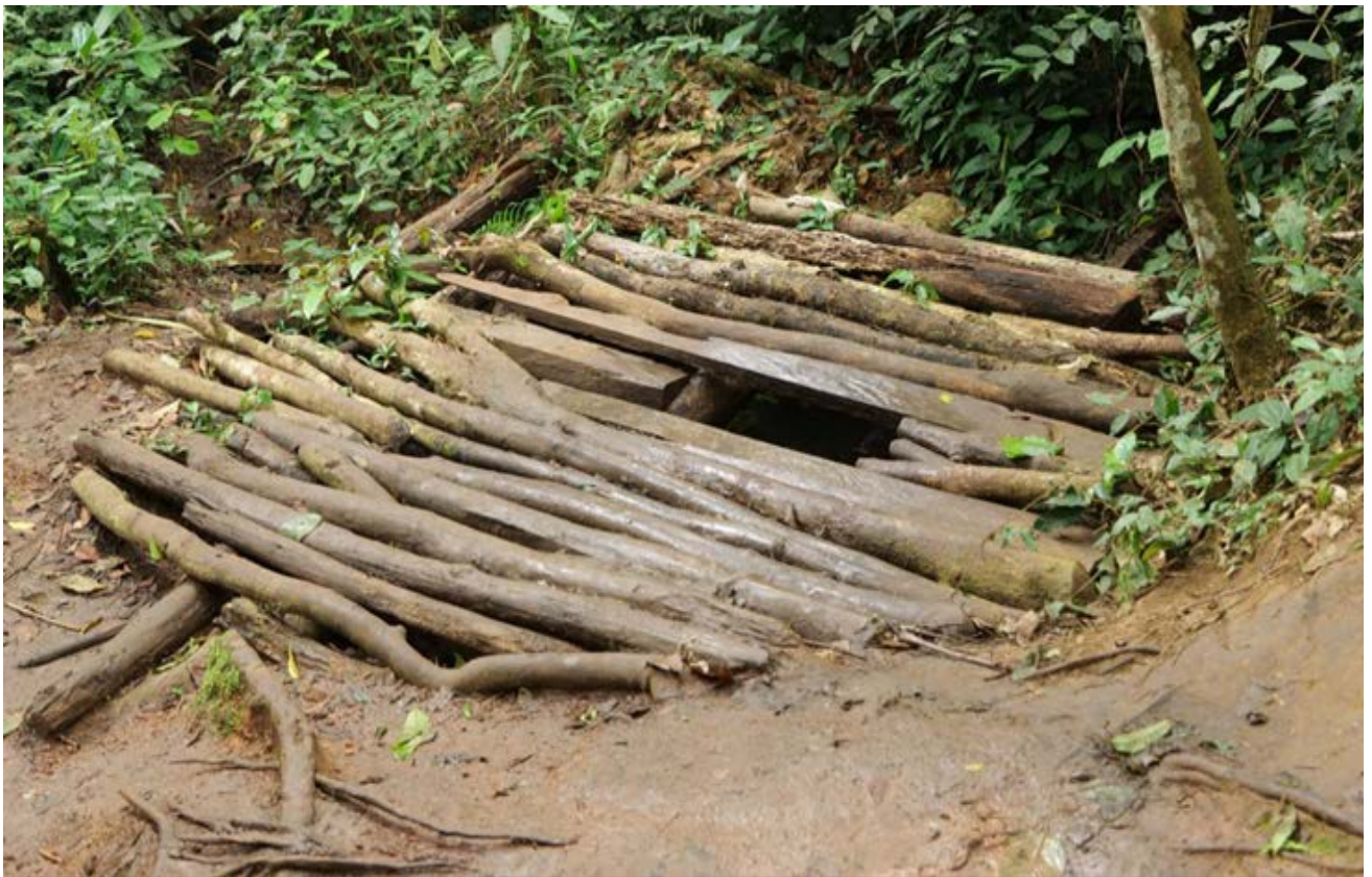
Water source in the village of Ilebo, July 2022

People use everything nature offers them. The largest means of transport used in the area visited are canoes, motorbikes and most people walk to reach certain activity centres.