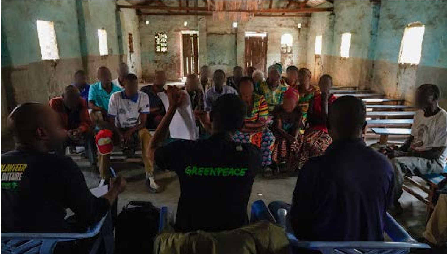
Batches of salted and dried fish, compacted in basins for the local market and imports, in the village of Missa near Lake Upemba. July 2022