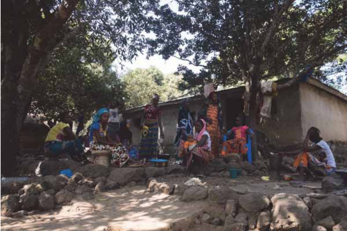
Women prepare food in Hamdallaye village in the Boké region. Compensation payments for land lost to mining are often paid to male heads of household or linages, even where the land is utilized by entire families or households. January 2018.

A widow said compensation for her household’s land was awarded to her husband’s family, denying her the revenue she used to support her children. “I used to grow rice and maize in the land where the port is now,” she explained. 193 “Because the compensation was paid after my husband died, it was his family who participated in the census that SMB conducted, and they are the ones who received the money from the company. I know who’s got the money, but I can’t go and claim it.” Female elders said this had happened to several other widows in the same village. 194