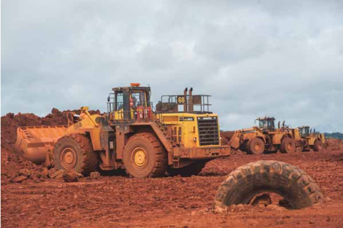
Bulldozers move bauxite at the Sangaredi mine operated by Compagnie des Bauxites de Guinée (CBG) near Boké, Guinea on September 8, 2015.

Mining has long been a major contributor to the Guinean economy, with mining revenues making up almost 20 percent of Guinea’s gross domestic product and almost 90 percent of its exports in 2014. 6 But despite its abundant mineral wealth, Guinea remains one of the world’s poorest countries, ranking 183 of 188 states in the 2015 Human Development Index. 7