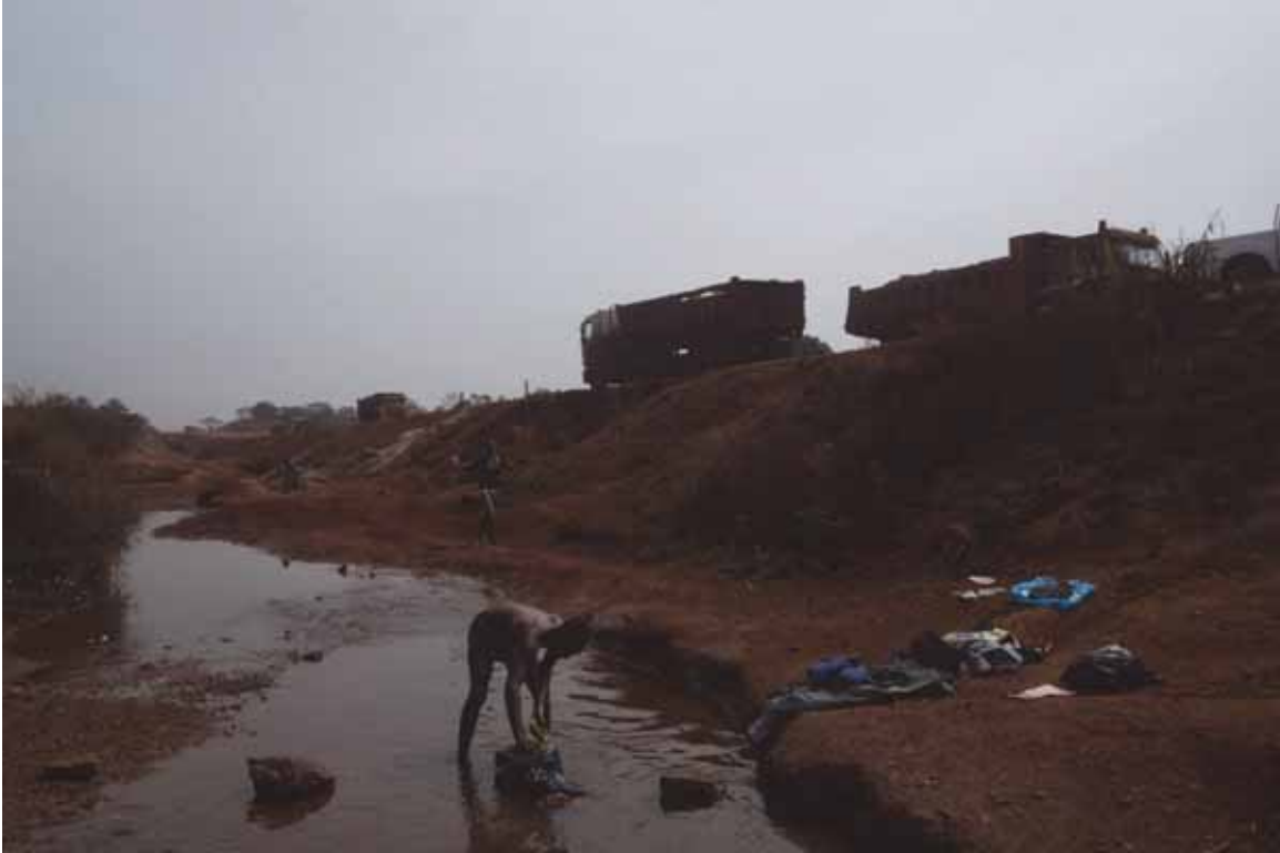
A man washes clothes next to a mining road belonging to the La Société Minière de Boké (SMB) consortium. Local communities state that the construction of SMB's mining roads blocked rivers and streams, diverting their course and reducing water levels in local wells.

CBG has for decades built, operated and maintained a water treatment system and pipe network that provides running water to large areas of Sangaredi town, where its mines are located, and the neighborhoods where its workers live in the port town of Kamsar. But in six of the rural villages that surround CBG's mines in Sangaredi, residents said that years of mining have damaged local rivers and streams. "We used the river for drinking water, for washing and fishing—it was clean water," said a community leader from Boundou Waadé. "But CBG has exploited near the source of the river, reducing its flow, and red mud from the mines flows into it during the rainy season." CBG said it follows international best practices to prevent mining-related damage to water resources and Halco (Mining) Inc., the holding company that comprises CBG's private-sector shareholders, told Human Rights Watch that: "CBG is unable to address claims [relating to damage to water sources] of an unsubstantiated nature dating back as far as 1973."