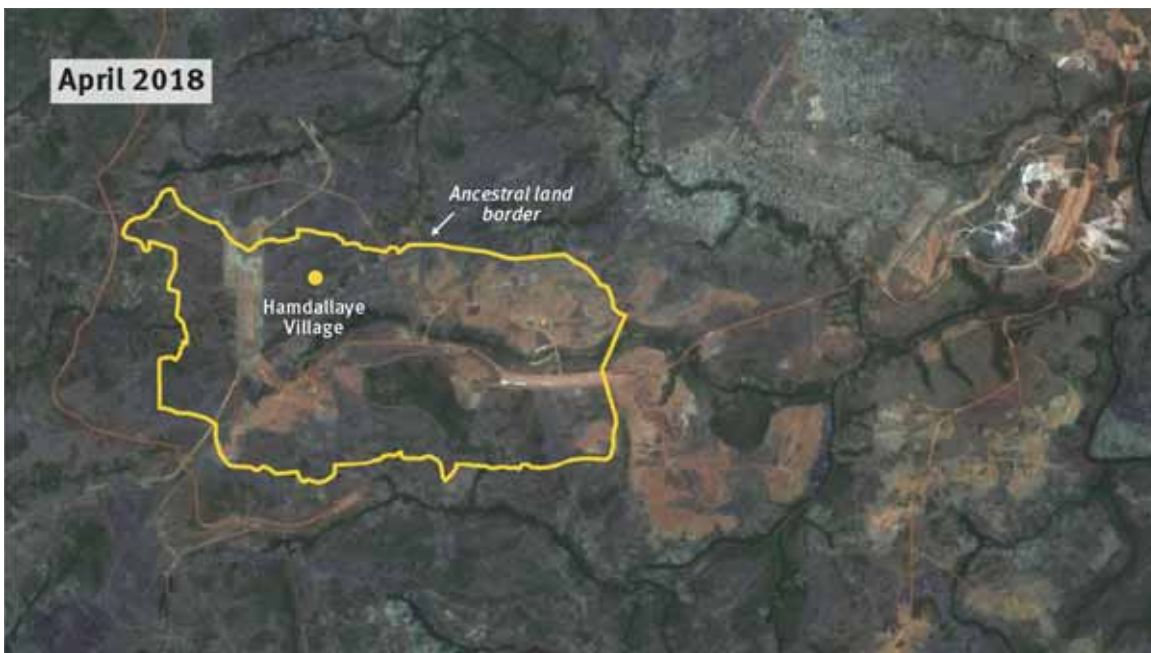
Two satellite images, one from May 2002 and another from April 2018, show how the mining operations of La Compagnie des Bauxites de Guinée (CBG) have encroached onto the ancestral lands of Hamdallaye village. The ancestral lands are marked with a yellow border.