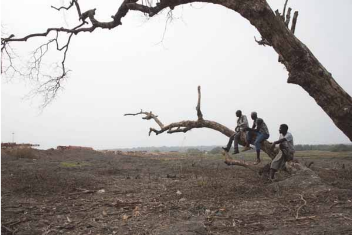
Farmers from Dapilon village, in the Boké region, look out over land, on the banks of the River Nunez, cleared for the construction of a mining port belonging to the La Société Minière de Boké consortium.

Although women participate in farming, the bulk of compensation for communal or familial land is often paid to men considered household heads. Land that men and women depended on and exploited is therefore replaced by financial compensation distributed only to a handful of largely male community leaders and household heads. While some men can at least obtain jobs at mining companies to replace lost income, women are rarely employed by mining companies, even though they are often responsible for finding alternative sources of food where land is lost to mining.