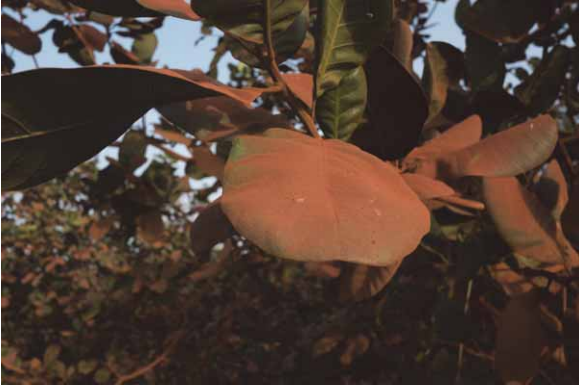
A tree covered in dust next to a mining road operated by the La Société Minière de Boké consortium. Communities state that the dust kicked up by the hundreds of trucks transporting bauxite on mining roads has reduced the productivity of surrounding trees and crops. January 2018.