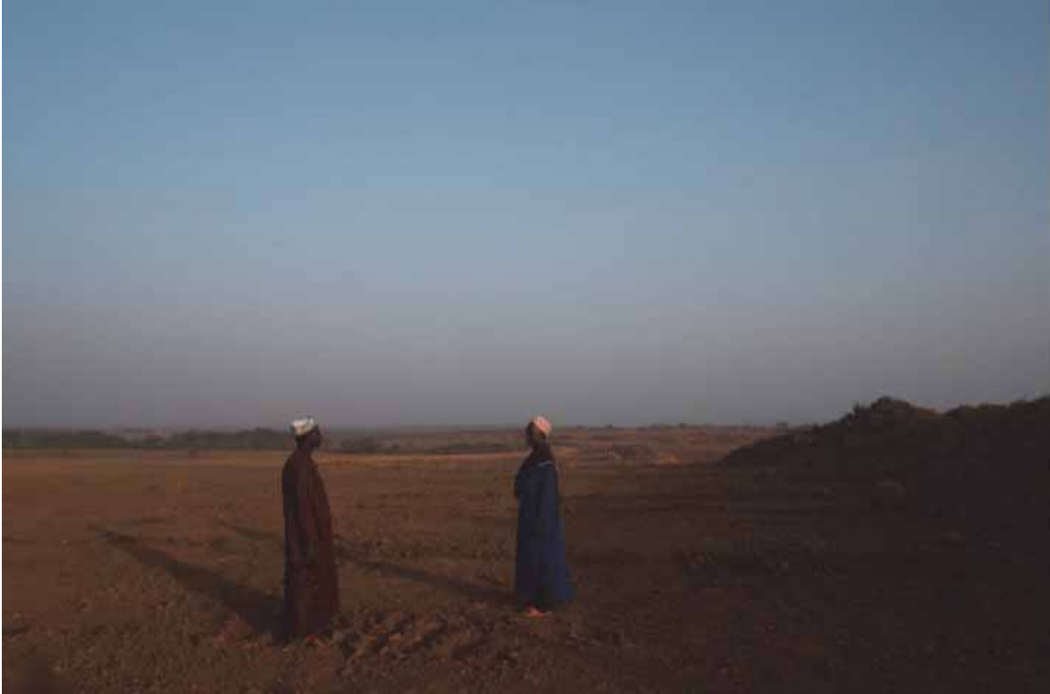
Farmers from Hamdallaye village, in the Boké region, look out over the village’s ancestral lands, which have been cleared by La Compagnie des Bauxites de Guinée for an expansion of mining operations. January 2018.