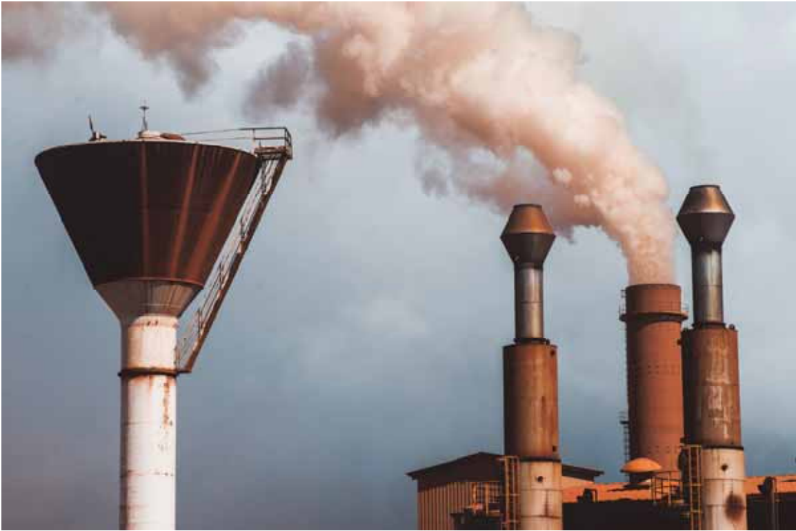
A chimney emits smoke at a bauxite treatment plant operated by Compagnie des Bauxites de Guinee (CBG) in Kamsar, Guinea, on September 7, 2015. Local leaders have long expressed concerns about the impacts of the emissions on local air quality.

emissions produced by CBG’s operations, including in residential areas, both at current production levels and as production increases during the expansion project. 375