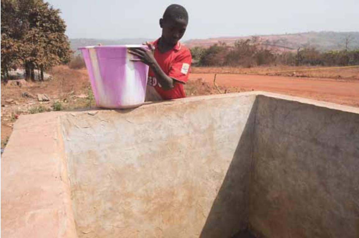
A boy fetches water from a tank used to store water delivered to Lansanayah village, in the Boké region, by tankers of Société Minière de Boké's (SMB) consortium. Villagers say that SMB's arrival damaged local natural water sources, forcing them to rely on the consortium to provide alternatives. January 2018.

availability for several years, although it began a limited monitoring program in 2018. The Guinean government in 2017 commissioned a yet-to-be-published study into the cumulative impacts of bauxite mining in the Boké region, which should provide useful information on the impacts of mining on water levels, availability and quality. 208