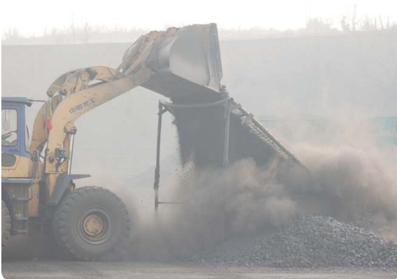
Coal digger in China.