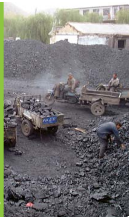
Transporting coal.