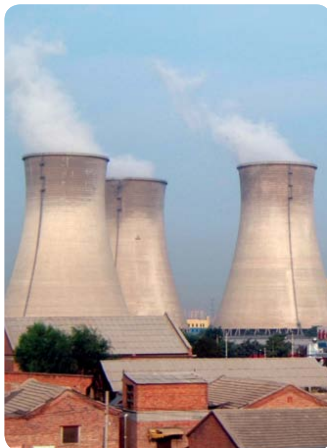
China Power Plant.

To summarize, in India and China where virtually all of the 44 coal projects in the CDM pipeline are located, government policies have mandated the use of super critical and even ultra super critical technology. Furthermore, our assessments clearly showed that just based on the technical additionality criteria of the CDM, none of the projects in the pipeline should be eligible for CDM support.