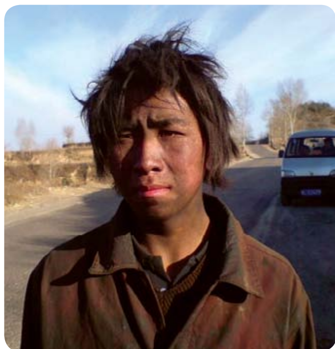
Young coal worker in Shanxi, China.

Unfortunately, dozens of new coal projects are lining up to register under the CDM simply to "add a new revenue stream" 1 to investments they are already planning to make. This policy brief outlines the impacts of coal use, explains why coal projects do not belong in the CDM and offers concrete policy solutions for the Parties of the Kyoto Protocol, the CDM Executive Board or the European Union.