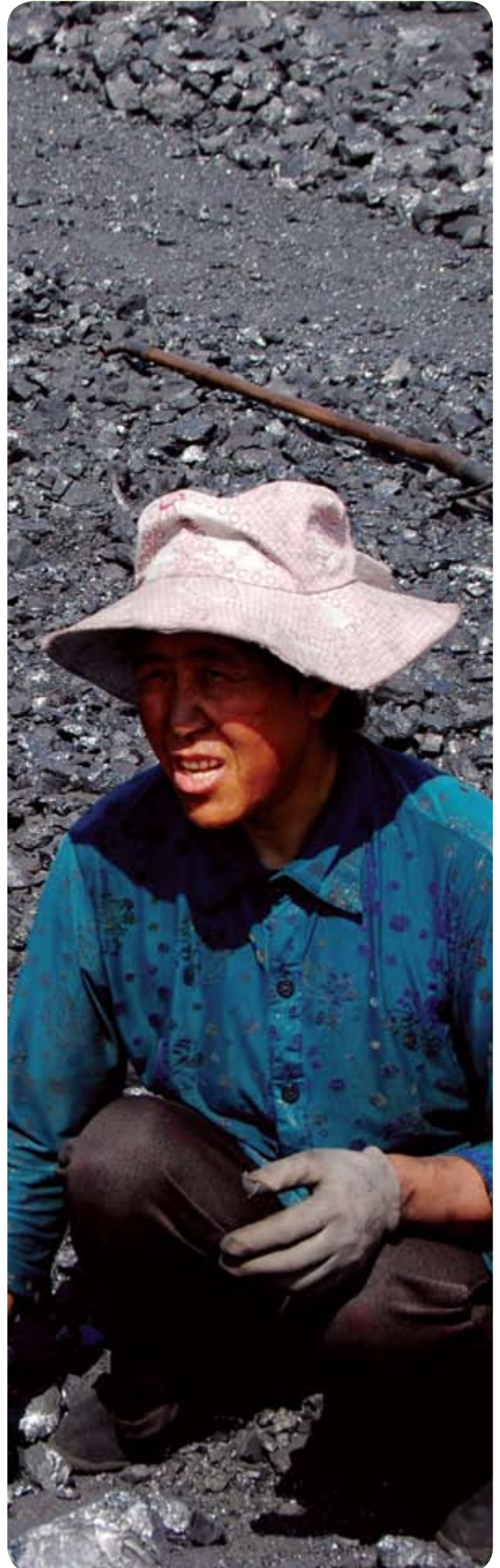
Coal workers in Shizuishan, China.

What the excerpts further highlights is that Indian coal projects use CDM revenues to reduce their tariffs to under-bid competitors. The CDM may help these companies win government construction bids yet no additional emissions reductions will be achieved since the government already stipulated the use of supercritical technology.