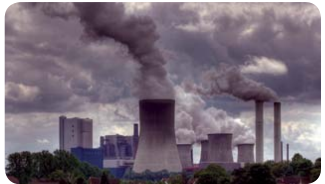
Coal plant.

Moreover, companies can receive EUR 20-24 for every ton of coal equivalent saved. 31 The government now aims to control the growth of the coal industry and cap annual production capacity at 3.8 billion tons by 2015. 32 The cost of coal accounts for 60-80% of Chinese power producers’ costs. Taken in combination, these and other policies provide strong incentives to economise fuel consumption by investing in more efficient coal burning technology. According to the IEA, super and ultra super critical coal technology will be the norm for plants built in the coming years. About 95 super critical or ultra super critical units, each with a capacity of 600 MW or higher, had been put into operation by 2007 with another 70 to be finalised by 2010. 33